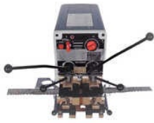
Bandsaw Blade Welding Machine