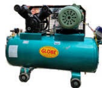
Globe 2HP HND2VB Air Compressor