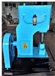
A Pneumatic Forging Press