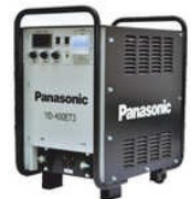
400 ET3 Panasonic Welding Machine