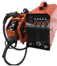
270AMPS 3PH Mig Welding Machine