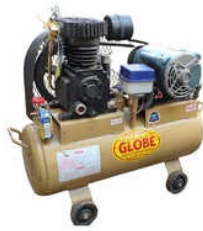
1HP Compact Global Sound Less Machine