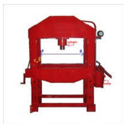
MANUAL HYDRAULIC PRESS

IHP Compact Global Sound Less Machine, 270AMPS 3PH Mig Wleding Machine, 2TN Wire Rope Hoist, 400 ET3 Panasonic Welding Machine, 400Aps 3PH Inverter Welding, 6FT Norton Lathe Backside, A Plate Bending Machine, A Pneumatic Forging Press, Airless Spray Painting Unit EIS, B 4FT Universal Sheet Folding Machine, BOSCH MT Range Power Tool, Bandsaw Blade Welding Machine, Butt Welding, D 80Tn Hydraulic Press Machine, Electric Winch, etc.