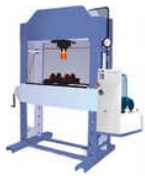
Electric Hydraulic Press Motorised