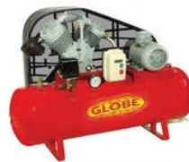
Globe Air Compressor Complete Range