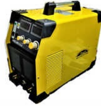
400Aps 3PH Inverter Welding