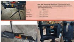
HBB2 A Bus Bar Bending Machine