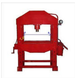
D 80TN HYDRAULIC PRESS MACHINE