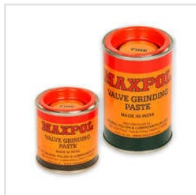
Valve Grinding Paste