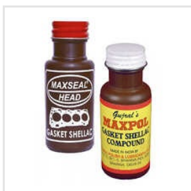
Gasket Shellac Compound