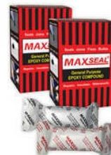
MAXSEAL GENERAL PURPOSE EPOXY COMPOUND