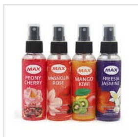
Car Air Freshners