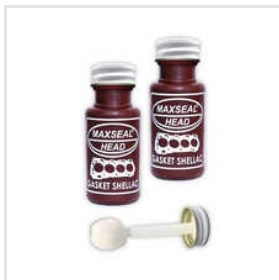
Maxseal Gasket Shellac