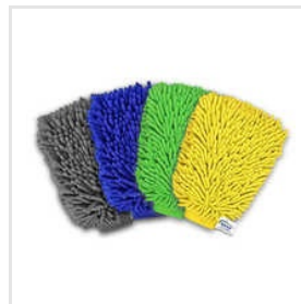
Microfiber Wash Mitt