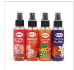
Car Air Freshners