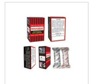
General Purpose Epoxy Compound