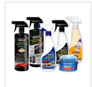
Car Polishes Kit