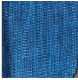
Cotton Knitted Lower Fabric