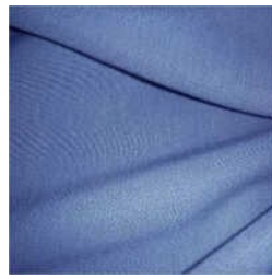
Spun Fleece Knitted Fabric