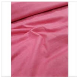
Spun Sinker Fabric