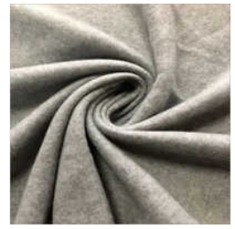
Melange Fleece Fabric