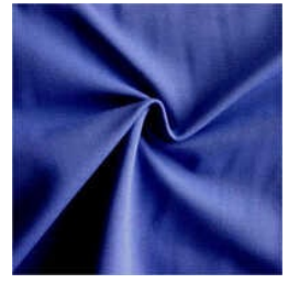
Lycra RIB Fabric