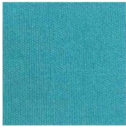
Plain Knitted Fabric