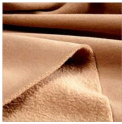
Polycotton Fleece Fabric