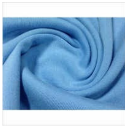
PC Sinker Fabric