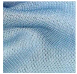
Knitted Cotton Pique Fabric