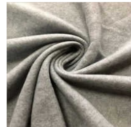
MELANGE FLEECE FABRIC