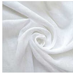
Cotton Light Weight Fabric