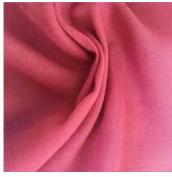
Airjet Cotton Fabrics