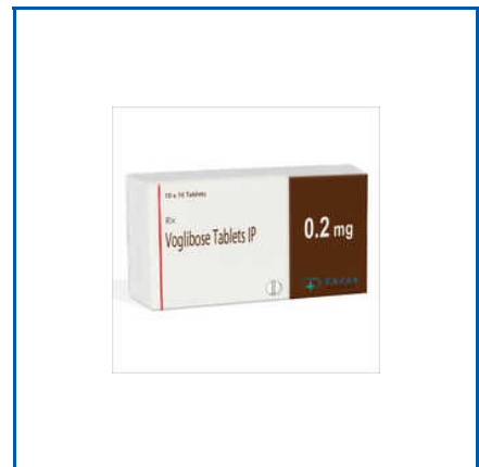
VOGLIBOSE TABLETS IP