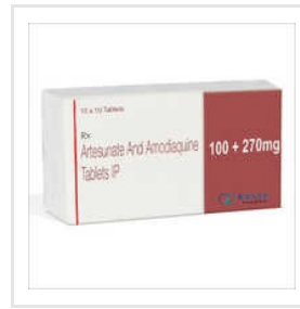
Artesunate And Amodiaquin Tablets