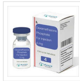
Dexamethasone Phosphate Injection