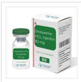
Drotaverine HCL Injection