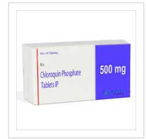
Chloroquine Phosphate Tablets