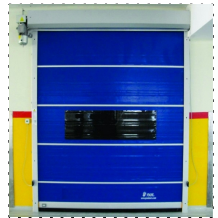
High Speed Door for Warehouses

High speed cleanroom doors are ideal to build airlocks. Their flexible PVC door curtain resists to pressure differences and keeps your cleanroom in under or overpressure. Cleanroom doors have an aesthetical and slim design. They require little space and can easily be installed in tight places.