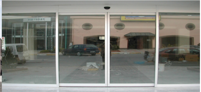
Automatic Sliding Doors