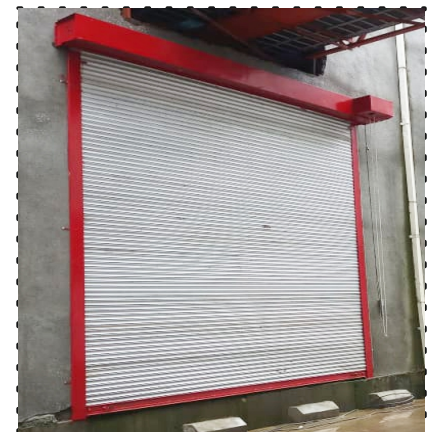
Automatic Rolling Shutters