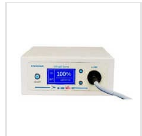
220V LED Light Source