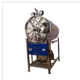
SS Horizontal Autoclave