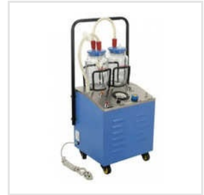
SS Vacuum Suction Machine