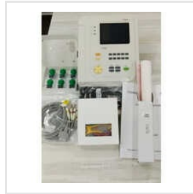
CM 1200B 12 Channel ECG Machine