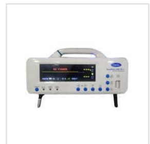
Clarity Table Top Pulse Oximeter