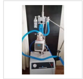
Bubble CPAP Delivery System With Blender