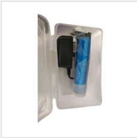
Hospital Vein Finder With Charger