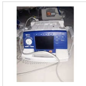
Automatic Biphasic Defibrillator