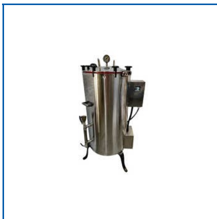
STAINLESS STEEL VERTICAL AUTOCLAVE

2 In 1 Baby Weighing Scale, 220V LED Light Source, 4 Liter Vertical Autoclave, 80GSM ECG Paper Roll, Automatic Biphasic Defibrillator, Bubble CPAP Delivery System With Blender, Bubble CPAP With Compressor, C Arm Compatible Fully Electric OT Table, C Arm Compatible OT Hydraulic Table, CM 1200B 12 Channel ECG Machine, Clarity Table Top Pulse Oximeter, Digital Baby Weighing Scale, Double Surface LED Phototherapy, Handheld Pulse Oximeter, Hospital OT Light, etc.