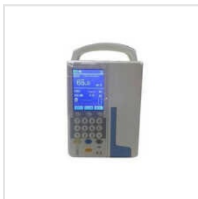
PVC Infusion Pump