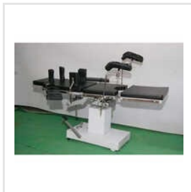
Manual OT Table