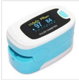
Omron Pulse Oximeter