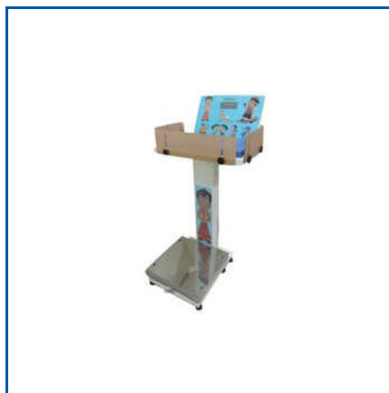
2 IN 1 BABY WEIGHING SCALE