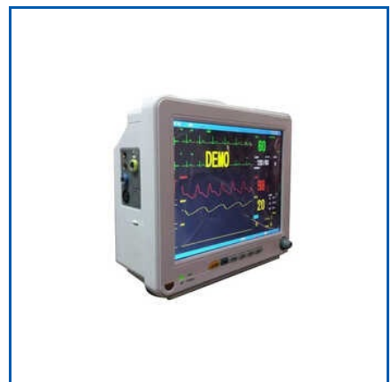
MULTIPARA PATIENT MONITOR