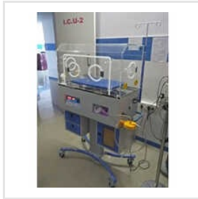
SS Baby Incubator