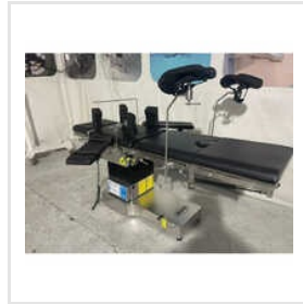
C Arm Compatible Fully Electric OT Table