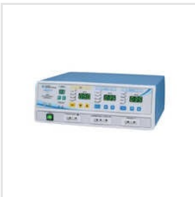
Smart 4Plus Electro Surgical Generator