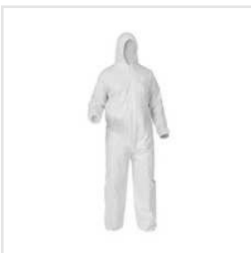
Surgical PPE Kit