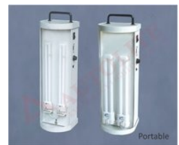
Portable Non-Maintained Lights