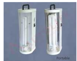
Portable Non-Maintained Lights