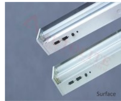
Non Maintained Lights