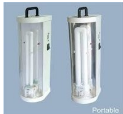
Portable Non-Maintained Lights