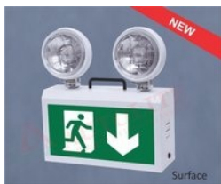
Portable Non-Maintained Multi Lights