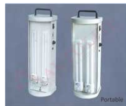
Portable Non-Maintained Lights