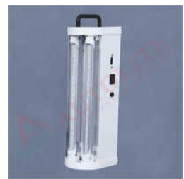
LED Portable Non-Maintained Lights