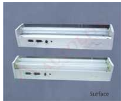
Non- Maintained Lights