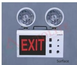
Portable Non-Maintained Multi Lights