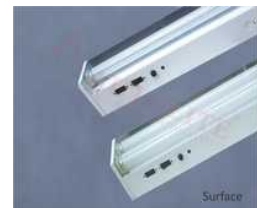
NON- MAINTAINED LIGHTS