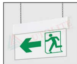
Sleek Exit / Egress (Edgelit) Lights