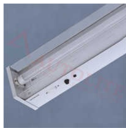
LED Non - Maintained Lights