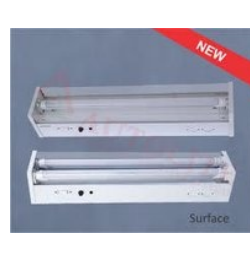
LED Non-Maintained Lights