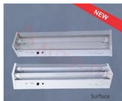
LED Non-Maintained Lights