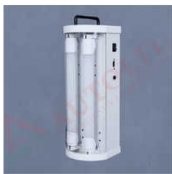
LED Portable Non-Maintained Lights