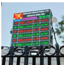
Industrial LED Display