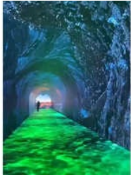
Curved LED Display