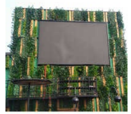
Advertising LED Display