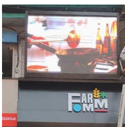
Outdoor LED Display