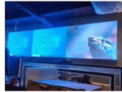
Indoor LED Display