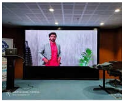
Auditorium LED Display