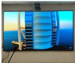
Conference Room LED Display