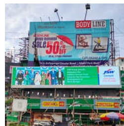
Customised LED Display Solutions