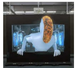
3D LED Display