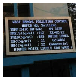
Single Color LED Display