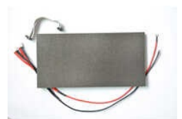
P-2.5 Indoor LED Module