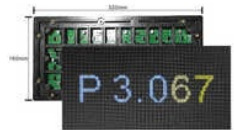
P-3 Indoor LED Module