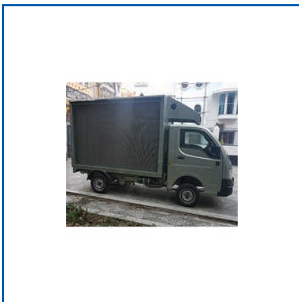
LED PROMOTIONAL VAN

3D LED Display, Advertising LED Display, Auditorium LED Display, Conference Room LED Display, Curved LED Display, Customised LED Display Solutions, Huidu Control Card and Processor, Huidu Receiving Card, Indoor LED Display, Indoor LED Video Wall, Industrial LED Display, LED Advertising Display Screen, LED Promotional Van, LED Standby Display, LED Video Van Rental Services, etc.