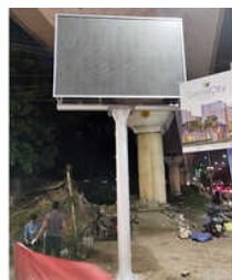
Pole Mounted LED Display