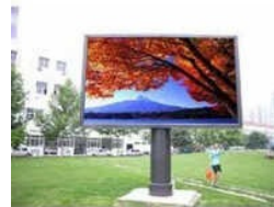
LED Advertising Display Screen