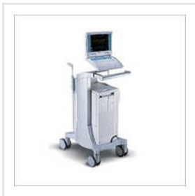
CS300 IABP MAQUET Datascope