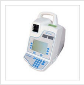
Medtronic ACT Plus Coagulation Analyzer