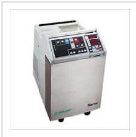
Terumo Sarns TCM II Heater Cooler