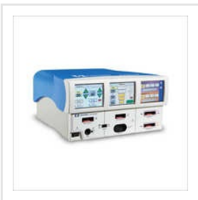
Valleylab Force Triad Electrosurgical Unit