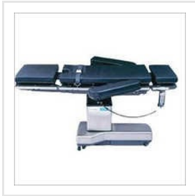
3085SP Steris Amsco Surgical Table