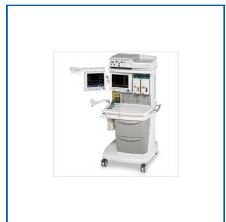
GE DATEX -OHMEDA AVANCE ANESTHESIA MACHINE