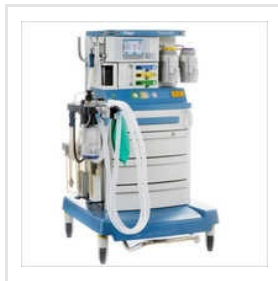
Drager Fabius GS Anesthesia Machine