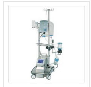
Sorin ECMO Centrifugal Pump System