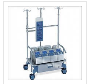
Sorin Stockert S5 Heart Lung Machine