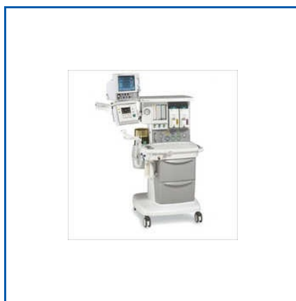
GE DATEX AESTIVA 5 ANESTHESIA MACHINE