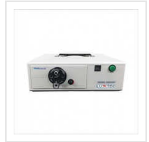
Luxtec 9300 XDP- XSP Headlight System