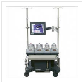
Terumo Sarns System 1 Heart Lung Machine