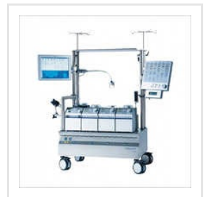
MAQUET Jostra HL 20 Heart Lung Machine