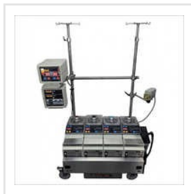
8000 Terumo Sarns Modular Perfusion