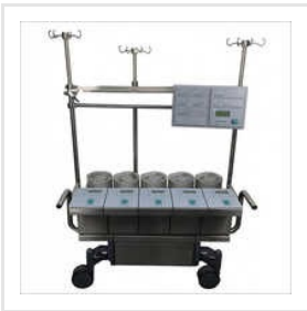
Stockert SIII Encore Heart Lung Machine