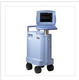
Arrow Acat 2 Wave Intra Aortic Balloon