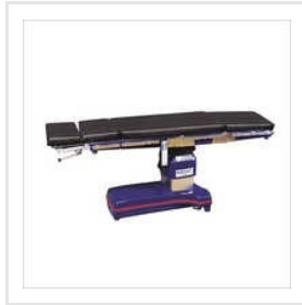
Maquet Alphastar Surgical Table