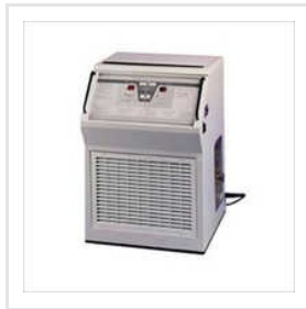
CSZ Hemotherm 400 MR Heater Cooler