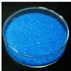
Copper Sulphate Powder