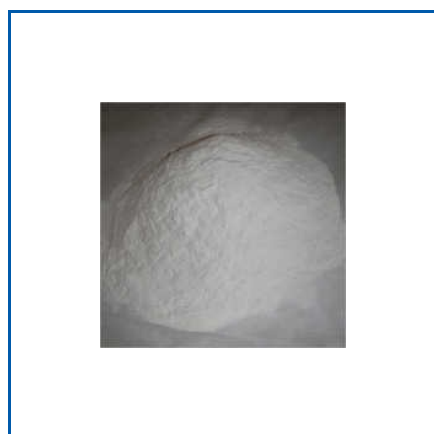
CALCIUM FORMATE POWDER

Calcium Acetate, Calcium Acetate Pharmaceutical Grade, Calcium Chloride, Calcium Chloride Anhydrous Powder, Calcium Formate, Calcium Formate Powder, Copper Sulphate Lumps, Copper Sulphate Powder, Diloxanide Base (D-Base), Disodium Phosphate, Ketonic Resin, Magnesium Chloride Flakes, Magnesium Sulphate Heptahydrate, Manganese Sulphate Monohydrate, Metol Powder, etc.