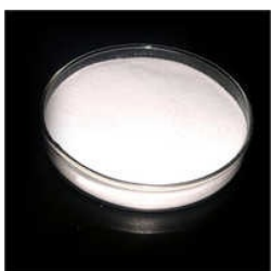
Sodium Acetate Anhydrous