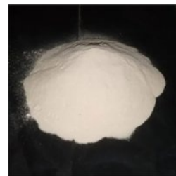
Diloxanide Base (D-Base)