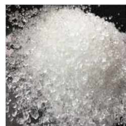
Sodium Acetate Trihydrate