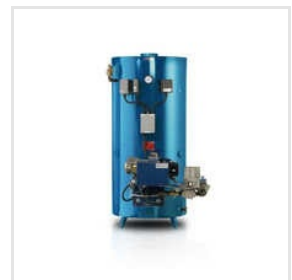
Industrial Hot Water Boiler