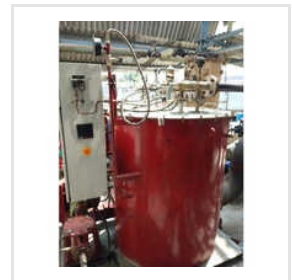
Oil Fired Thermic Fluid Heater