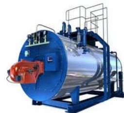
2000 KG OIL FIRED STEAM BOILER