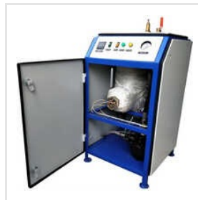
Industrial Hot Water Boiler