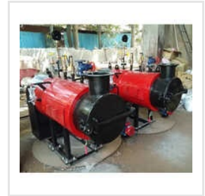
IBR Wood Sawdust Steam Boiler