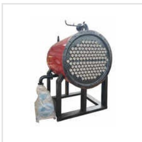
Electric Thermic Fluid Heater