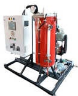
MS ELECTRIC STEAM BOILER

2000 Kg Oil Fired Steam Boiler, 3000 Kg Oil Fired Steam Boiler, Carbon Steel Steam Vessel, Coal Fired Hot Water Boiler, Electric Thermic Fluid Heater, Electrode Steam Boiler, IBR Oil Fired Steam Boiler, IBR Wood Sawdust Steam Boiler, Industrial Electric Steam Boiler, Industrial Hot Water Boiler, Industrial Stainless Steel Reactor, MS Electric Steam Boiler, Mild Steel Coil Type Steam Boiler, Mild Steel Hot Air Generator, Mild Steel Thermic Fluid Heater, etc.