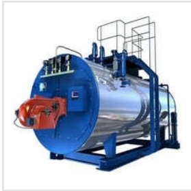
Oil Fired Steam Boiler