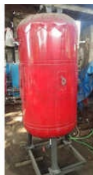
VERTICAL STEAM RECEIVER