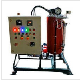
Electrode Steam Boiler