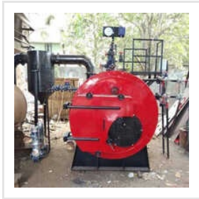
Wood Fired Steam Boiler