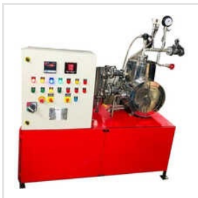
Stainless Steel Electric Steam Boiler