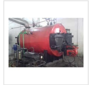
IBR Oil Fired Steam Boiler