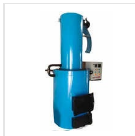
Coal Fired Hot Water Boiler