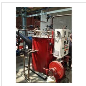
Mild Steel Thermic Fluid Heater