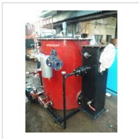
Industrial Electric Steam Boiler