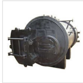
Wood Fired Steam Boiler