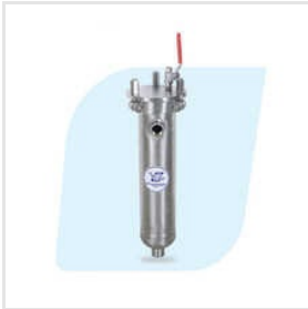
9inch Bag Type Inline Filter