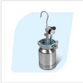
Pressure Feed Pot