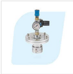
Pneumatically Operated High