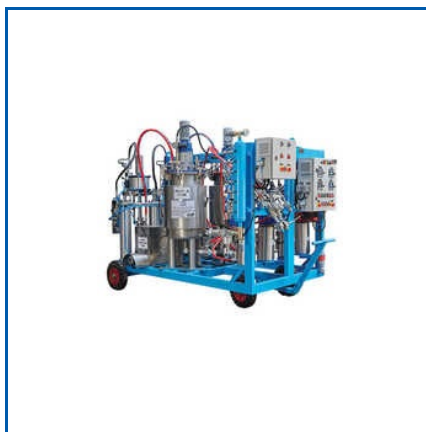
FIRE PROTECTION HIGH PERFORMANCE AIRLESS SPRAY SYSTEM