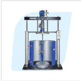
200ltr Barrel Paint Preparation Unit