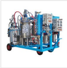
Fire Protection High Performance Airless