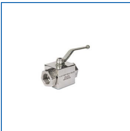
PRESSURE MANUAL VALVES BALL VALVES

1inch Cartridge Type Inline Filter, 1inch Pulsation Dampner, 200ltr Barrel Paint Preparation Unit, 2inch Pulsation Dampner, 350 Bar High Pressure Filter, 400B Aluminium Automatic Airless Spray Gun, 450 Bar High Pressure Filter, 9inch Bag Type Inline Filter, AM250 Airless Manual Spray Gun, Airless Manual Spray Gun Eagle, Airless Manual Spray Gun Falcon, Airless Manual Spray Gun Vril, Aluminium Automatic Airless Spray Gun, Aluminium Automatic Dispensing Gun Vriad, Aluminium Low Pressure Filter, etc.