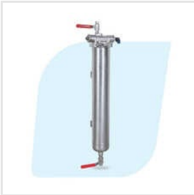
1inch Cartridge Type Inline Filter