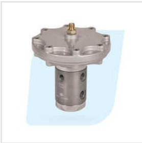
Pneumatically Operated High