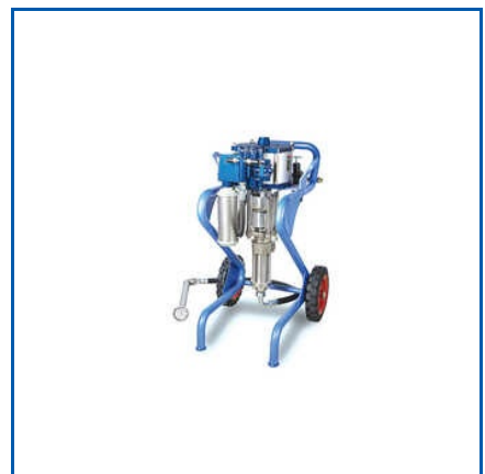
RHINO HEAVY DUTY AIRLESS SPRAY PAINTING MACHINE