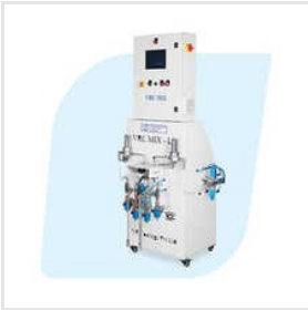
Vrc Mix Low And Medium Pressure