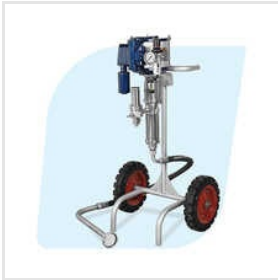
Tiger Low And Medium Duty Airless Spray