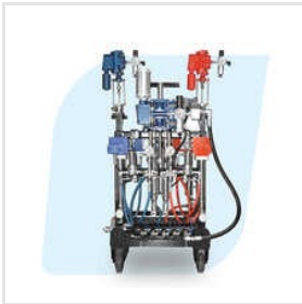
Polyurea Two Component Hot Airless