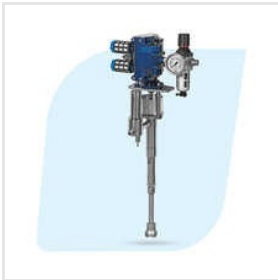
Mini Tiger Airless Air Assisted Spray