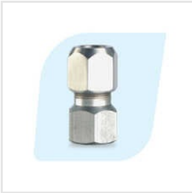
Tip Filter Assembly