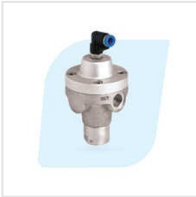
Pneumatically Operated Low Pressure