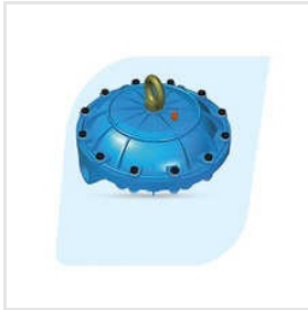
2inch Pulsation Dampner