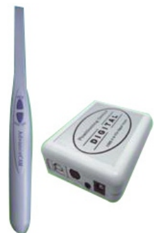
Intra Oral Box