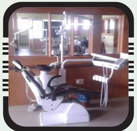
Alfa Dental Unit