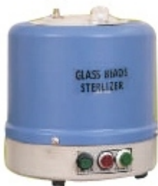
Hot Glass Bead Sterilizers