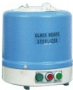
Glass Beads Sterilizer