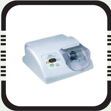
Dental Cure Amalgamator