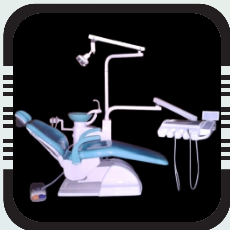
Alfa Deluxe Dental Chair