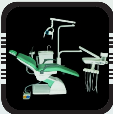
Sigma Programmable Dental Chair