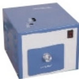
Needle Burner Cum Syringe Cutter