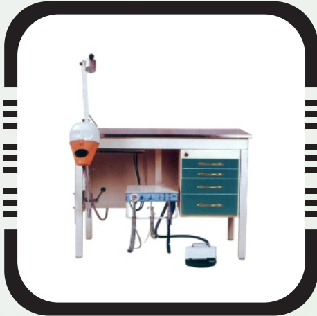
Dental Phantom Head Table