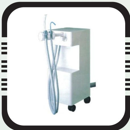
High Vac Mobile Suction