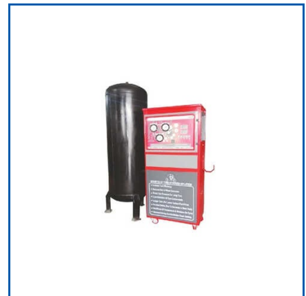
NITROGEN TYRE INFLATOR FOR TRUCK