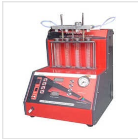
Petrol Injector Cleaner And Tester Machine