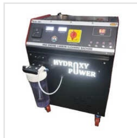
Hydroxy Power Autonics HHO Engine