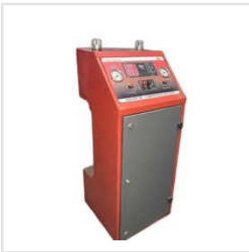
Engine Decarbonizing Machine