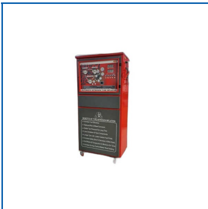
NITROGEN GENERATOR AND TYRE INFLATOR

Air Conditioning Recovery Machine, Alternator Starter Test Bench, Automobile Pneumatic Engine Oil Extractors, Automotive Petrol KPL Tester, Autonics Coolant Flushing Machine, Autonics Headlight Beam Aligner, Autonics Hydroxy Power Engine Decarb Machine for Bike and Cars, Bike Carbon Cleaner, Brake Bleeding Machine, Car Dent Puller Machine, Car Paint Booth, Car Spray Paint Booth, Dent Puller Machine Autonics, Digital Tyre Inflator, Digital Tyre Pressure Gauge, etc.