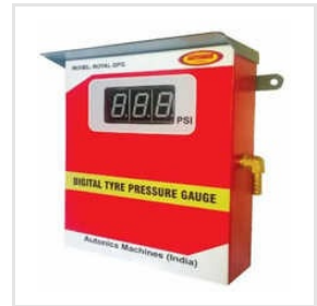
Digital Tyre Pressure Gauge