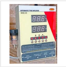
Fully Automatic Tyre Inflator