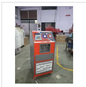
Air Conditioning Recovery Machine