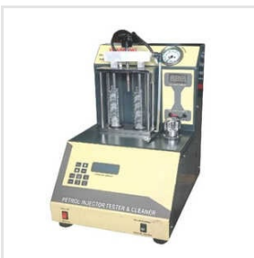
Motorcycle Fuel Injector Cleaner