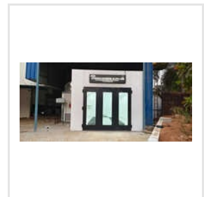
Car Paint Booth