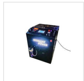
Hydroxy HHO Engine Decarbonizing