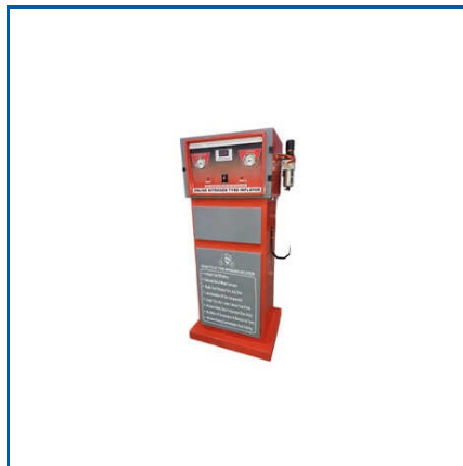
NITROGEN FILLING MACHINE