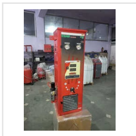
Online Nitrogen Tyre Inflator