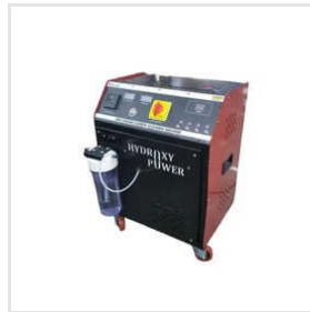
Bike Carbon Cleaner