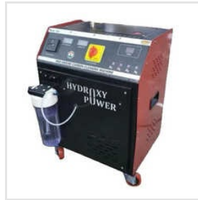
Autonics Hydroxy Power Engine Decarb