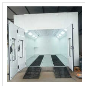
Dent Puller Machine Autonics