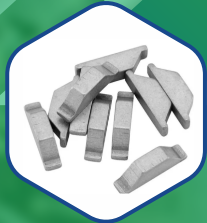
Timing Pinion Woodruff Key