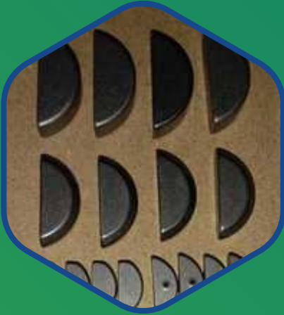
Customised Parallel Keys