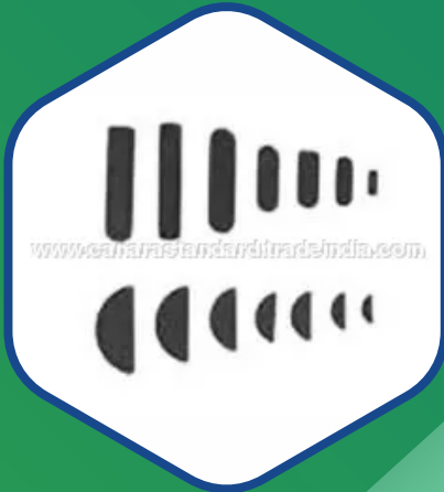
Polished Woodruff Keys