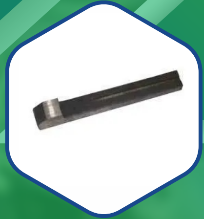
Gib Head Taper Keys