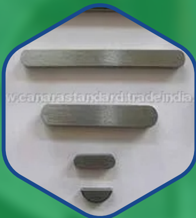
Stainless Steel Parallel Keys