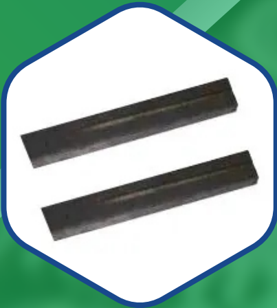
Industrial Taper Key