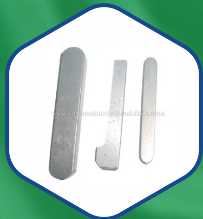
Gee Ess Parallel Keys