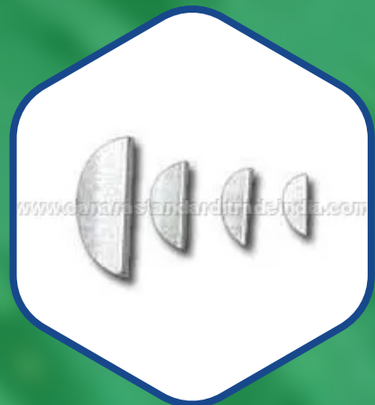
Special Woodruff Keys