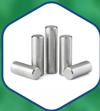
Bearing Steel Parallel Pins