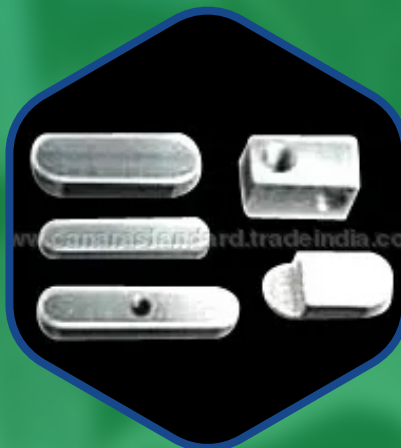
Industrial Parallel Keys