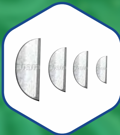
Industrial Woodruff Keys