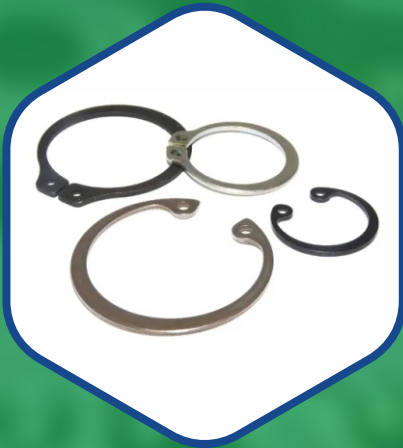
Parallel Key Tool