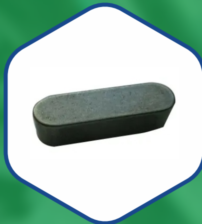
Flat Parallel Key