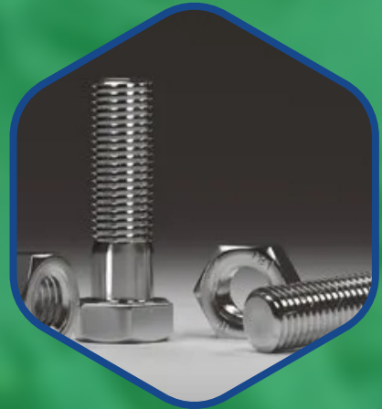
MS Nuts And Bolts