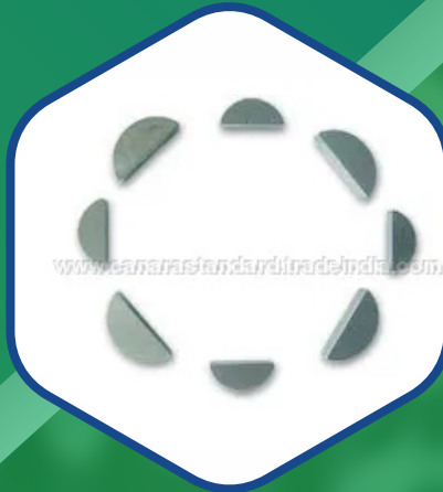
Camshaft Woodruff Keys