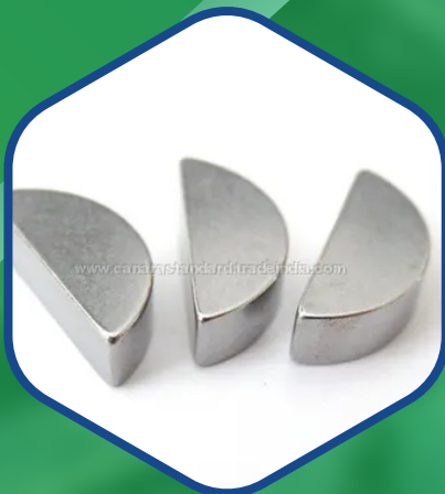
Customized Woodruff Keys