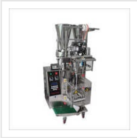
Granule Pouch Packing Machine