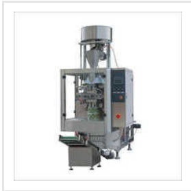
Granules Packing Machine