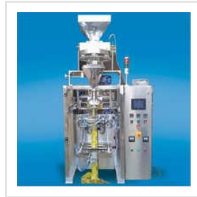
Packet Packing Machine