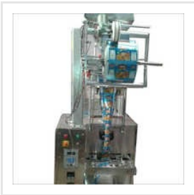
Pouch Packing Machine 200 Gram