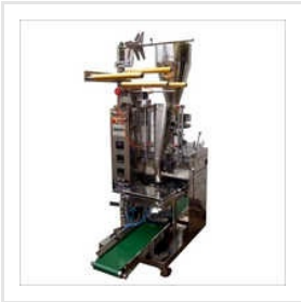
Weighmetric Filling Machine