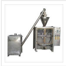
Grain Rice Packing Machine