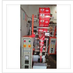
Automatic Packing Machine