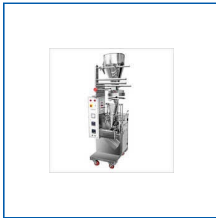
SPICES POUCH PACKING MACHINE