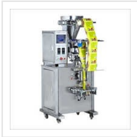
Snacks Packing Machine