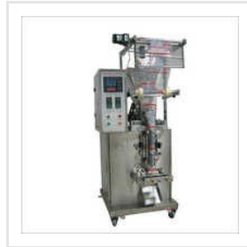
Automatic Pouch Packing Machine