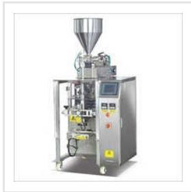
Pulses Packing Machine