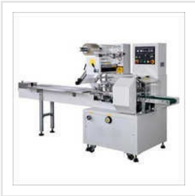
Horizontal Flow Wrap Packing Machine