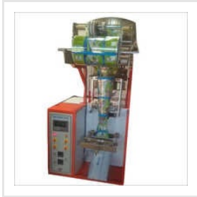
Automatic Powder Packing Machine