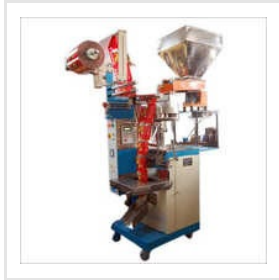
Masala Pouch Packing Machine