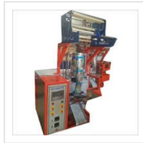
Pneumatic Pouch Packing Machine