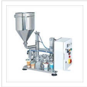
Cup Filling Machine