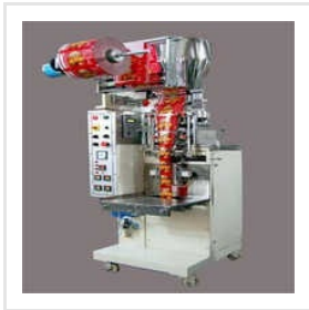
100 Gram Pouch Packing Machine