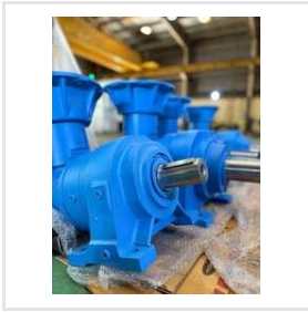
Bevel Planetary Gearbox