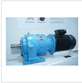
Planetary Geared Motor