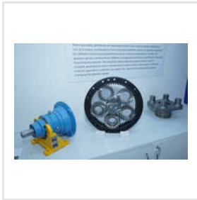
CPT Planetary Gearbox