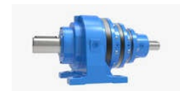
FOOT MOUNTED PLANETARY GEARBOX