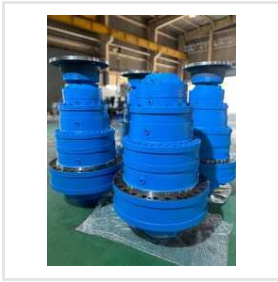
Heavy Duty Planetary Gearbox