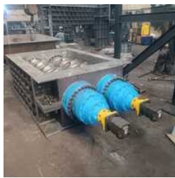
PLANETARY GEARBOX FOR SHREDDER

Bevel Planetary Gearbox, CPT Planetary Gearbox, Foot Mounted Planetary Gearbox, Gearbox For Rubber Machinery, Heavy Duty Planetary Gearbox, Industrial Planetary Gearbox, PMSM Permanent Magnet Synchronous Motor, Planetary Gearbox For Shredder, Planetary Geared Motor, Shaft Mounted Planetary Gearbox For Sugar Mills, etc.