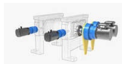
GEARBOX FOR RUBBER MACHINERY