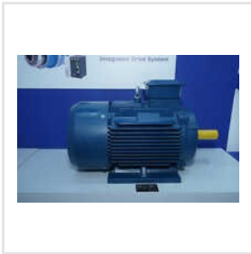
PMSM Permanent Magnet Synchronous