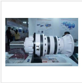
Industrial Planetary Gearbox