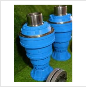
Shaft Mounted Planetary Gearbox For