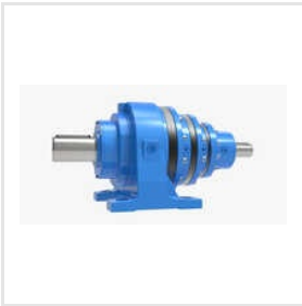
Foot Mounted Planetary Gearbox