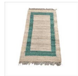
HAND WOVEN JUTE HAMP CARPETS