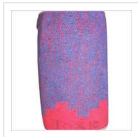
Cotton Handloom Durries