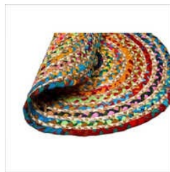
BRAIDED JUTE AND COTTON ROUND