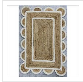
Braided Jute Ractangle Rug