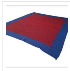
Printed Cotton Handloom Durries