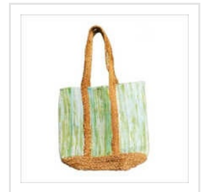
Jute Handmade Bag