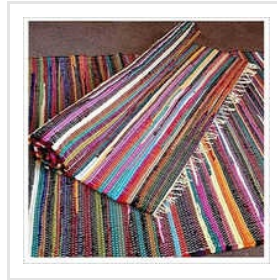
Handwoven Multi Chindi Rug