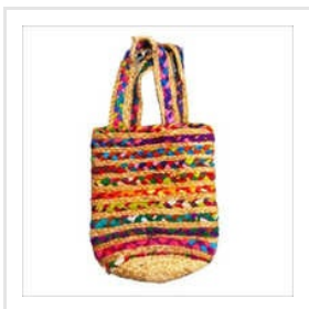
Loop Handle Handmade Jute Bag