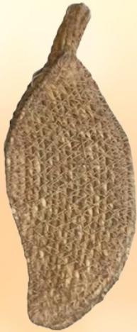
DECORATIVE JUTE BASKET