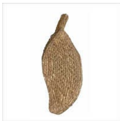
DECORATIVE JUTE BASKET

Braided Jute And Cotton Round, Braided Jute Rectangle Rug, Cotton Chindi Rug, Cotton Durries, Cotton Handloom Durries, Cotton Jute Handloom Rugs, Decorative Cushions, Decorative Jute Basket, Hand Woven Jute Hamp Carpets, Hand Woven Jute Rugs, Handwoven Leather Jute Rug, Handwoven Leather Rug, Handwoven Multi Chindi Rug, Jute Durries In Shuttle Weave, Jute Handmade Bag, etc.