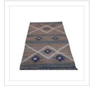
Jute Durries In Shuttle Weave