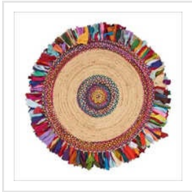
Cotton Jute Handloom Rugs