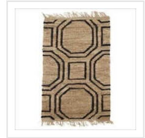
Hand Woven Jute Rugs