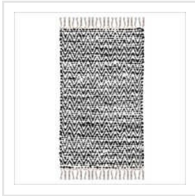
Cotton Chindi Rug