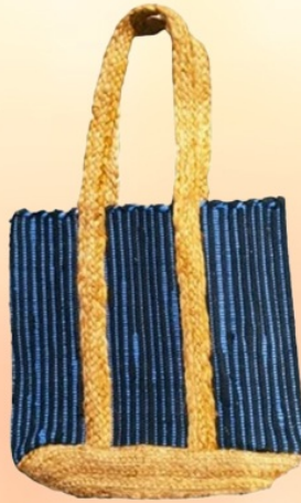
HANDMADE JUTE BAG