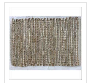
Handwoven Leather Jute Rug