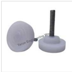
HDPE Furniture Level Adjuster