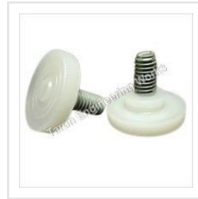
Base Metal Adjuster