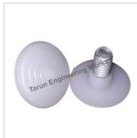
Foot Level Adjuster