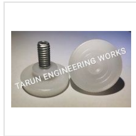
Leveling Foot Adjuster