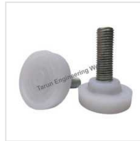
16mm Furniture Leveling Adjuster