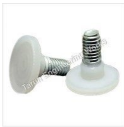
FURNITURE LEVELING ADJUSTER

1.5inch White Plastic Threaded Level Adjuster, 100mm Mild Steel Adjuster, 16mm Furniture Leveling Adjuster, 46.5mm Level Adjuster, Almira Level Adjuster, Base Metal Adjuster, Black Furniture Level Adjuster, Black Rectangular End Cap, Black Round Furniture Level Adjuster, etc.