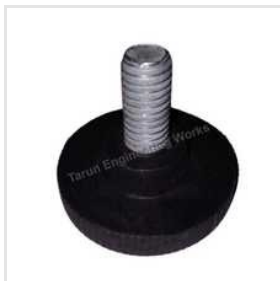
Black Round Furniture Level Adjuster