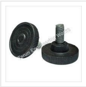
Furniture Level Adjuster