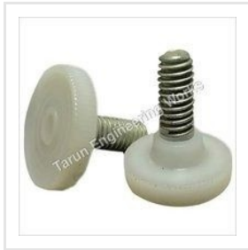
Level Adjuster Foot