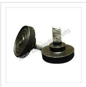
Black Furniture Level Adjuster