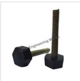
46.5mm Level Adjuster