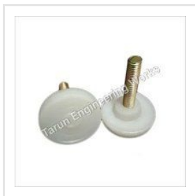
Furniture Glide Leveling Foot Adjuster