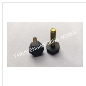
Hexagon Shape Knob