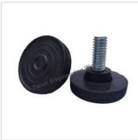
Furniture Glide Leveling Foot Adjuster