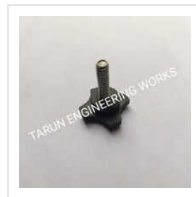
TEW PP 18mm Knob