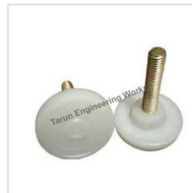
Furniture Level Adjuster