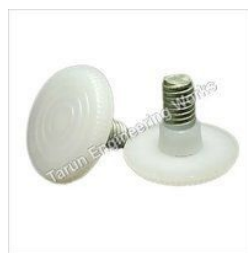
TABLE/BENCH LEVEL ADJUSTER