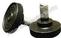
Black Furniture Level Adjuster