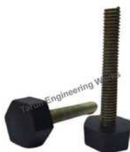
46.5mm Level Adjuster