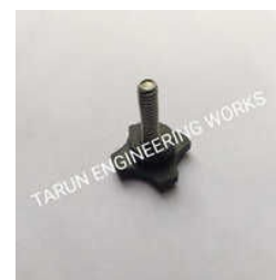
TEW PP 18mm Knob