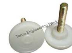
Furniture Level Adjuster