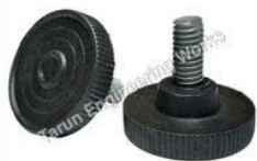
Furniture Level Adjuster