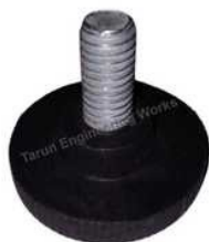
Black Round Furniture Level Adjuster