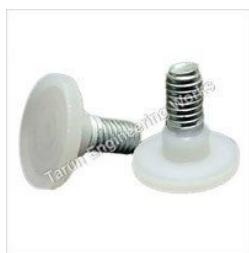
FURNITURE LEVELING ADJUSTER

1.5inch White Plastic Threaded Level Adjuster, 100mm Mild Steel Adjuster, 16mm Furniture Leveling Adjuster, 46.5mm Level Adjuster, Almira Level Adjuster, Base Metal Adjuster, Black Furniture Level Adjuster, Black Rectangular End Cap, Black Round Furniture Level Adjuster, etc.