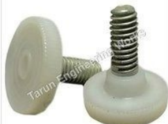
Level Adjuster Foot