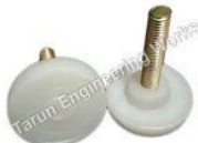
Furniture Glide Leveling Foot Adjuster