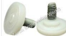
Base Metal Adjuster