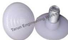
Foot Level Adjuster