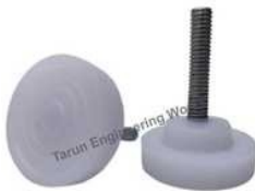
HDPE Furniture Level Adjuster