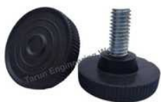
Furniture Glide Leveling Foot Adjuster