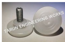
Leveling Foot Adjuster