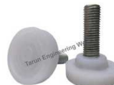
16mm Furniture Leveling Adjuster