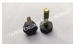
Hexagon Shape Knob