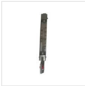
Jacketed Type Glass Tube Rotameter Device