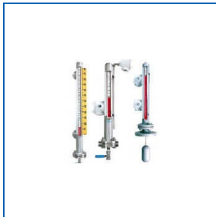
TRANSPARENT TYPE LEVEL INDICATOR