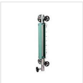
Jacketed Type Top Mounted Tubular Level