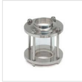
Single Window Sight Glass Indicator