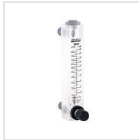
Acrylic Rotameter Device