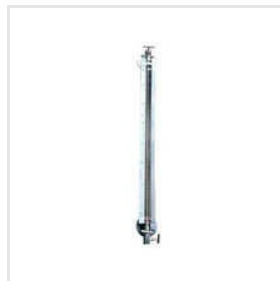
Jacketed Type Side Mounted Tubular Level