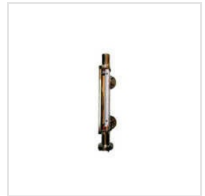
Side Mounted Tubular Level Indicator