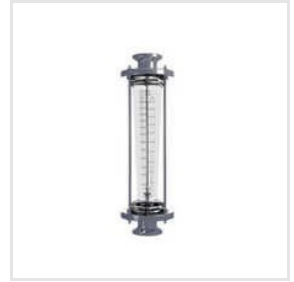
Glass Tube Rotameter Device