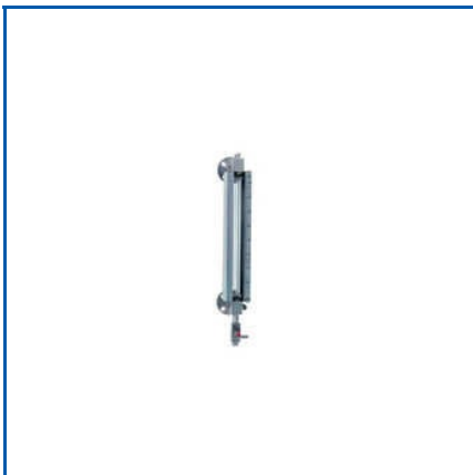
TOP MOUNTED TUBULAR LEVEL INDICATOR

Capsule Type Top Mounted Magnetic Level Indicator, Digital Flow Meter, Digital Pressure Transmitter, Displacer Type Level Switches, Float And Board Type Level Indicator, Glass Tube Rotameter, Industrial Orifice Plate Assembly, Inline Type Flame Arrestor, Industrial Flashback Arrestor, Jacketed Type Glass Tube Rotameter, Jacketed Type Side Mounted Tubular Level Indicator, Jacketed Type Top Mounted Tubular Level Indicator, Manual Ball Valve, Metal Tube Rotameter, Pneumatic Control Valve, etc.