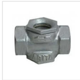
Screwed End Sight Glass Indicator