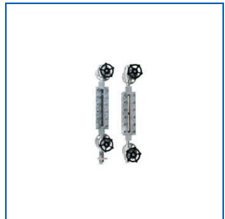
REFLEX TYPE LEVEL INDICATOR