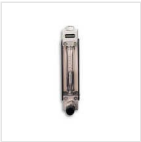
Purge Glass Tube Rotameter Device