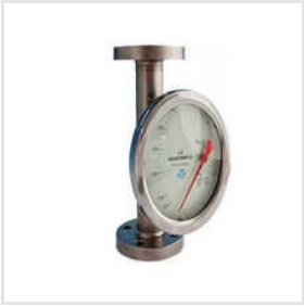
Metal Tube Rotameter Device