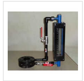
Bypass Glass Tube Rotameter Device