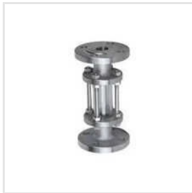
Flanged End Sight Glass Indicator