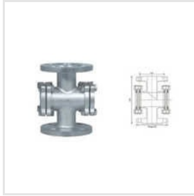
Double Window Sight Glass Indicator