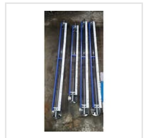
Level Glass Indicator