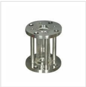
SS Sight Flow Indicator