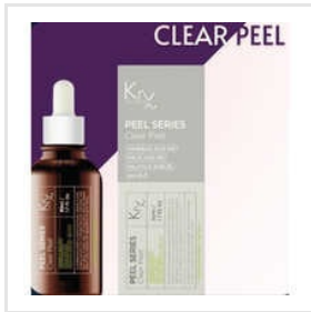
Clear Peel Kit