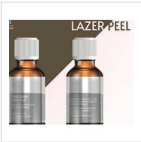
Lazer Peel Kit