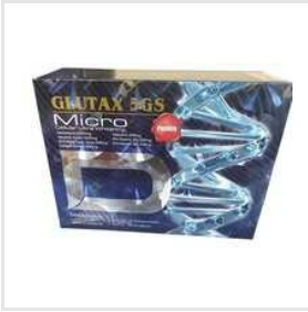
Glutax 5GS Micro Cellular Ultra