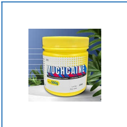
500G MUCHCAINE TOPICAL ANESTHETIC CREAM

1.5ml Aqua Plus Derma Fillers, 10 MI GFC Derma Heal Tube, 10 ml Dermaheal GFC Kit Tube, 100 IU Botox Botulinum Toxin Injection, 100 IU Daxxify Injection, 10ml GFC Kit Tube, 10ml MCCM Hair Cocktail, 10ml Vacu Plus GFC Kit Tube, 1200 Mg Cindella Skin Whitening Injections, 1200mg Lucchini Glutathione Peptide Solution, 14 In 1 Hydrafacial Machine, 15ml GFC Derma Heal Tube, 17 In 1 Hydrafacial Machine, 1ml Genoss Korea Monalisa Filler Injectable Gel, 2.5ml Hairna Exosomes Injection, etc.