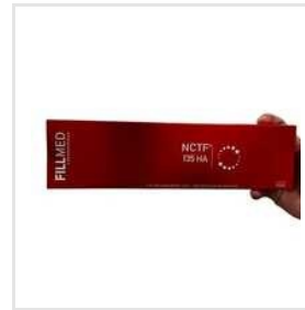
NCTF Skin Booster