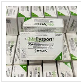
500 Unit Dysport Botox