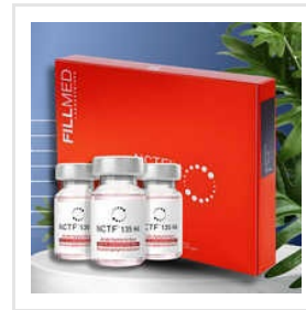
NCTF 135HA Acide Hyaluronique Haute