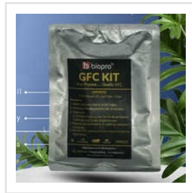
Growth Factor Concentrate Kit