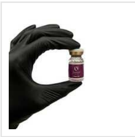
Meso Jarriot Baby Face