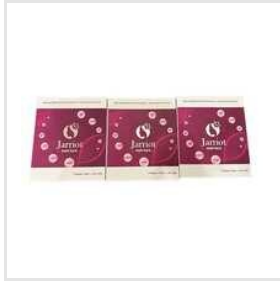
Jarriot Baby Face