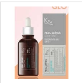
Glow Peel Kit