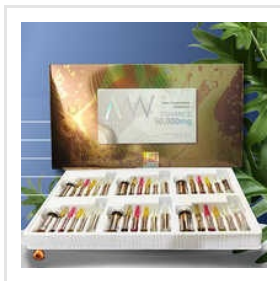
Enhance 90000mg Nano Concentrated