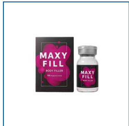
MAXY FILL BODY FILLER