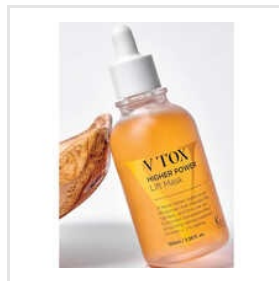
V Tox Higher Power Lift Mask Kit