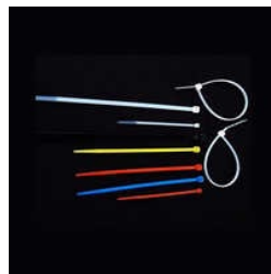
MINIATURE CABLE TIES