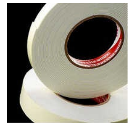
Double Side Self Adhesive Tape