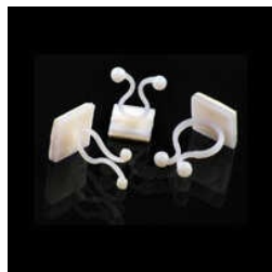
Adhesive Backed Twist Clips