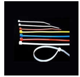
Standard Cable Ties