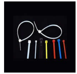
Intermediate Cable Ties