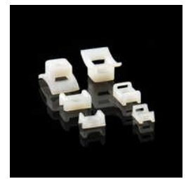
Flat Cable Clamp