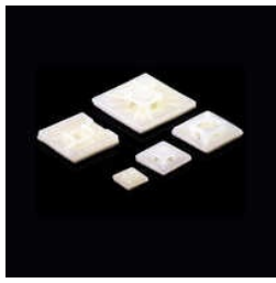
Self Adhesive Backed Tie Mounts