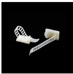
Adjustable Clamps (Ladder Type)