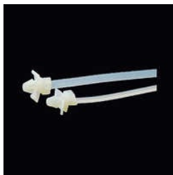
MARKER CABLE TIES

Adhesive Backed Twist Clips, Adhesive backed Wire Clips, Adjustable Clamps (Ladder Type), Adjustable P Clips, Adjustable Wire Clips, Circle Cable Clips, Degaussing Coil Holders, Double Locking Type PCB Spacers, Double side self Adhesive Tape, EHT Flower, Easy Lock Cable Ties, Flat Cable Clamp, Flat Cable Mount, Heavy Duty Cable Ties, Intermediate Cable Ties, etc.