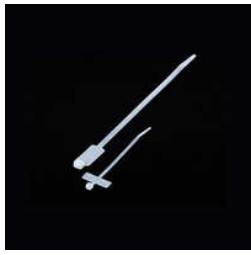
Marker Cable Ties