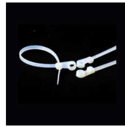
Screw Mounting Cable Ties