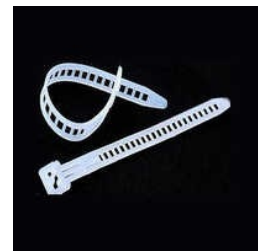
WIRE COLLECT TIES