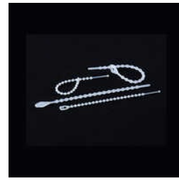
Easy Lock Cable Ties