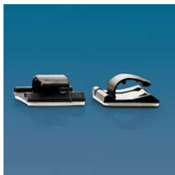
Adhesive Backed Wire Clips