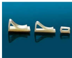
Flat Cable Mount