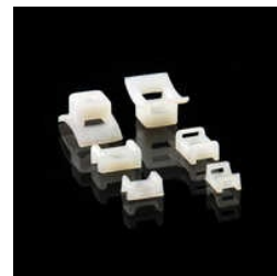
Plastic Screw Mounting Tie Mount