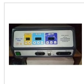
Valleylab FT10 Energy Platform