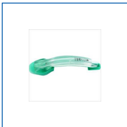
I GEL SUPRAGLOTTIC AIRWAY TUBE

3 Edan Digital Holter for Clinical, 3 Part Hematology Analyzer, 420 mg intravenous injection, 5 Part Hematology Analyzer, A Scan Biometer, ACT Machine, ACTk Abbott i-stat reagent, AED Defibrillator Pads, Abamune, Abana, Abana Medicines, Abiraterone Acetate Tablets, Acebrophyllin Capsules, Acebrophyllin Tablet, Aceclofenac and Paracetamol Tablet, etc.