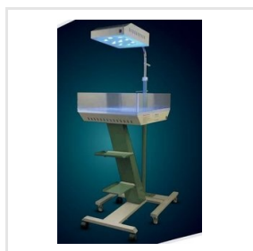
LED Based Phototherapy