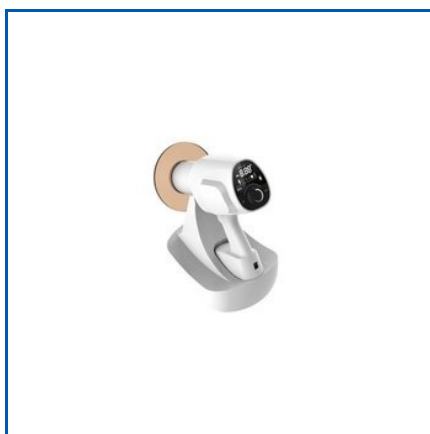
EZRAY AIR PORTABLE X-RAY