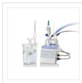
Bubble CPAP Machine