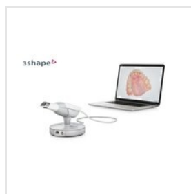
TRIOS 3 In 1 Digital Impression Scanning