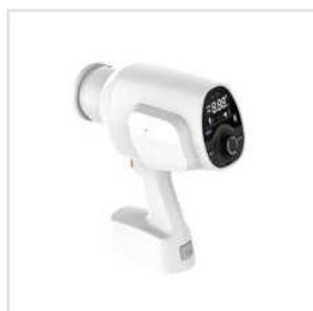
EzRay Air Portable X-Ray