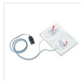
AED Defibrillator Pads