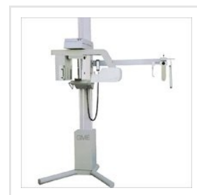
Digital OPG Odontologics Pan Ceph