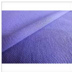
Pique Knit Fabric