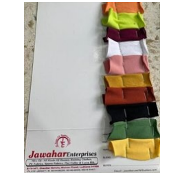
Cotton Looper Lycra Ready Shades