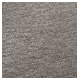
PC Interlock Fabrics