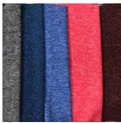
Melange Fleece Fabric