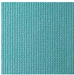
Pique Knit Fabrics