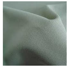
Polyester Fabric Nirmal Jali