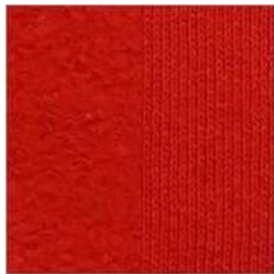
PC FLEECE FABRIC

Airjet sinker, Blue PC Sinker Fabric, Cotton Lycra Fabric, Cotton looper lycra ready shades, Dot Knit, Dry Fit Fabric, Honeycomb Fabrics, Jacquard Fabric, Matty Fabric, Melange Fleece Fabric, Nirmal Jali Fabrics, PC Fabric, PC Fleece Fabric, PC Interlock Fabrics, PC Matty Fabric, etc.