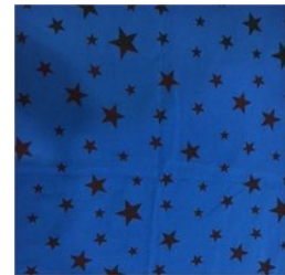
BLUE PC SINKER FABRIC