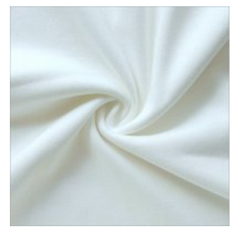
Plain Interlock Fabric