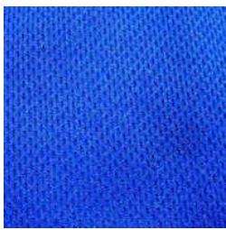
Dry Fit Fabric