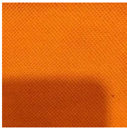
PC Matty Fabric