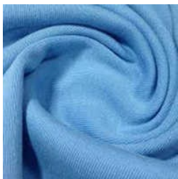
PC Sinker Fabrics