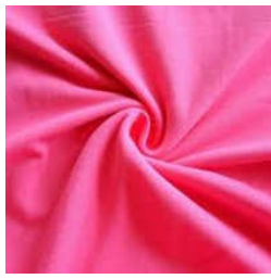
Cotton Lycra Fabric