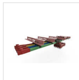
AW Bolt Joint DSL Busbar System