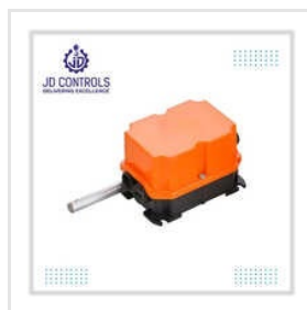
10 AMPS Worm Drive Limit Switch