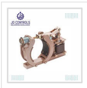
AC Solenoid Operated Brakes