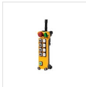
F24-8D Radio Remote Control