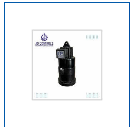
ST-520 ELECTRO HYDRAULIC THRUSTER BRAKE FOR EOT CRANE