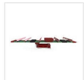
B. W DSL Busbar System