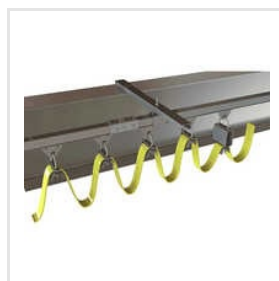
C Track Festooning System