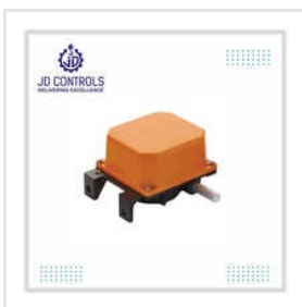
Rotary Gear Limit Switch