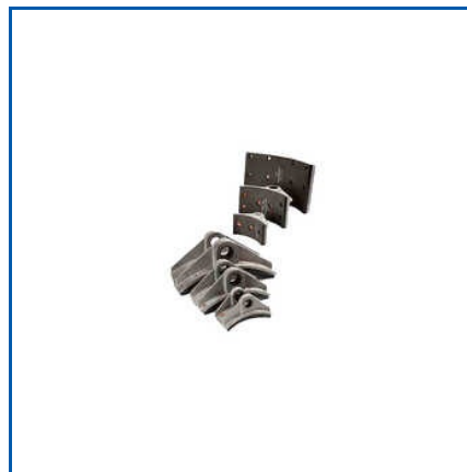
HEAVY DUTY BRAKE SHOES