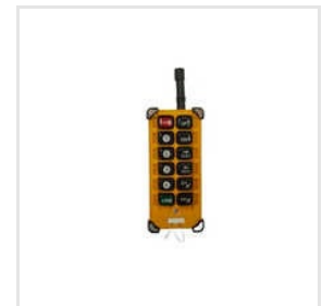
F24-BB Radio Remote Control