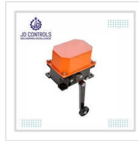
40 AMPS Lever Type Limit Switch