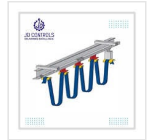
C Rails Festoon Systems