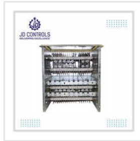
SS Punched Grid Resistance Box