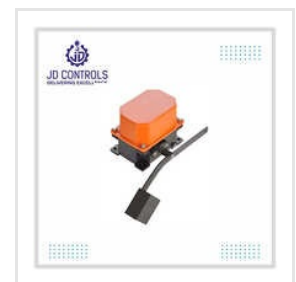
40 AMP Counter Weight Limit Switch