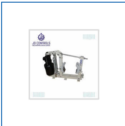
ELECTRO HYDRAULIC THRUSTER BRAKE MDT

10 AMPS Worm Drive Limit Switch, 40 AMP Counter Weight Limit Switch, 40 AMPS Lever Type Limit Switch, AC Solenoid Operated Brakes, ACD3 Anti Collision Device, AW Bolt Joint DSL Busbar System, B. W DSL Busbar System, Bolted Type Copper DSL Busbar System, etc.