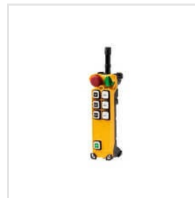
F24-6D Radio Remote Control