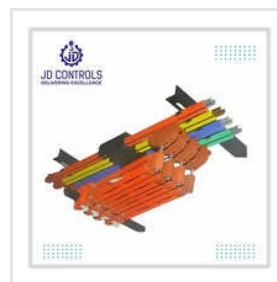
Bolted Type Copper DSL Busbar System