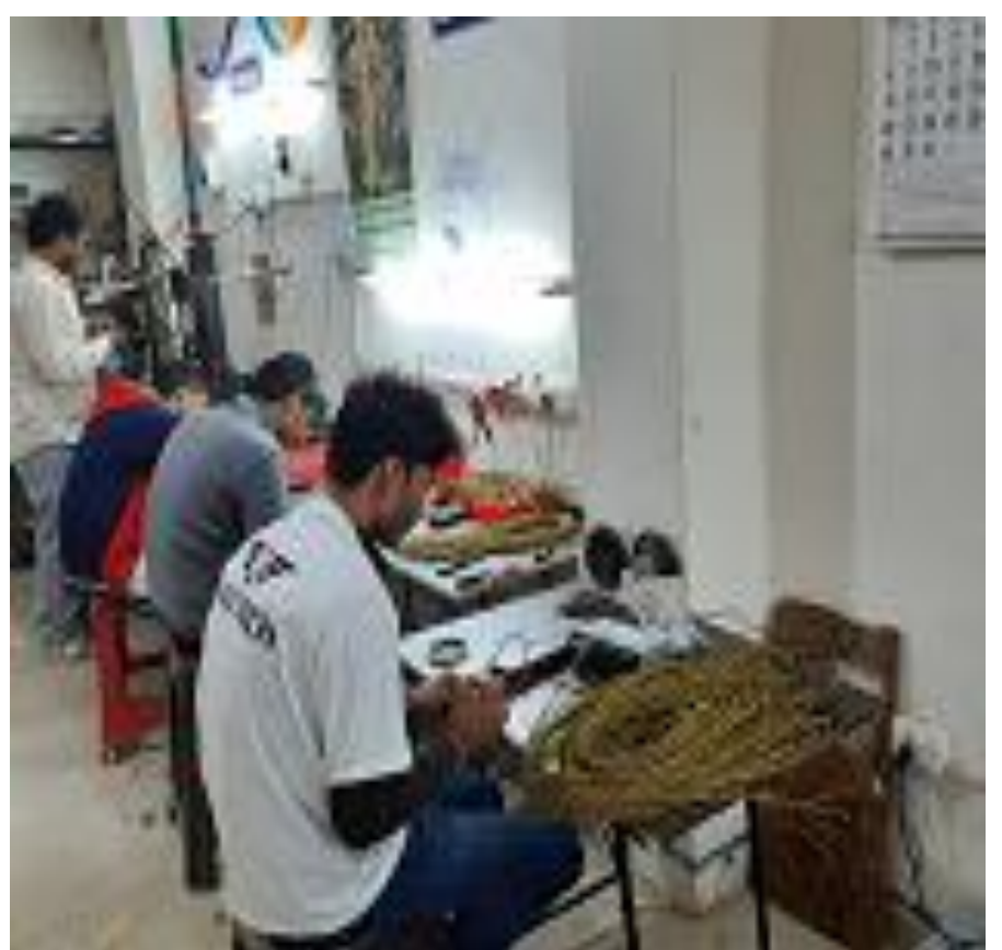
CABLE CUTTING & STRIPING MACHINE