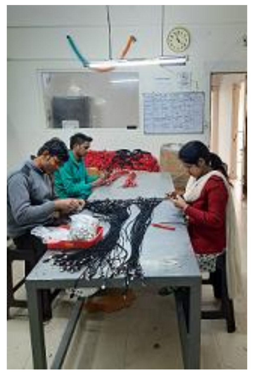
FINISHING & PACKAGING