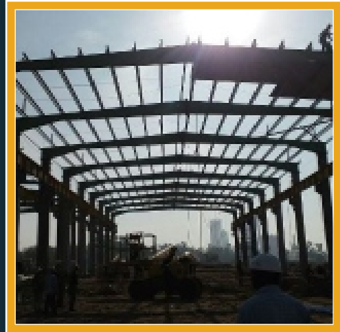
Heavy Steel Prefabricated Structure