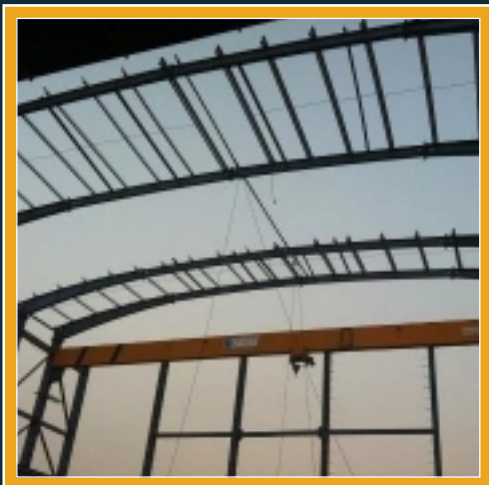
Prefabricated Mezzanine Flooring