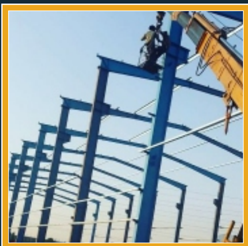
Industrial Steel Shed Structure