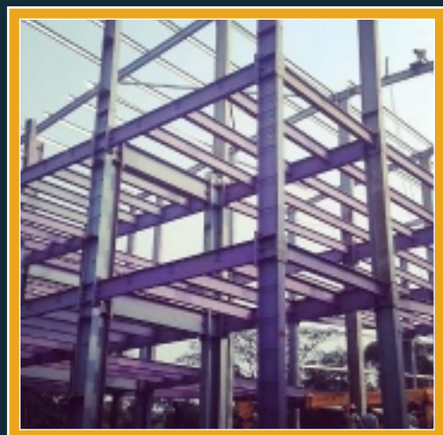
Prefabricated Tubular Structure