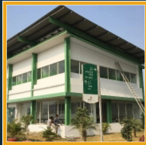
Prefabricated Factory Building