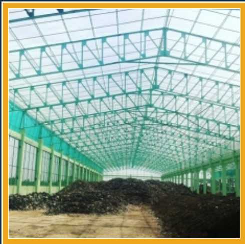
Structural Prefabricated Shed