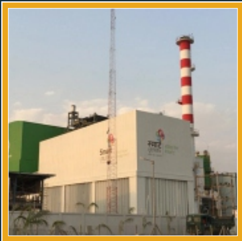
Pre Engineered Building