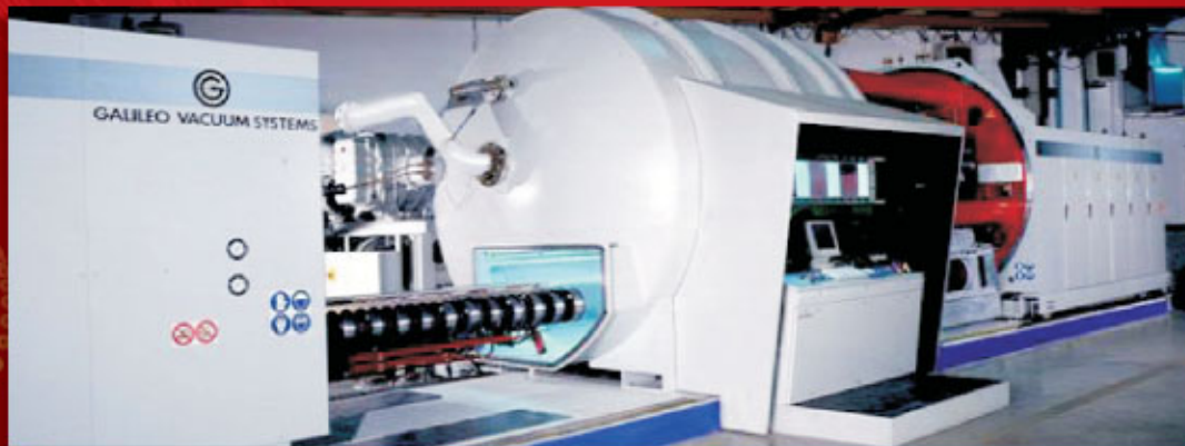
Metallizing Machine at our new Company VACCUPLAST (INDIA) PVT. LTD.