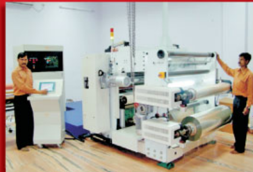
Hologram Embossing Machine