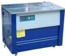
Box Strapping Machine