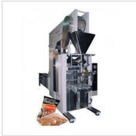
Weight Filler Machine