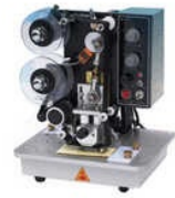
HP241 Hot Stamp Coding Printer