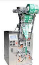
Automatic Spice Pouch Packing Machine