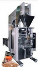
Automatic Chips Packing Machine