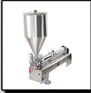
CREAM FILLING MACHINE