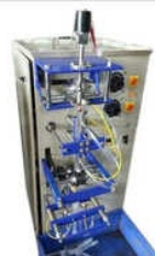
Pepsi Packing Machine