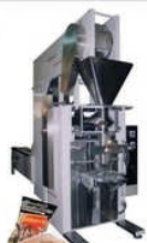
Dry Fruits Packing Machines