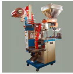
Namkeen Packaging Machine