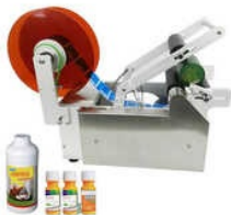
MT50 Round Bottle Label Machine