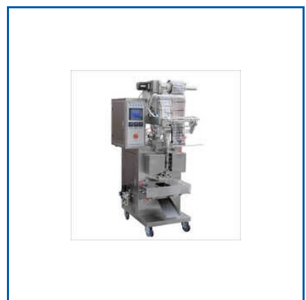
AUTOMATIC SPICE PACKING MACHINE