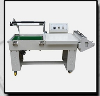
SEMI AUTO L TYPE SEALER

Atta-Flour Packaging Machine, Auger Filler Machine, Automatic Chips Packing Machine, Automatic Chuna Packing Machine, Automatic Grocery Packing Machine, Automatic Haldi Powder Packing Machine, Automatic Khada Masala Pouch Packing Machine, Automatic Liquid Pouch Packing Machine, Automatic Milk Pouch Packing Machine, Automatic Namkeen Packing Machine, Automatic Paste Pouch Packing Machine, Automatic Pneumatic Namkeen Packing Machine, Automatic Pulses Pouch Packing Machine, Automatic Salt Pouch Packing Machine, Automatic Spice Packing Machine, etc.