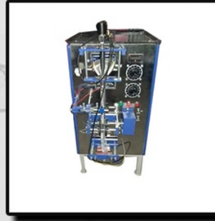
CHUNA PACKING MACHINE