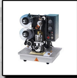
HOT STAMP CODING PRINTER