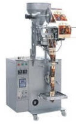
Detergent Packing Machine