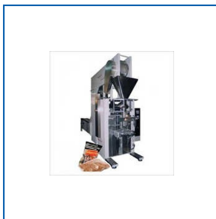
AUTOMATIC GROCERY PACKING MACHINE