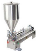
Semi Automatic Cream Filling Machine