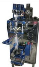
Steel Pepsi Pouch Packing Machine