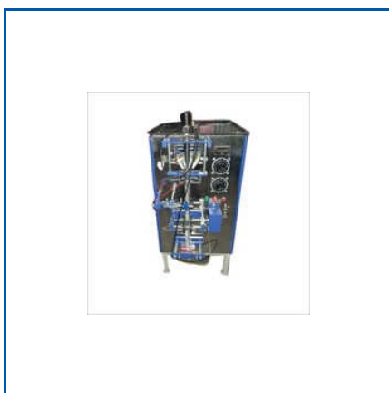
AUTOMATIC CHUNA PACKING MACHINE

Atta-Flour Packaging Machine, Auger Filler Machine, Automatic Chips Packing Machine, Automatic Chuna Packing Machine, Automatic Grocery Packing Machine, Automatic Haldi Powder Packing Machine, Automatic Khada Masala Pouch Packing Machine, Automatic Liquid Pouch Packing Machine, Automatic Milk Pouch Packing Machine, Automatic Namkeen Packing Machine, Automatic Paste Pouch Packing Machine, Automatic Pneumatic Namkeen Packing Machine, Automatic Pulses Pouch Packing Machine, Automatic Salt Pouch Packing Machine, Automatic Spice Packing Machine, etc.