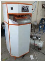
Fruit Juice Packing Machine