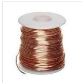
DPC COPPER WIRE