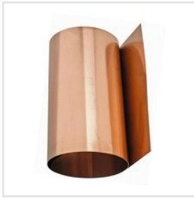
Phosphorus Bronze Sheet