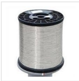
Super Enamel Aluminium Wire