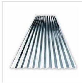
Aluminium Troughed Sheet