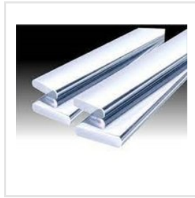
Tinned Copper Bus Bar