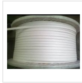
Nomex Copper Strip