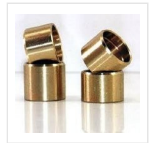
ALUMINIUM BRONZE BUSH