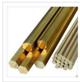
Brass Hex Bars