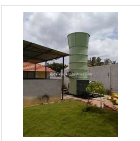
Industrial Wastewater Evaporators