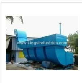
Industrial Mechanical Evaporators