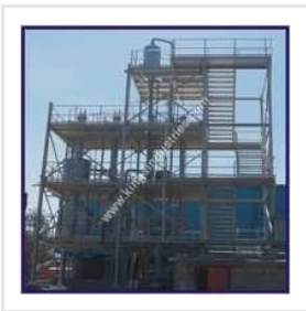
Zero Effluent Discharge Evaporators