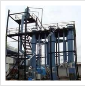
Multi Effect Evaporators