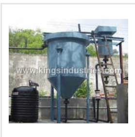
Electro Coagulation Effluent Treatment