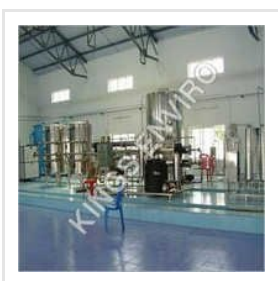
Mineral Water Plants