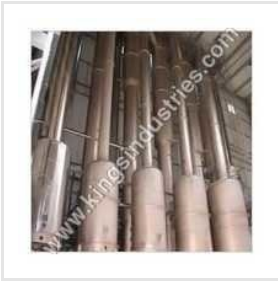
High TDS Water Evaporators