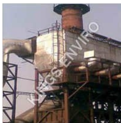
INDUSTRIAL FUME EXTRACTION SYSTEM

Automatic Filter Press, Automatic Industrial Filter Press, Automatic Membrane Filter Press, Biological Effluent Treatment Plants, Biological Sewage Treatment Plants, Cast Iron Filter Press, Chamber Filter Press, Chemical Wastewater Evaporators, Chemical Zero Liquid Discharge Plant, Commercial Effluent Treatment Plant, Compact Sewage Treatment Plant, Compact Zero Discharge Treatment Plant, Containerized Effluent Treatment Plant, Containerized Sewage Treatment Plant, Conventional Sewage Treatment Plant, etc.