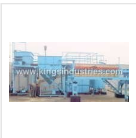
Electro Coagulation Plant For ETP