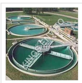
Industrial Water Treatment Plants