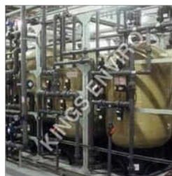
ION EXCHANGE SYSTEMS