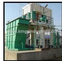
ELECTRO COAGULATION PLANT FOR STP