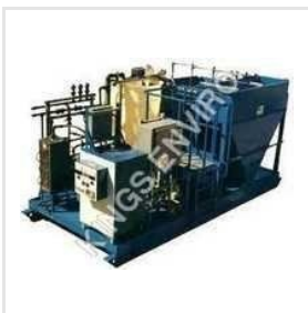
Electro Coagulation Sewage Treatment