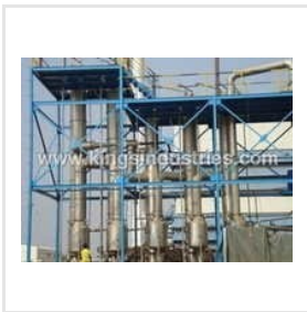
Chemical Wastewater Evaporators