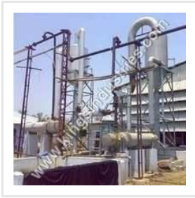
Mechanical Evaporator For Zero Liquid