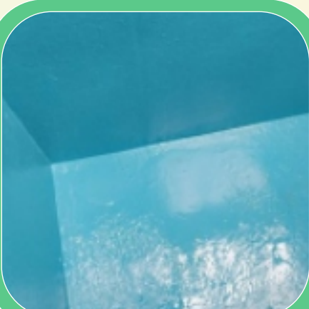
FRP Lining Services