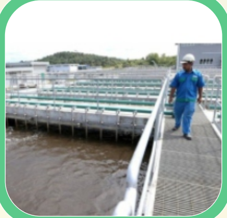
STP Maintenance Service