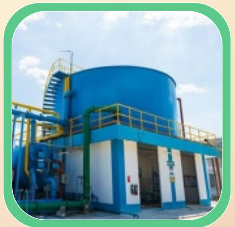
15 KLD Sewage Treatment Plant