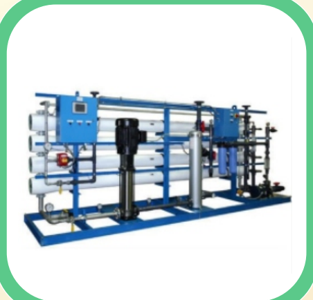
Reverse Osmosis Plant