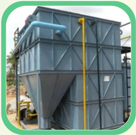
Compact Sewage Treatment Plant