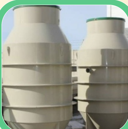
Domestic Sewage Treatment Plant