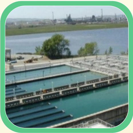
Clarifier Sewage Treatment Plant