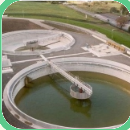
Industrial Wastewater Treatment Plant