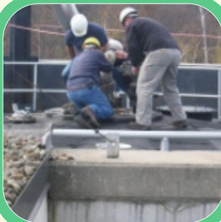
ETP Operation Maintenance Services