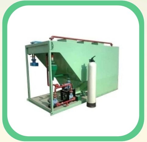
Mini Sewage Plant