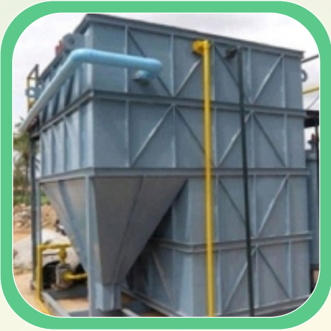
Commercial Packaged Sewage Treatment Plant