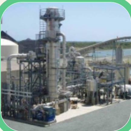
Zero Liquid Discharge System