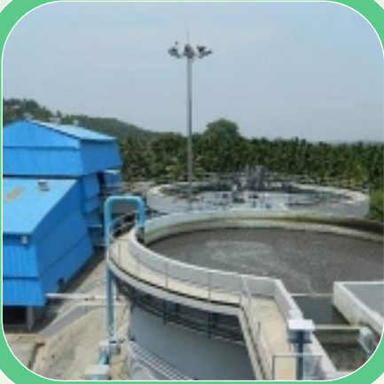
MS Wastewater Treatment Plant