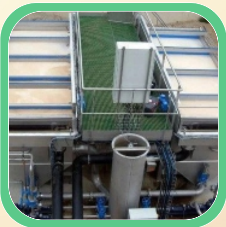
Residential Sewage Treatment Plant