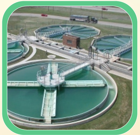
Sewage Treatment Plant With SAFF Technology