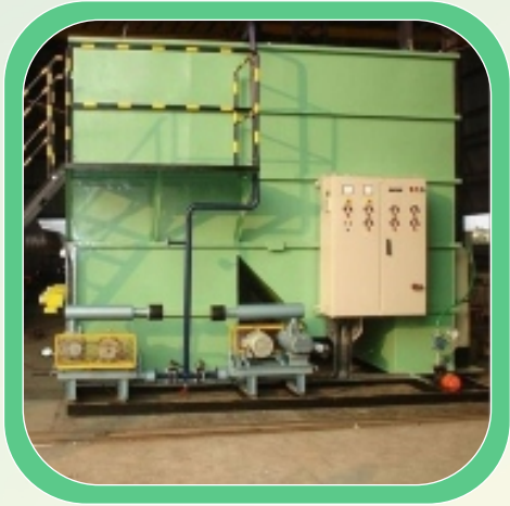
Packaged Sewage Water Treatment Plant