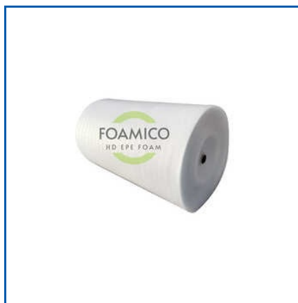
HD EPE PACKAGING FOAM ROLL