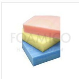
EPE Packing Sheet