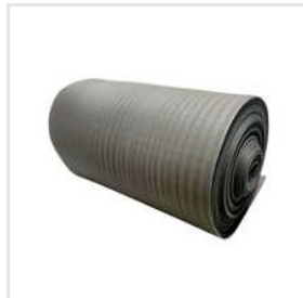
Grey EPE Foam Roll