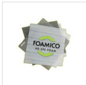
Bonded EPE Packaging Foam Roll