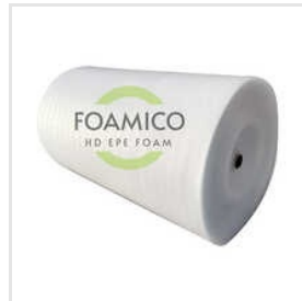
HD EPE Packaging Foam Roll