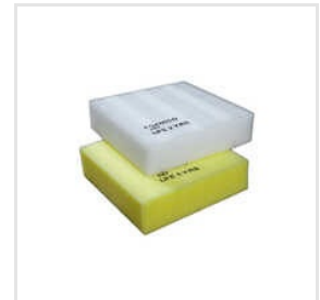
Colored HD EPE Foam Sheet