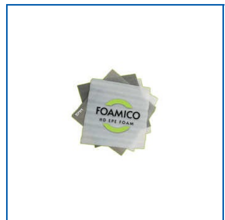
BONDED EPE PACKAGING FOAM ROLL