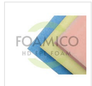
HD EPE Foam Sheet