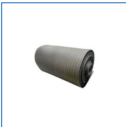
GREY EPE FOAM ROLL

EPE Colored Foam Rolls, EPE Foam , EPE Foam Rolls, EPE Foam Rolls , EPE Foam Rolls : Double Layer, EPE Foam Rolls : Single Layer, EPE Foam Rolls Single Layer, EPE Foam Sheets, EPE Packaging Foam Rolls, EPE Rolls, EPE Sheets, EPE foam Rolls : Colored, EPE foam Rolls Colored, Epe Packing Sheet, Foam Rolls, etc.