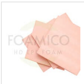
HD EPE Packing Foam Sheet