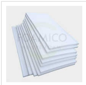
Hitlon Foam Sheet