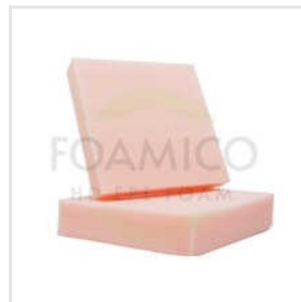
Pink HD EPE Foam Sheet