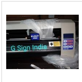
K Cut Pro Cutting Plotter