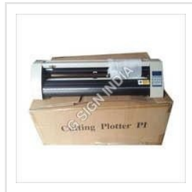
PI 721 Cutting Plotter