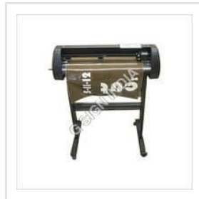
Skytech 721 Cutting Plotter