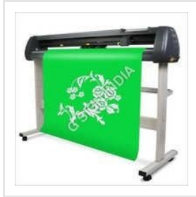
Graphic Cutting Plotter