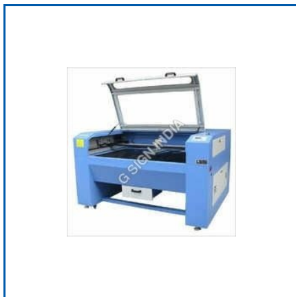
INDUSTRIAL LASER ENGRAVING MACHINE