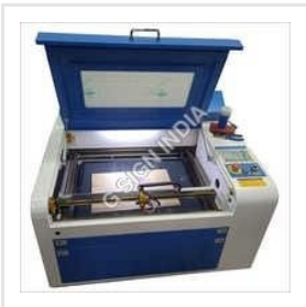
G Sign Coral Laser