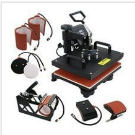
Heat Press Machine