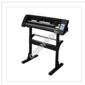
SI 721 Cutting Plotter