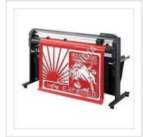
Graphtec Cutting Plotter