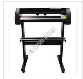
Regular Cutting Plotter