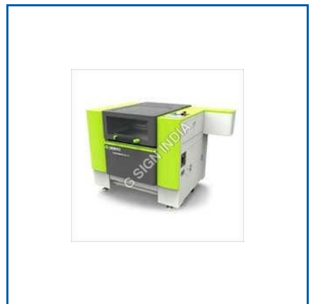
AUTOMATIC LASER ENGRAVING MACHINE