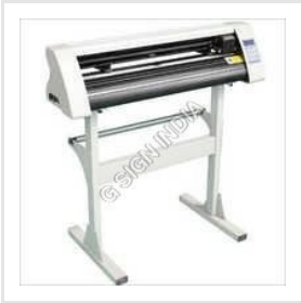
JK 721 Upgrade Model 721 Cutting Plotter