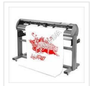
GCC Jaguar IV Cutting Plotter