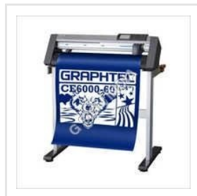
Graphtec Vinyl Cutter