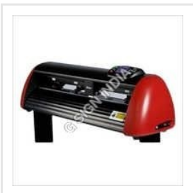
Foison C 24 Pro Cutting Plotter