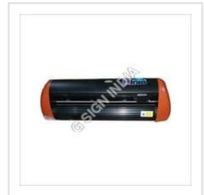
Foison Cutting Plotters