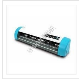
GCC AR 24 Cutting Plotter