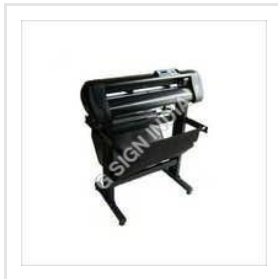
Bravo XL 721 Cutting Plotter