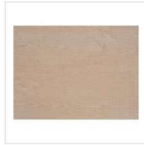
19623 Denim Wood Leo Laminate Flooring