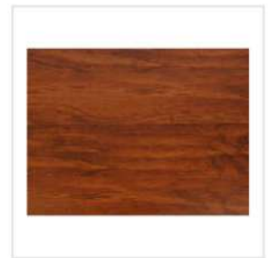
19726 Burn Wood Leo Laminate Flooring