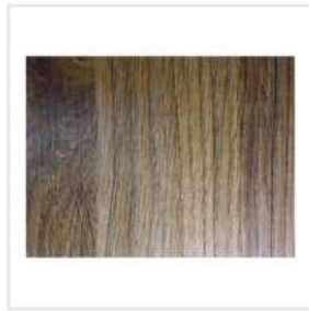
D3837 Omega Series Swiss Krono Laminate