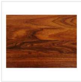
16171 Wild Walnut Leo Laminate Flooring