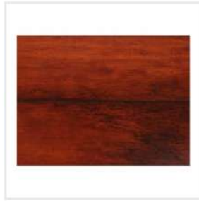
90182 Flame Leo Laminate Flooring