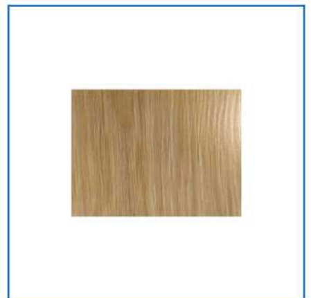
D5378 DELTA SERIES SWISS KRONO LAMINATE FLOORING