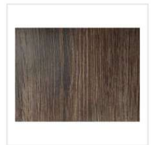
D3502 Delta Series Swiss Krono Laminate