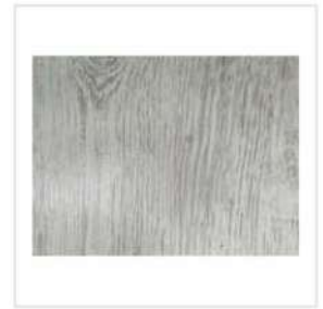
D2052 Platinum-Sigma Series Swiss Krono