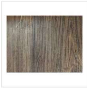
D2023 Omega Series Swiss Krono Laminate