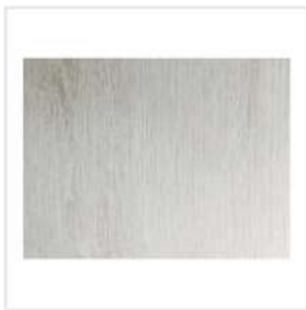
D5377 Omega Series Swiss Krono Laminate