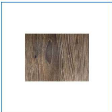
D5378 DELTA SERIES SWISS KRONO LAMINATE FLOORING

Commercial Vinyl Flooring (IT Sectors), ESD / Speciality Floors, Exterior Wood Deck Floor, Exterior Wood Deck Floors, Indiana Cedar Wall Paneling, Indiana Cedar Wall Panelling, Interior Concept, Liquid Interactive Floor Tiles, Mipolam Cosmo - Pharma / Clean rooms, Mipolam Cosmo Pharma Clean rooms, Mipolam Cosmo-Colours, Solidwood Bamboo Dance Floors, Sports Vinyl Flooring, Vinyl Flooring - Chromatics, Vinyl Flooring - Office / IT / Schools, etc.