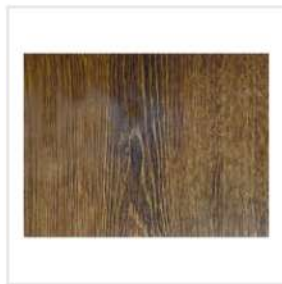
D2740 Platinum-Sigma Series Swiss Krono