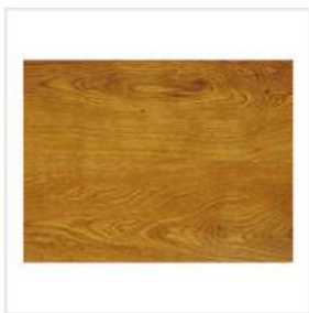
19501 Rustic Oak Leo Laminate Flooring