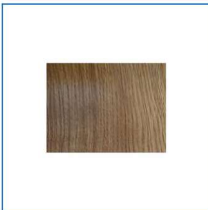
D9117 DELTA SERIES SWISS KRONO LAMINATE FLOORING