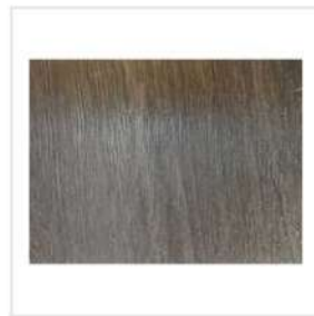
D5380 Platinum-Sigma Series Swiss