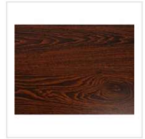
17206 Exotic Oak Leo Laminate Flooring