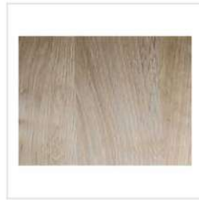
D3836 Omega Series Swiss Krono Laminate