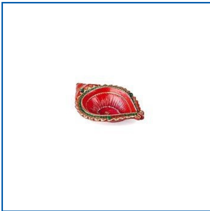
COLOR CLAY DIYA WITHOUT WAX

Acid scarlet dyes, Alkyd resin, Antimony Trioxide, Basic red dye, Black RL shade solvent dye, Castor Oil, Coolant Color, Coolant Gel, Copper Pearl Powder, Copper Powder, Deep Gold Shade Metallic Powder, Dye Powder, Epoxy Resin, Fanta orange pigment, Fire Red G shade dye, etc.