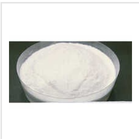
Hydroxyethyl Methyl Cellulose