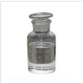
Cycloaliphatic Amine Modified Hardeners