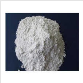
01_Fire Retardant Chemical