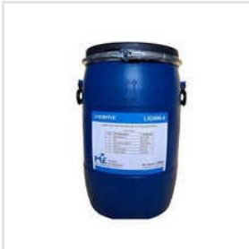
Lignin A Chempfix