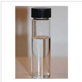
Chiller Plant Chemical