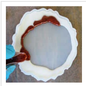
High Grade Epoxy Resin