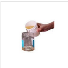
Print Fixer Chemical