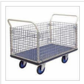
Box Trolley With Wire Mesh