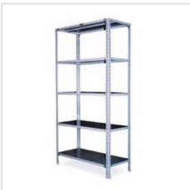
Skeleton Heavy Duty Rack