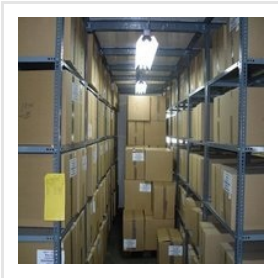
Slotted Angle Shelving Racks