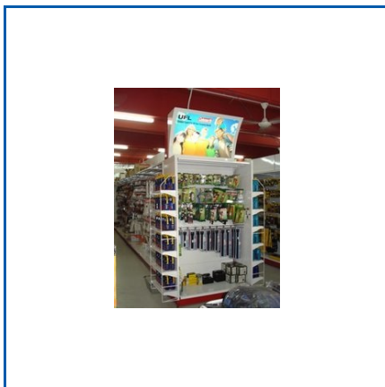
RETAIL DISPLAY RACK

18 Inches Industrial Locker, Box Trolley with Wire Mesh, Compactor Storage System, Double Ended Platform Trolley, Filing Cabinet, Filing Cabinet for Office, Heavy Duty Storage Rack, Hydraulic Loader, Hydraulic Pallet Truck, Hydraulic Pallet Truck for Construction Industry, Hydraulic Stacker, Industrial Pallet Trolley, MEDIUM DUTY RACKS, Mezzanine Floor, Office Table, etc.