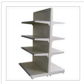
Two Sided Display Rack