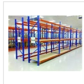
Slotted Angle Rack