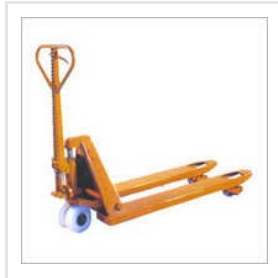
Industrial Pallet Trolley