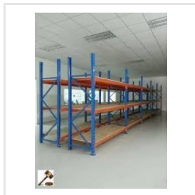
MEDIUM DUTY RACKS