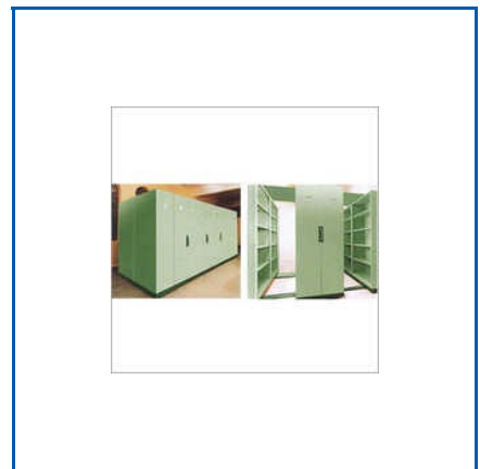
COMPACTOR STORAGE SYSTEM