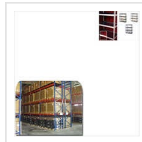
Skeleton Rack For Warehouse