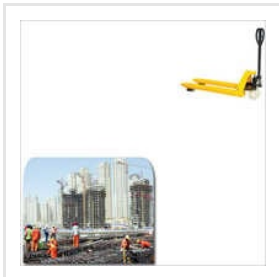
Hydraulic Pallet Truck For Construction