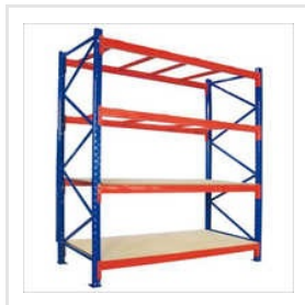
Heavy Duty Storage Rack