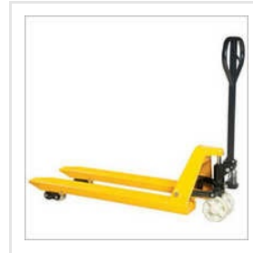
Hydraulic Pallet Truck