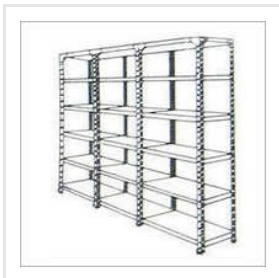
Slotted Angle Racks