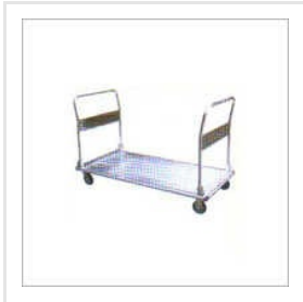
Double Ended Platform Trolley