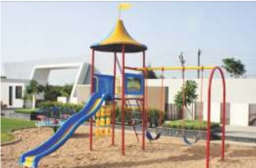
COMBINATION SET WITH CROSS N ZERO & CANOPY - RMPS-07B