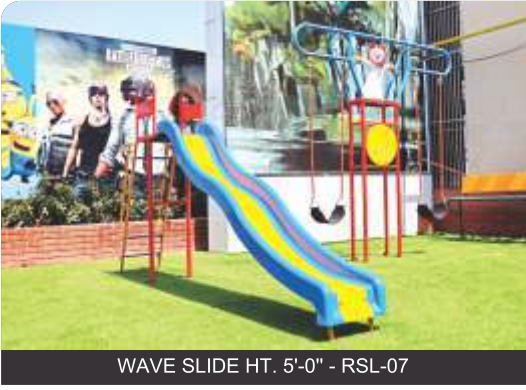
WAVE SLIDE HT. 5'-0" - RSL-07