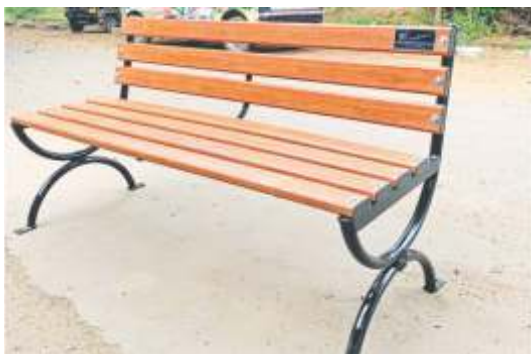
FRP WOODEN PLANK GARDEN BENCH - RGR-01