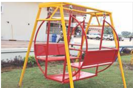
SELF SWING - RSW-05