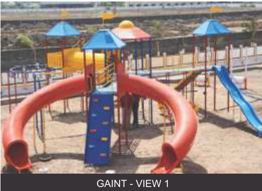
GAINT - VIEW 1