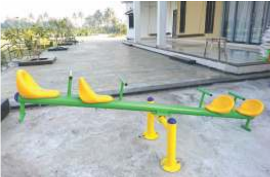
MULTISEATER SEESAW - RSS-03