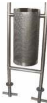
SS PERFORATED TILTABLE BIN WITH GI PIPE 60 LIT - RGR-09