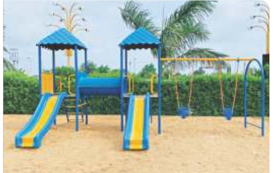
TWO DECK BABY MULTIPLAY SYSTEM - RMPS-20