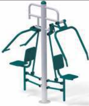
CHEST CUM SHOULDER PRESS - ROG-15