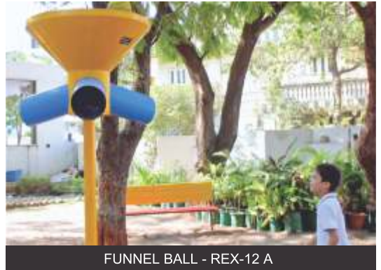
FUNNEL BALL - REX-12 A