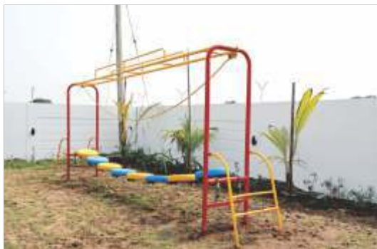
BALLANCING BRIDGE - REX-05