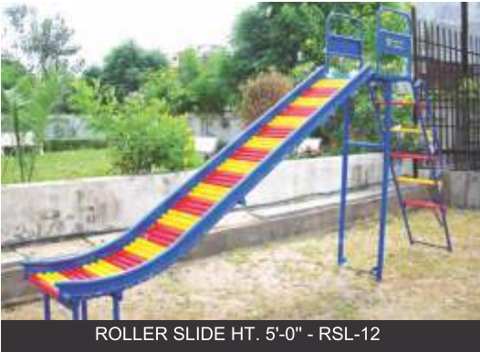
ROLLER SLIDE HT. 5'-0" - RSL-12