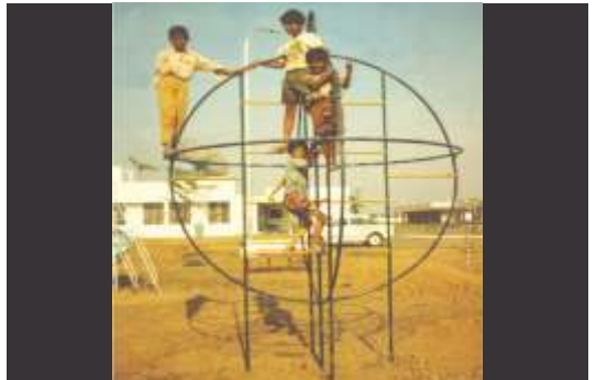
MOON CLIMBER - RCL-04