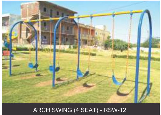
ARCH SWING (4 SEAT) - RSW-12