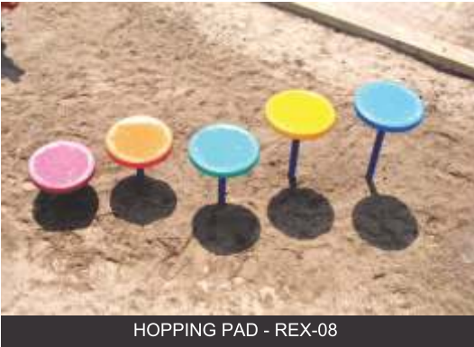
HOPPING PAD - REX-08