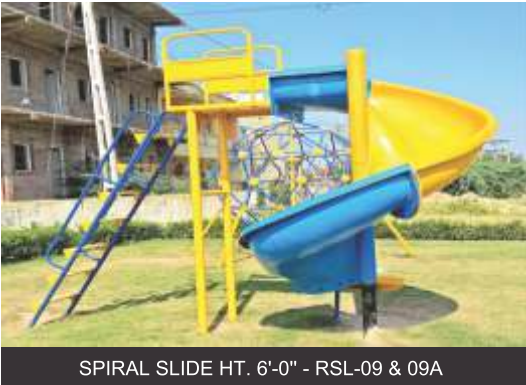
SPIRAL SLIDE HT. 6'-0" - RSL-09 & 09A