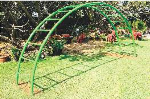
RAINBOW CLIMBER - RCL-01