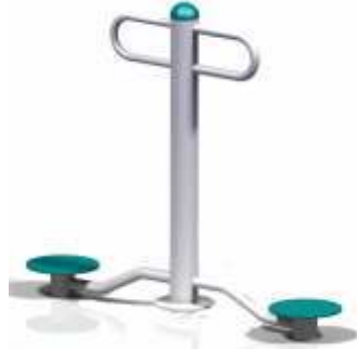
DOUBLE TWISTER - ROG-16