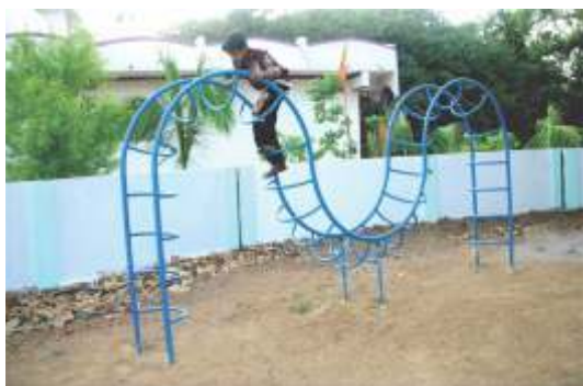
HUMPTY DUMPTY CLIMBER - RCL-21