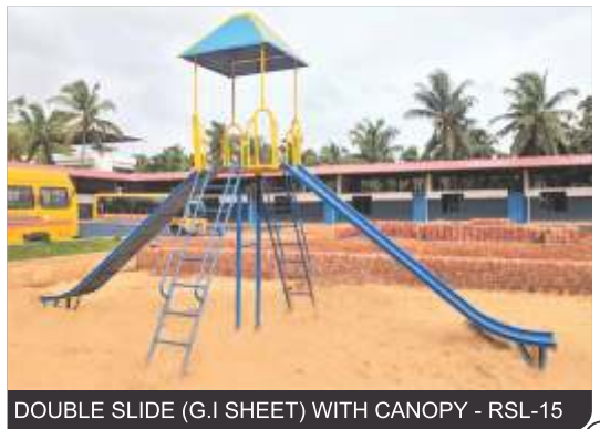
DOUBLE SLIDE (G.I SHEET) WITH CANOPY - RSL-15