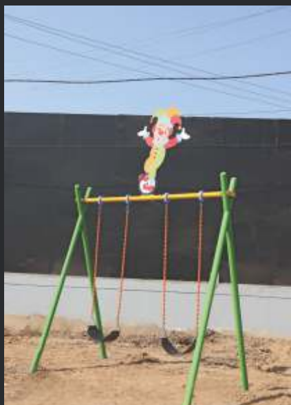
CARNIVAL SWING - PN - CASW