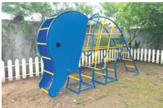
ELEPHANT CLIMBER - RCL-23