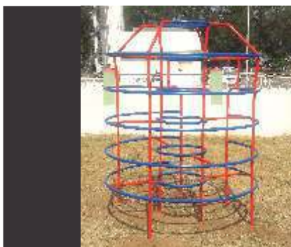
ROUND CLIMBER - RCL-18