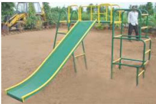
A TO B CL WITH SL - RCL-20