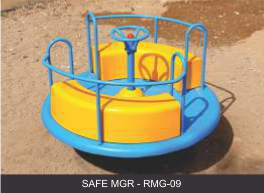
SAFE MGR - RMG-09