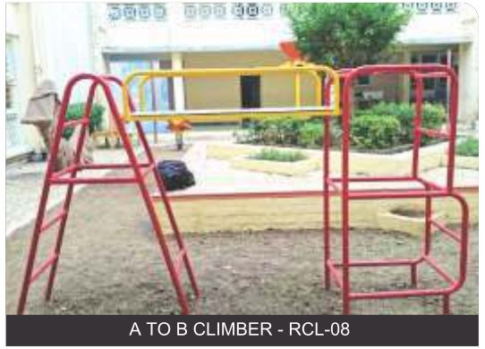
A TO B CLIMBER - RCL-08