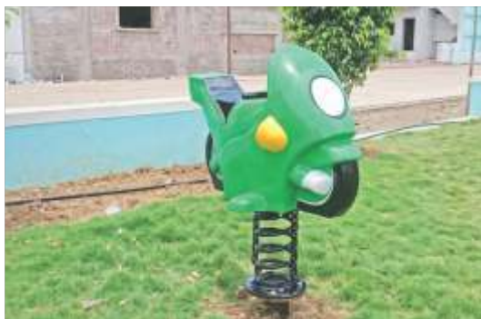
SPRING RIDER BIKE - REX-07 (2)