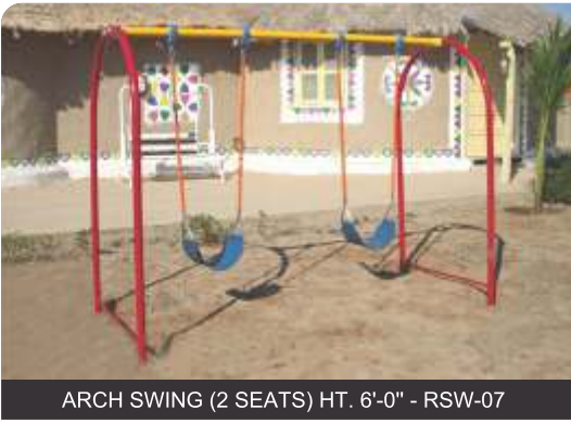
ARCH SWING (2 SEATS) HT. 6'-0" - RSW-07