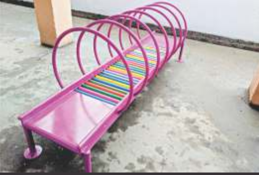
ROLLER CRAWLING MAIZE - REX-18