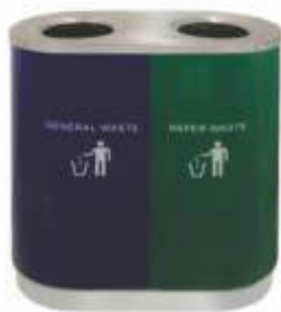
SS DUO DUSTBIN 100 LIT - RGR-10