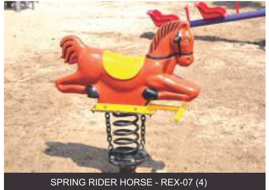
SPRING RIDER HORSE - REX-07 (4)