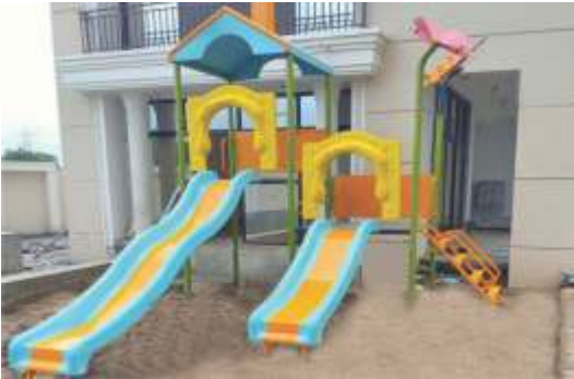
TWO DECK TWO LEVEL MULTIPLAY - RMPS-23