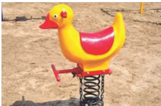
SPRING RIDER DUCK - REX-07 (1)