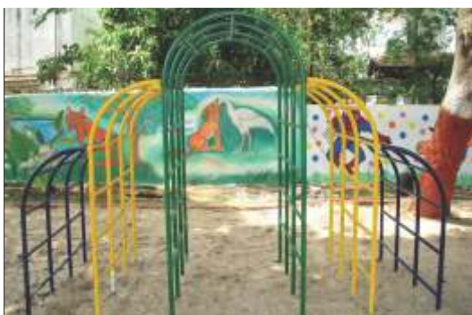
RAINBOW CLIMBER - RCL-22