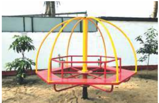
OCEAN WAVE MGR - RMG-04