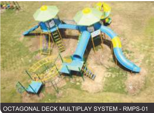
OCTAGONAL DECK MULTIPLAY SYSTEM - RMPS-01