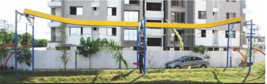
ZIP LINER 40-60-80 FEET - REX-20,21,22