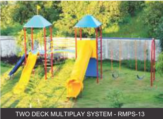
TWO DECK MULTIPLAY SYSTEM - RMPS-13