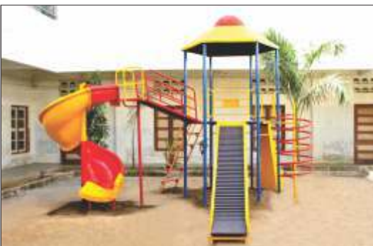
HEXAGONAL DECK MULTIPLAY SYSTEM-RMPS-09