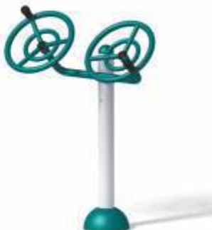
THAICHI SPINNER 2 WHEEL - ROG-05