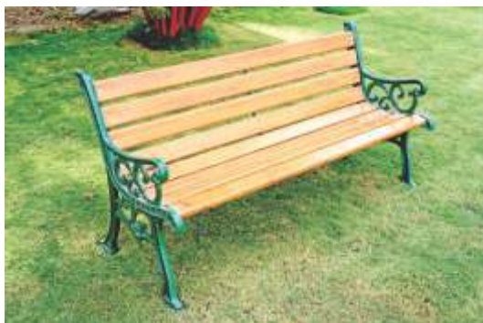
FRP WOODEN PLANK CI GARDEN BENCH - RGR-02