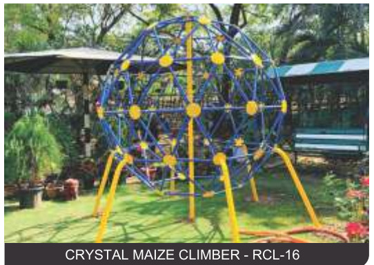
CRYSTAL MAIZE CLIMBER - RCL-16