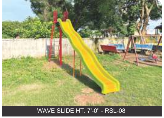
WAVE SLIDE HT. 7'-0" - RSL-08