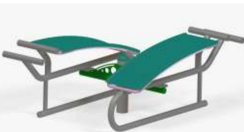
SIT UP BOARD DOUBLE - ROG-21