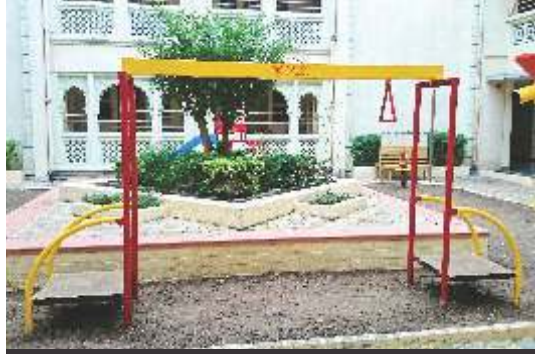
ZIP LINER 10 FEET - REX-19