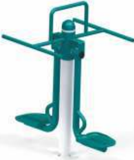
SURF BOARD - ROG-01