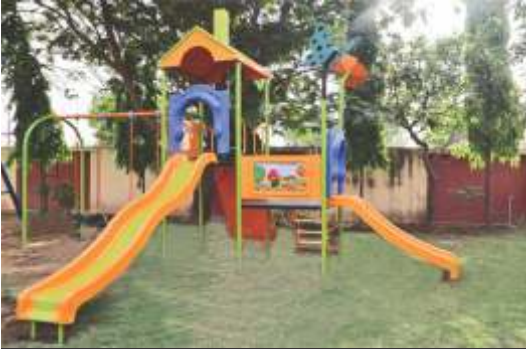
TWO DECK TWO LEVEL MULTIPLAY SYSTEM - RMPS-21