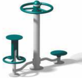
STANDING SEATING TWISTER - ROG-18