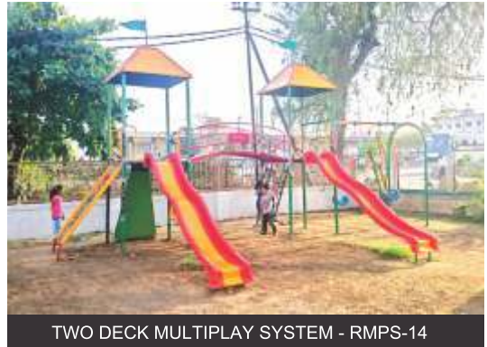
TWO DECK MULTIPLAY SYSTEM - RMPS-14