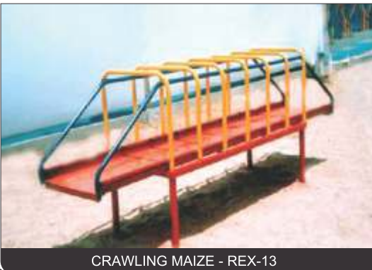
CRAWLING MAIZE - REX-13