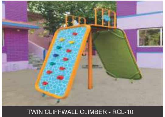
TWIN CLIFFWALL CLIMBER - RCL-10