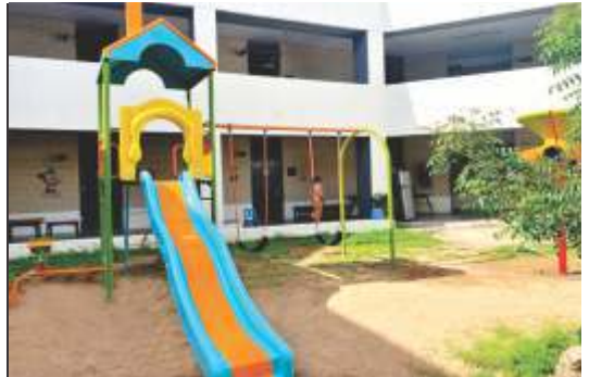
COMBINATION SET WITH CANOPY - RMPS-07A