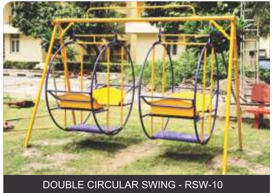
DOUBLE CIRCULAR SWING - RSW-10