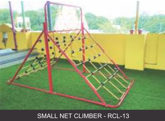
SMALL NET CLIMBER - RCL-13