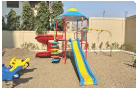
HEXAGONAL SYSTEM - RMPS-06