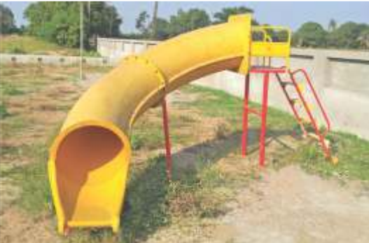
MINI TUBE SLIDE HT. 5'-0" - RSL-23