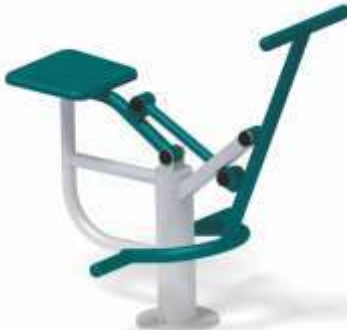
HORSE RIDER - ROG-19