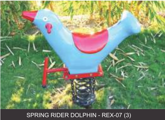
SPRING RIDER DOLPHIN - REX-07 (3)