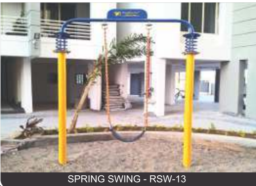
SPRING SWING - RSW-13