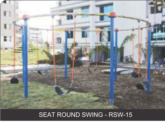
SEAT ROUND SWING - RSW-15