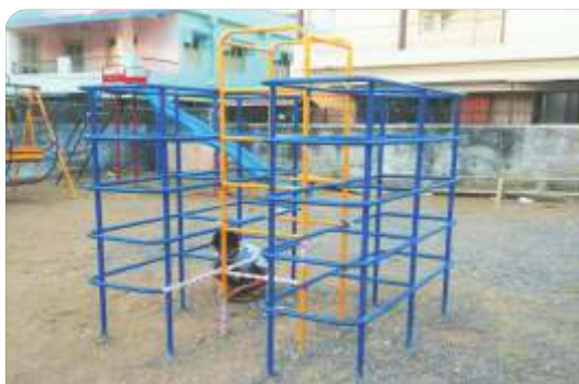
SQUARE CLIMBER - RCL-17