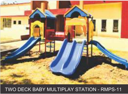
TWO DECK BABY MULTIPLAY STATION - RMPS-11