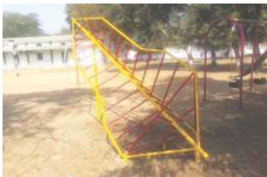
ROCKET CLIMBER - RCL-19