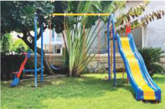
COMBINATION SET 3 IN 1 - RMPS-07