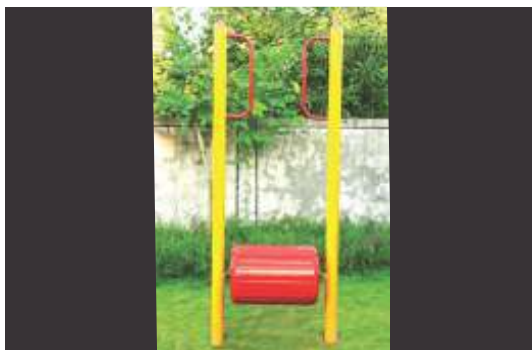
WALKING BARREL - REX-03