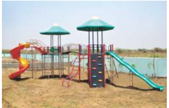
OCTAGONAL DECK MULTIPLAY STATION-RMPS-08