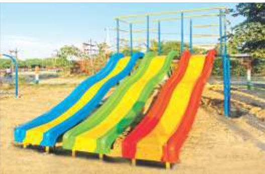
TRIPPLE WAVE SLIDE HT. 5'-0" - RSL-25