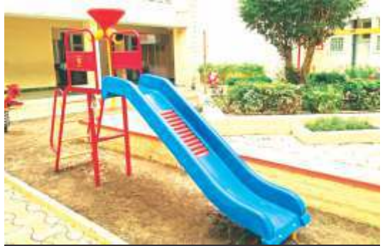
FRP ROLLER SLIDE HT. 3'-0" - RSL-22