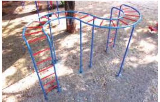
'S' BRIDGE LADDER - RCL-02