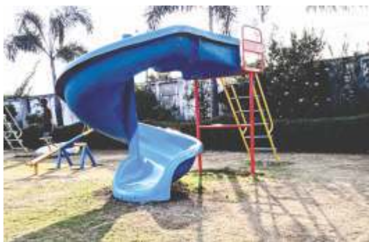
SPIRAL SLIDE ht. 5'-0" - RSL-05