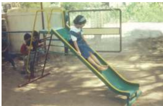
PLAIN SLIDE BABY (G.I SHEET) - RSL-01