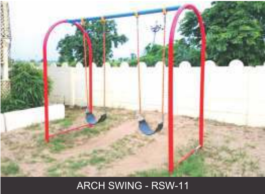
ARCH SWING - RSW-11