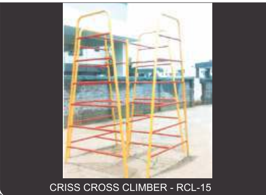
CRISS CROSS CLIMBER - RCL-15