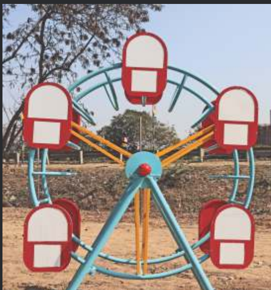
CARNIVAL CHAKDOL CLIMBER - PN - CACC