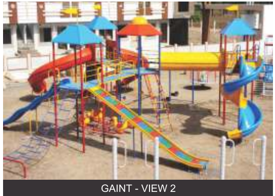
GAINT - VIEW 2