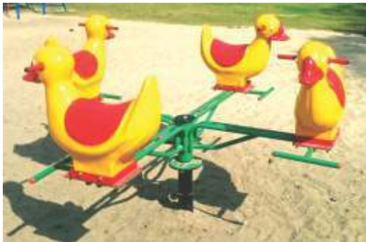
ANIMAL MGR - RMG-03