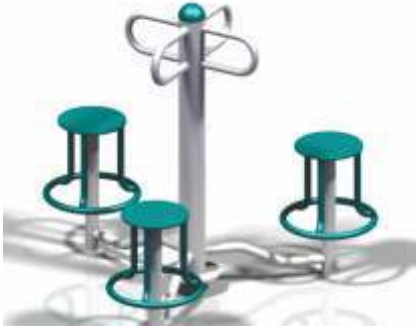
SEATED TWISTER 3 IN 1 - ROG-17