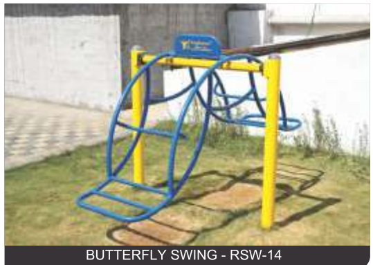
BUTTERFLY SWING - RSW-14