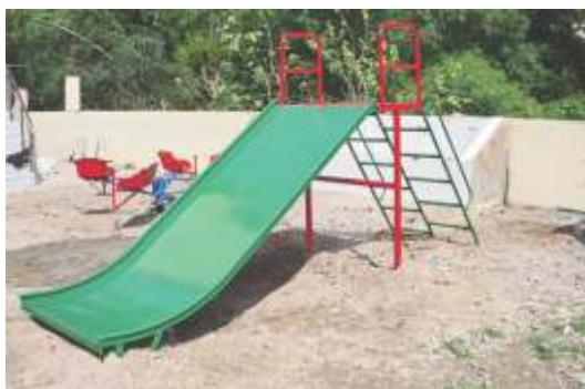
WIDE SLIDE (G.I. SHEET) - RSL-04