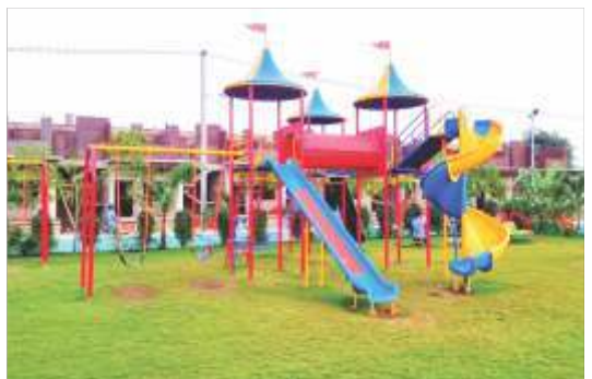
THREE DECK MULTIPLAY SYSTEM - RMPS-10