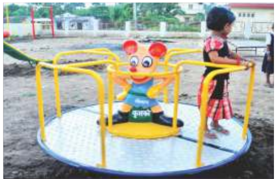
REVOLVING PLATFORM MICKEY - RMG-06