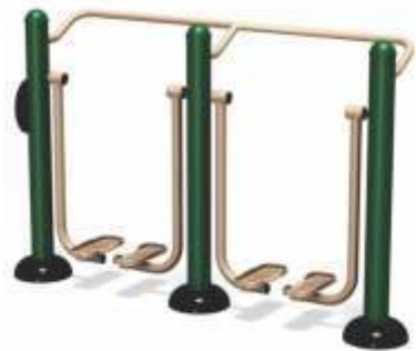
AIR WALKER DOUBLE - ROG-12