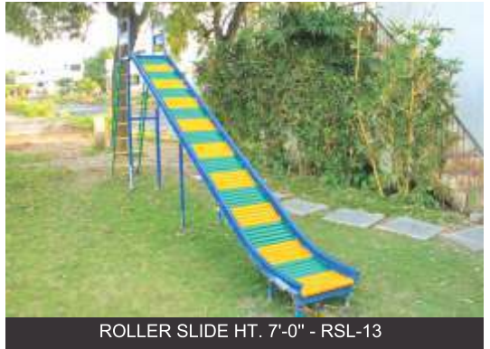
ROLLER SLIDE HT. 7'-0" - RSL-13