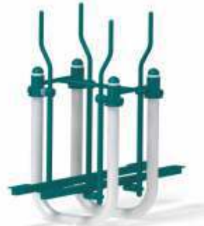
SKY WALKER - ROG-10