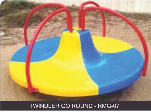
TWINDLER GO ROUND - RMG-07