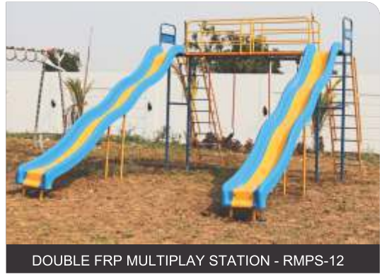
DOUBLE FRP MULTIPLAY STATION - RMPS-12