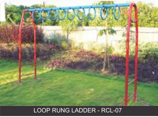
LOOP RUNG LADDER - RCL-07