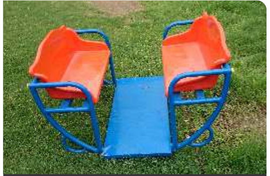
ROCKING BOAT 4 SEAT - REX-16