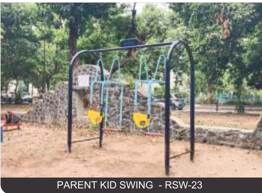
PARENT KID SWING - RSW-23