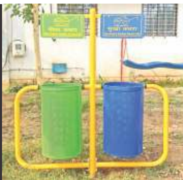
DRY AND WET DUSTBIN - RGR-06