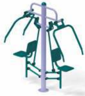
CHEST PRESS DOUBLE - ROG-14