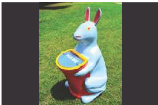
RABBIT DUSTBIN - RGR-04