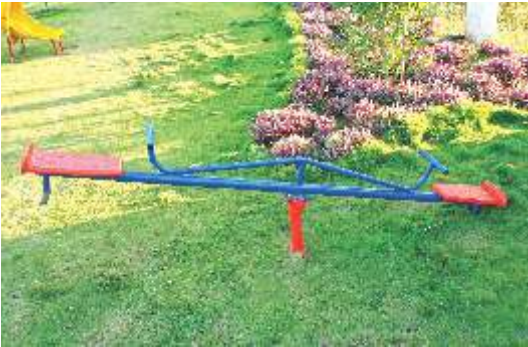
SINGLE SEESAW - RSS-01