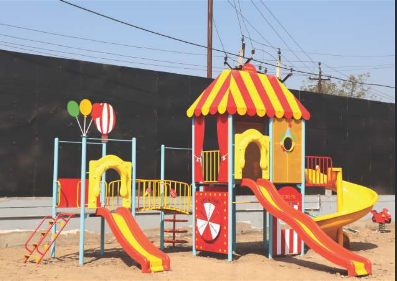
CARNIVAL MULTIPLAY : PN - CAM