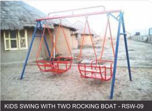
KIDS SWING WITH TWO ROCKING BOAT - RSW-09