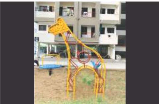
GIRAFFE CLIMBER - RCL-05