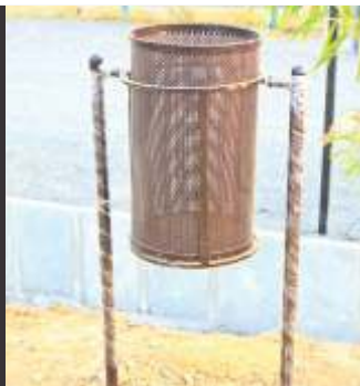
ALLUMINIUM TILTABLE DUSTBIN - RGR-05