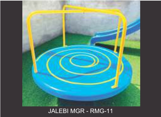
JALEBI MGR - RMG-11