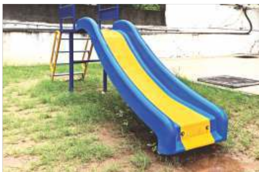
WAVE SLIDE HT. 3'-0" - RSL - 06