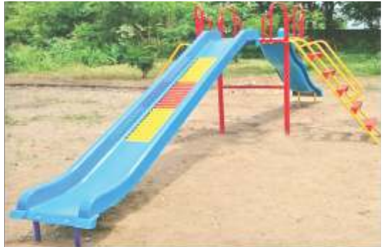
COMBO FRP ROLLER & WAVE SLIDE HT. 5'-0" - RMPS-24