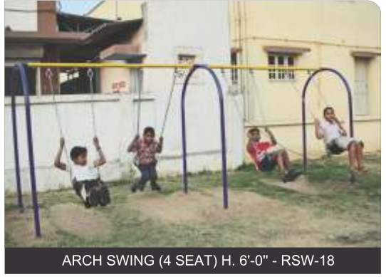
ARCH SWING (4 SEAT) H. 6'-0" - RSW-18