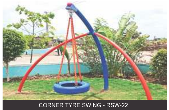
CORNER TYRE SWING - RSW-22