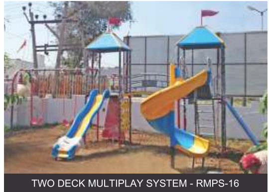
TWO DECK MULTIPLAY SYSTEM - RMPS-16