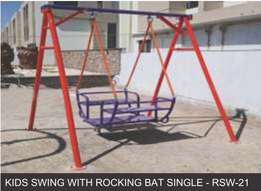
KIDS SWING WITH ROCKING BAT SINGLE - RSW-21