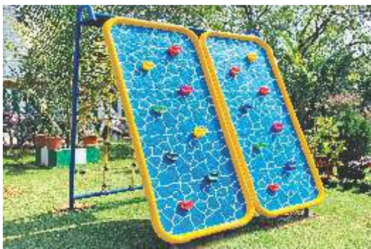
ADVENTURE CLIMBER - RCL-24