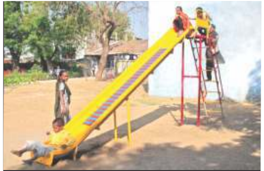
FRP ROLLER SLIDE 7'-0" - RSL-18