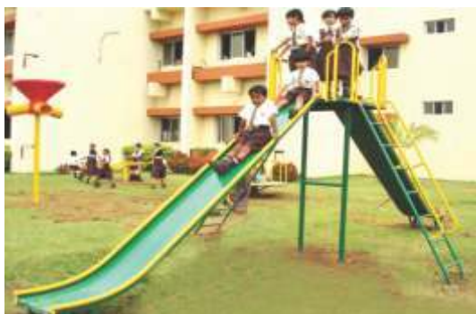
DOUBLE SLIDE (G.I SHEET) HT. 7'-0" - RSL-03