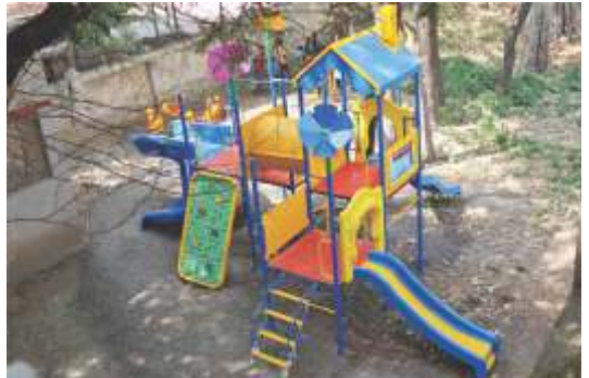
FOUR DECK TWO LEVEL MULTIPLAY - RMPS-24