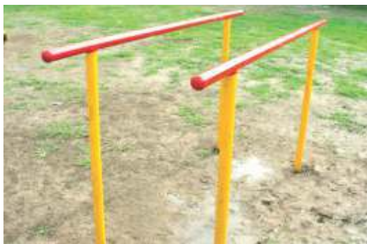
DOUBLE BAR - REX-01