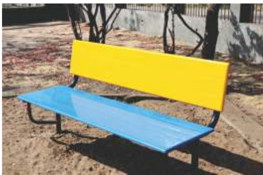
FRP PLANK GARDEN BENCH - RGR-03