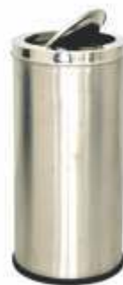
SWING BIN 55 LTR - RGR-07