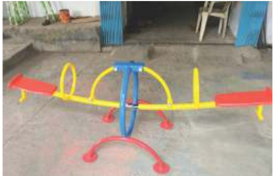
SWINGING SEESAW - RSS-04