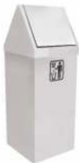
SS FLAP BIN 70 LIT - RGR-08