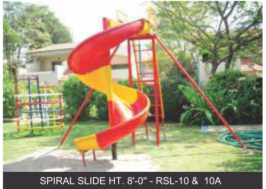
SPIRAL SLIDE HT. 8'-0" - RSL-10 & 10A