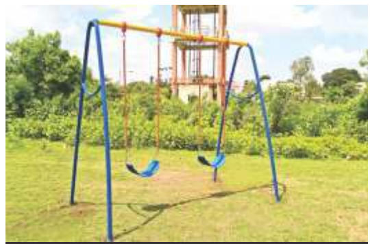
DOUBLE SWING - RSW-02