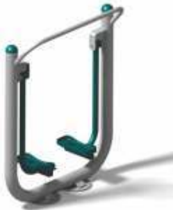
AIR WALKER SINGLE - ROG-11