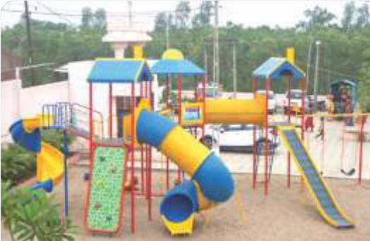
THREE DECK MULTIPLAY SYSTEM - RMPS-19