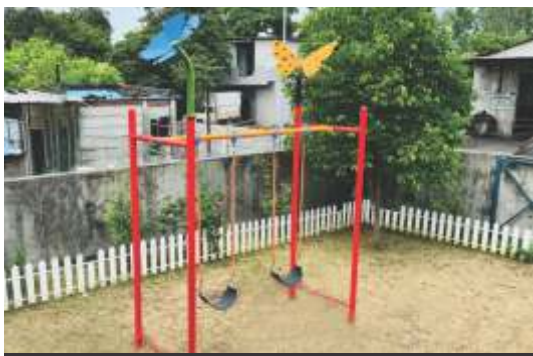
DECORATIVE DOUBLE SWING - RSW-01