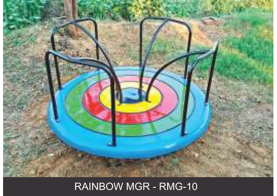
RAINBOW MGR - RMG-10