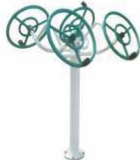
THAICHI SPINNER 4 WHEEL - ROG-06