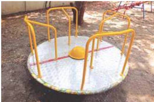
REVOLVING PLATFORM - RMG-01