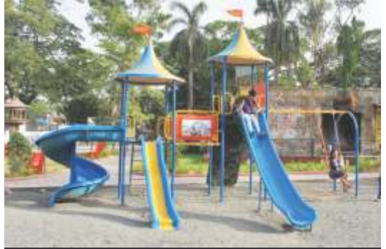
TWO DECK TWO LEVEL MULTIPLAY SYSTEM - RMPS-22