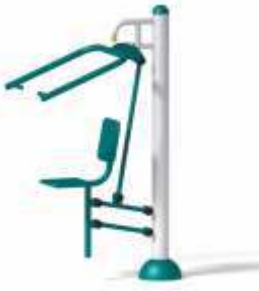
SEATED PULLER SINGLE - ROG-07