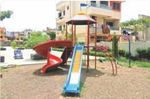
HEXAGONAL MULTIPLAY SYSTEM - RMPS-05