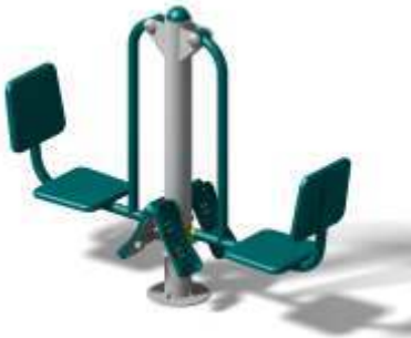
LEG PRESS - ROG-09