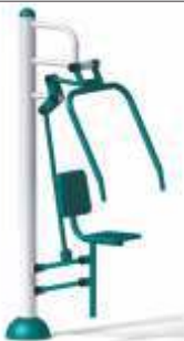
CHEST PRESS SINGLE - ROG-13