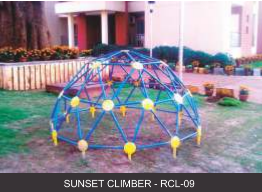
SUNSET CLIMBER - RCL-09