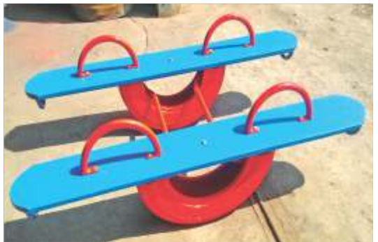
SMILING SEESAW - RSS-06