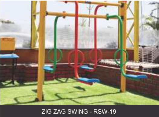
ZIG ZAG SWING - RSW-19