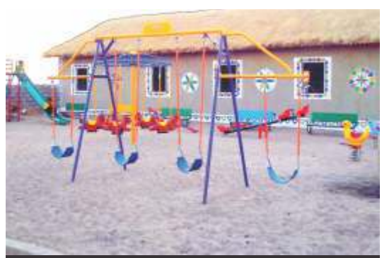
4 IN 1 SWING - RSW-04