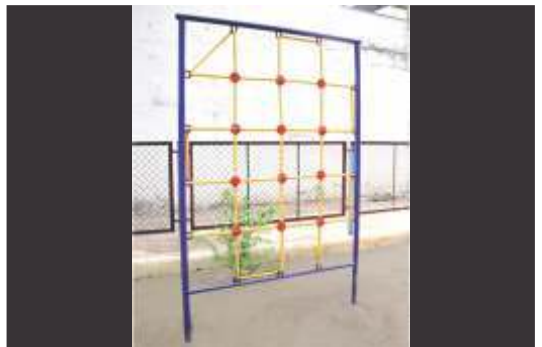
STRAIGHT NET CLIMBER - RCL-06