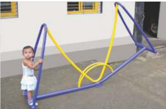
STANDING SEE SAW - RSS-05