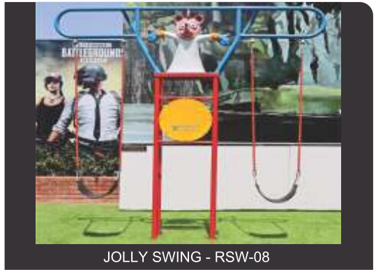
JOLLY SWING - RSW-08