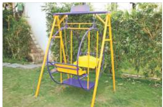
CIRCULAR SWING SINGLE - RSW-06