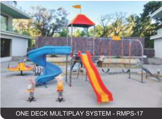
ONE DECK MULTIPLAY SYSTEM - RMPS-17