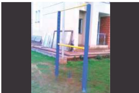
PULL UP BAR - REX-02