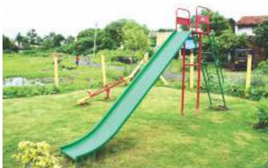
GI SLIDE HT. 7'-0" - RSL-02