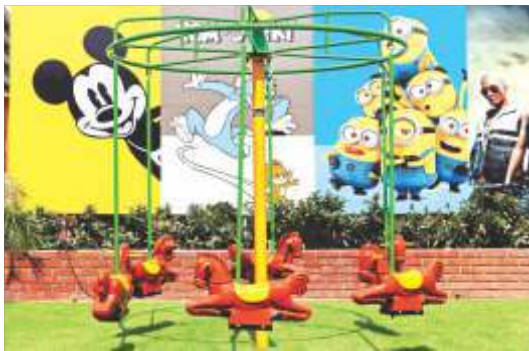
HORSE SHAPE MGR - RMG-05