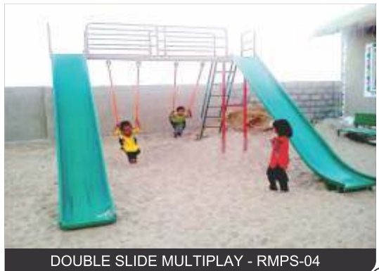
DOUBLE SLIDE MULTIPLAY - RMPS-04