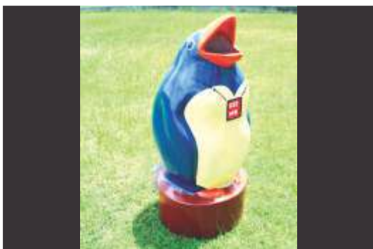
PAGVIN DUSTBIN - RGR-04