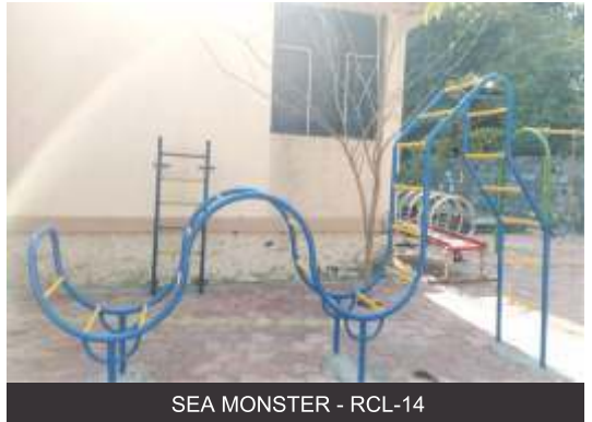
SEA MONSTER - RCL-14