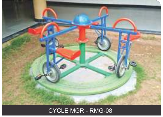
CYCLE MGR - RMG-08