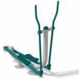
CROSS TRAINER - ROG-02