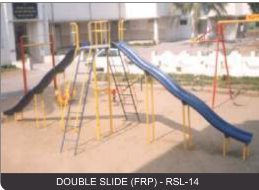
DOUBLE SLIDE (FRP) - RSL-14