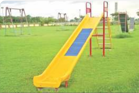
FRP ROLLER SLIDE HT. 5'-0" - RSL-17