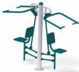
SEATED PULLER DOUBLE - ROG-08