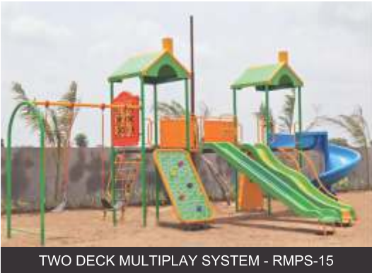
TWO DECK MULTIPLAY SYSTEM - RMPS-15