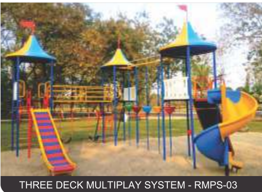
THREE DECK MULTIPLAY SYSTEM - RMPS-03