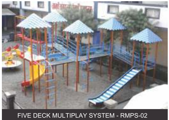
FIVE DECK MULTIPLAY SYSTEM - RMPS-02