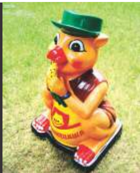
JOKER DUSTBIN - RGR-04