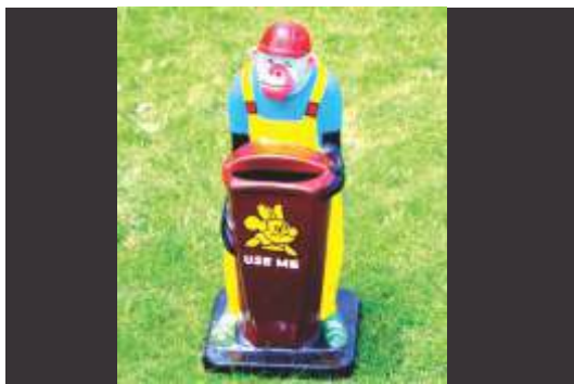
MONKEY DUSTBIN - RGR-04