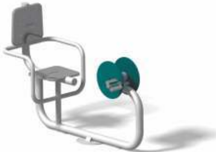
CYCLE - ROG-03