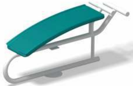
SIT UP BOARD SINGLE - ROG-20