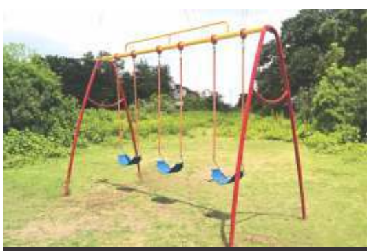
TRIPPLE SWING - RSW-03