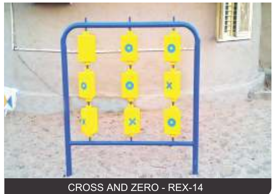
CROSS AND ZERO - REX-14