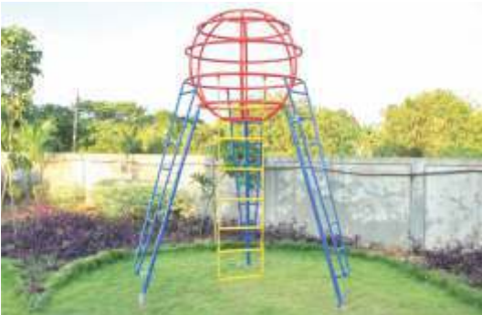
SATTELITE CLIMBER - RCL-03