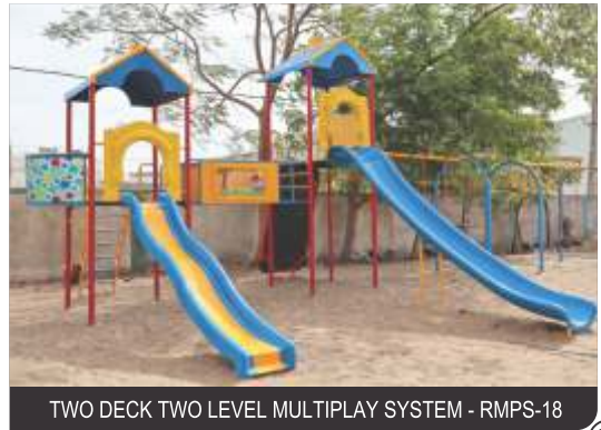
TWO DECK TWO LEVEL MULTIPLAY SYSTEM - RMPS-18