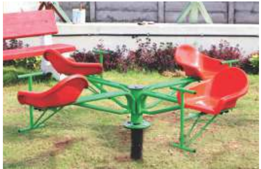
4 SEATER MGR - RMG-02