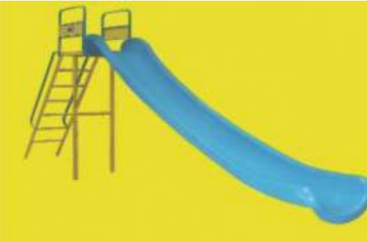
STRAIGHT CURVE SLIDE - RSL-21