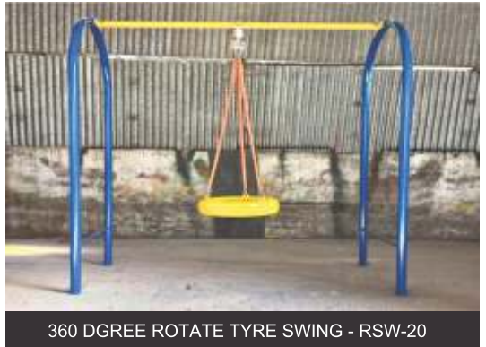
360 DEGREE ROTATE TYRE SWING - RSW-20