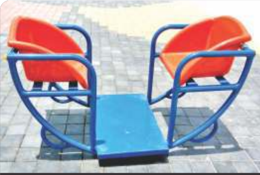
ROCKING BOAT 2 SEAT - REX-15