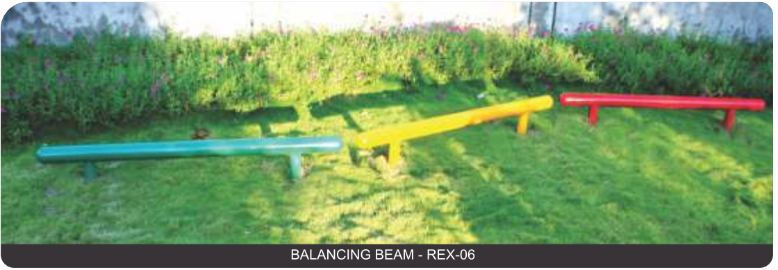
BALANCING BEAM - REX-06