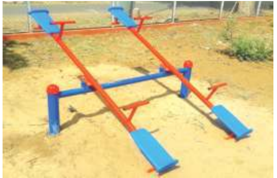
DOUBLE SEESAW - RSS-02