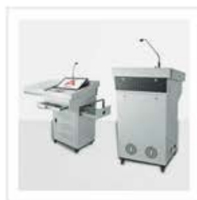
AL-DL 02 Digital Lectern