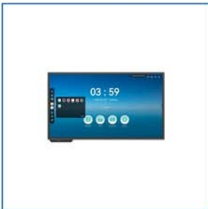
A PRO INTERACTIVE FLAT PANEL

A Pro Interactive Flat Panel, A Type Kiosk, AL PTZ Camera, AL Projector Cage, AL-01 Audio Podium, AL-01 IFPD Stand, AL-01 Optical-IR Touch Board, AL-02 IFPD Stand, AL-02 Optical-IR Touch Board, AL-02 Vertical Sliding System, AL-AV Trolley, AL-Acrylic Door Covered Notice Board, AL-Active LED Display, AL-DL 01 Digital Lectern, AL-DL 02 Digital Lectern, etc.