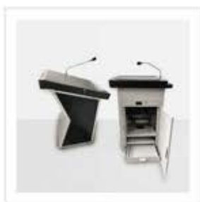
AL-DL 05 Digital Lectern