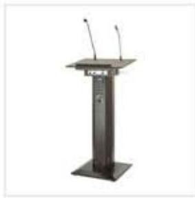
AL-01 Audio Podium