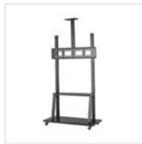
AL-02 IFPD Stand