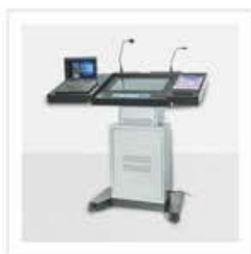
AL-DL 04 Height Adjustable Digital