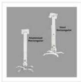
AL-Projector Ceiling Mount