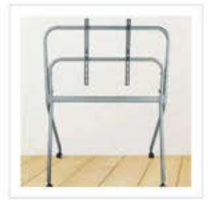
AL-01 IFPD Stand