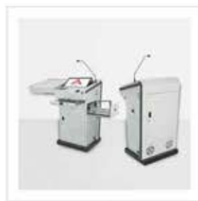
AL-DL 01 Digital Lectern