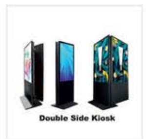
Double Side Kiosk