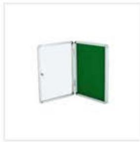
AL-Acrylic Door Covered Notice Board