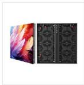
AL-Active LED Display