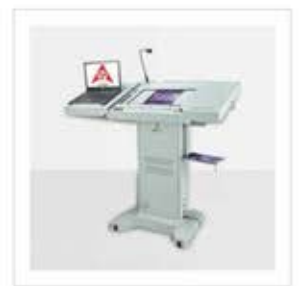
AL-DL 03 Digital Lectern