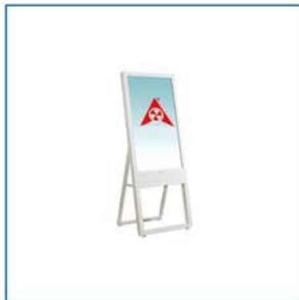
A TYPE KIOSK