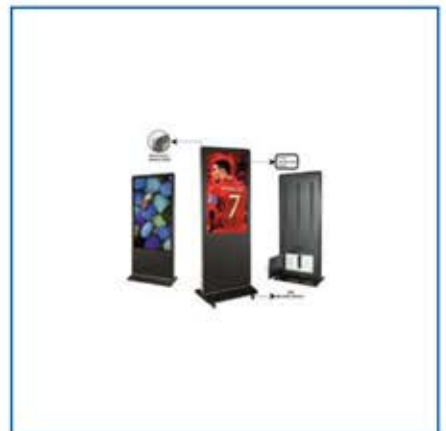
B TYPE KIOSK