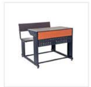
AI - Benches