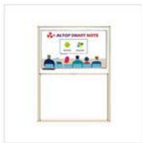
AL-02 Vertical Sliding System