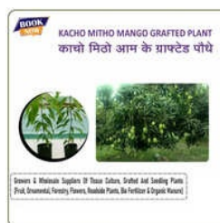
KACHO MITHO MANGO GRAFTED PLANT