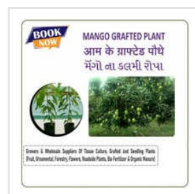
Dasherri Mango Plants