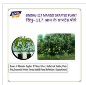
Sindhu Mango Grafted Plant