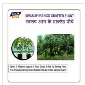
Taiwan Mango Grafted Plant