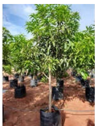
VANRAJ TOTA MANGO GRAFTED PLANT

15 No Papaya Plant, Acetobacter Bio Fertilizer, Add-80 Herbal Base, Adverb Animal Repellent, Agriculture Crop Cover, All Time Mango Grafted Plant, Aloo Bukhara Plants, Alphonso Mango Grafted Plant, Alphonso Mango Plant, Ambica Red Guava Tissue Culture Plants, Amla Grafted Plant, Amrapali Mango Grafted Plant, Animal Repellent Bio Fertilizer, Anjeer Plant, Anjeer Tissue Culture Plant, etc.