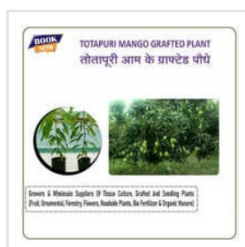
Totapuri Mango Grafted Plant