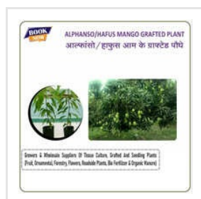
Alphanso Mango Grafted Plant