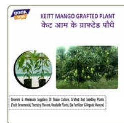
KEITT MANGO GRAFTED PLANT