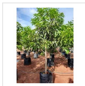
Hathi Julia Mango Grafted Plant