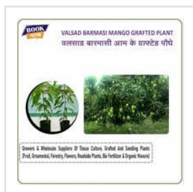
Valsad Barmasi Mango Grafted Plant