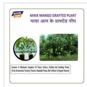
Maya Mango Grafted Plant