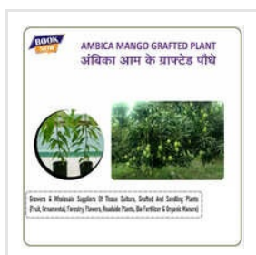
Arunika Mango Grafted Plant