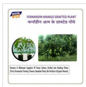
Fernandin Mango Grafted Plant