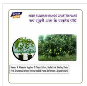
Roop Sundari Mango Grafted Plant