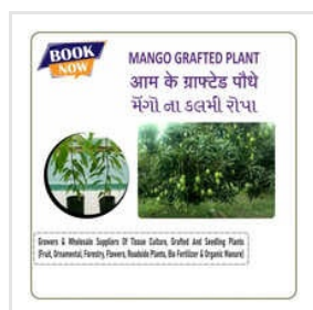
Mallika Mango Plant