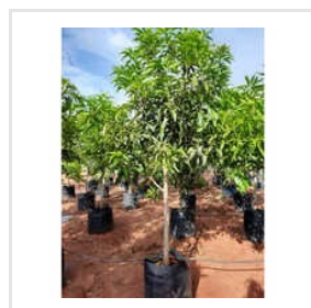
Chinna Rasam Mango Grafted Plant