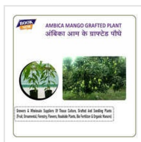
Bajrang Barmasi Mango Grafted Plant