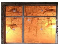
Fire Proof Window Glass