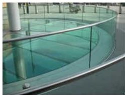
TOUGHENED BALUSTRADE GLASS

10-20 mm Ceramic Printed Glass, 12-40 mm Bulletproof Security Glass, 4MM-6MM Dressing Room Mirror, Ceramic Fritted Glass, Color EVA Laminated Glass, Decorative Window Glass, Door Partition Toughened Glass, Double Glazing Glass, Double Glazing Toughened Glass, EVA Laminated Coloured Film Glass, Extra Clear Toughened Glass, Fabric Laminated Glass, Fire Proof Window Glass, Heat Soak Glazing Glass, Heat Strengthened Glass, etc.