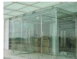
Door Partition Toughened Glass