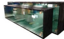
Double Glazing Toughened Glass