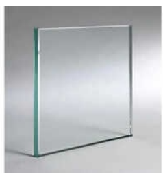
Transparent Toughened Glass