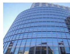
Double Glazing Glass