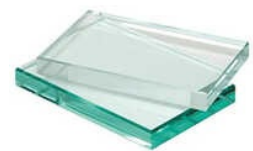
HEAT STRENGTHENED TOUGHENED GLASS