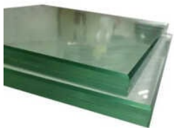
Toughened Safety Glass