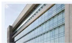
Laminated Glazing Glass