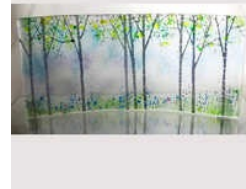
Decorative Window Glass