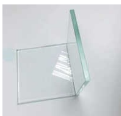
Extra Clear Toughened Glass