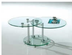
Table Toughened Glass