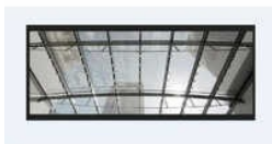
Heat Strengthened Glazing Glass