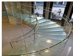
SAFETY TOUGHENED GLASS