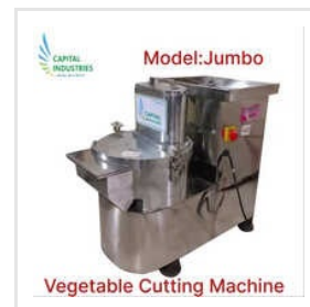
Jumbo Vegetable Cutting Machine