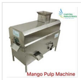
Industrial Juice Making Machine