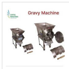
Blower Pulverizer Machine