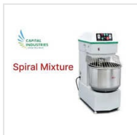
25 Kg Spiral Mixer Machine