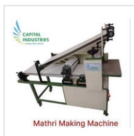
Mathri Making Machine