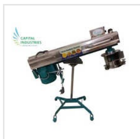
Farsan Namkeen Making Machine