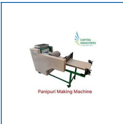
INDUSTRIAL PANI PURI MAKING MACHINE

1 HP Coating Machine, 10 Kg Dough Kneader Machine, 12 Tray SS Live Steam Dhokla Machine, 13.5 HP Electric Papad Dryer Machine, 2 In 1 Stainless Steel Pulverizer Machine, 20 Kg Potato Peeler Machine, 25 Kg Semi-Automatic Potato Peeler Machine, 25 Kg Spiral Mixer Machine, 400x160x360 mm Oil Press Machine, 5 Liter Planetary Mixer Machine, 50 Kg Spice Mixing Machine, 5kg Stainless Steel Dough Kneader Machine, 7x4 Feet Sanitation Disinfection Tunnel, Automatic Besan Mixing Machine, Automatic Papad Making Machine, etc.