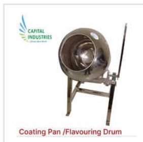
Flavoring Coating Machine