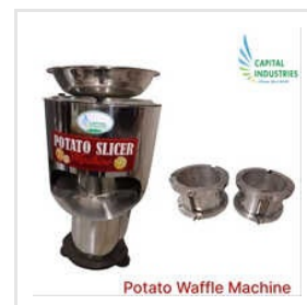
20 Kg Potato Peeler Machine