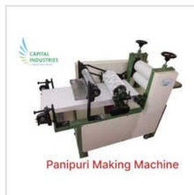
Semi-Automatic Pani Puri Making Machine