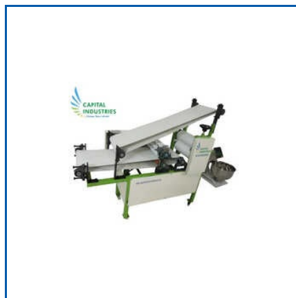
FULLY AUTOMATIC PANI PURI MACHINE