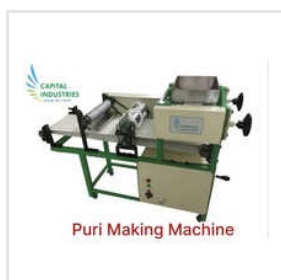
Poori Making Machine