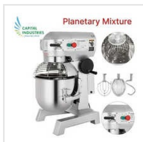
5 Liter Planetary Mixer Machine