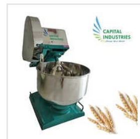
10 Kg Dough Kneader Machine