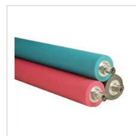
Nitrile Rubber Roller