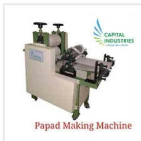
Semi Automatic Papad Making Machine