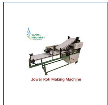
JOWAR CHAPATI MAKING MACHINE