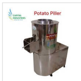
25 Kg Semi-Automatic Potato Peeler Machine