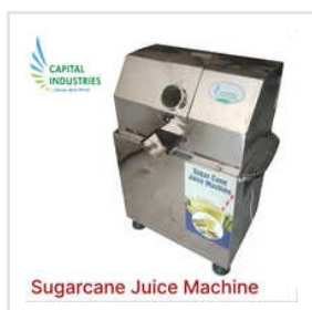
Sugarcane Juice Processing Machine