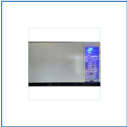
SD-105 E ADBLUE DISPENSER BOOTH