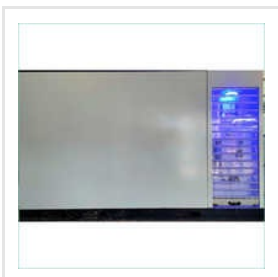
SD-105 E Adblue Dispenser Booth