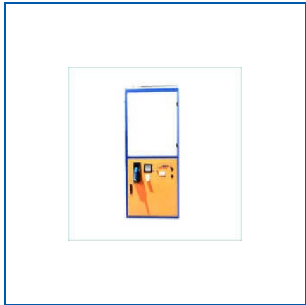
SD-105 - 2K ADBLUE DISPENSER BOOTH