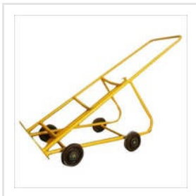
Material Handling Trolley