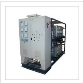
Automatic Electro Deionizer