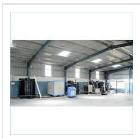
DEF BLUE Making Machine