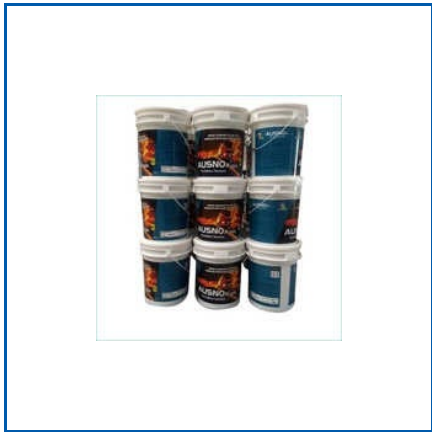
AD BLUE DIESEL EXHAUST FLUID

Ad Blue Diesel Exhaust Fluid, Adblue Def Making Machine, Adblue Diesel Exhaust Fluid Making Machine, Alkaline Water Treatment Plant, Automatic Deionization System, Automatic Double Nozzle Liquid Filling Machine, Automatic Electro Deionizer, Boiler Water Treatment Plant, Def Blue Making Machine, Hydraulic Oil Filtration System, Etc.