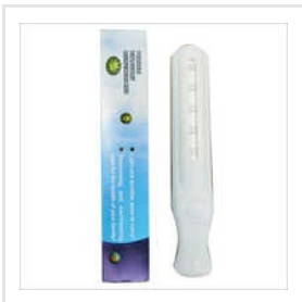
Portable Ultraviolet Disinfection Rod