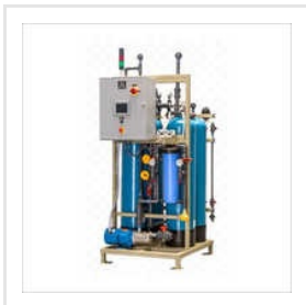
Automatic Deionization System