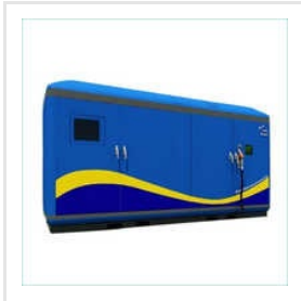
Adblue DEF Making Machine