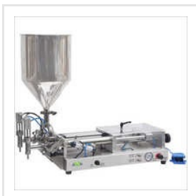
Automatic Double Nozzle Liquid Filling