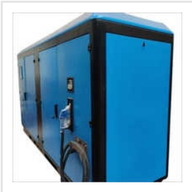
Adblue Diesel Exhaust Fluid Making Machine