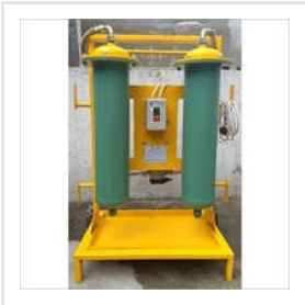
Hydraulic Oil Filtration System