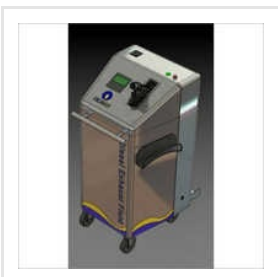
Portable Diesel Exhaust Fuel Dispenser