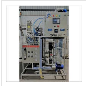
Industrial Water Treatment Plant