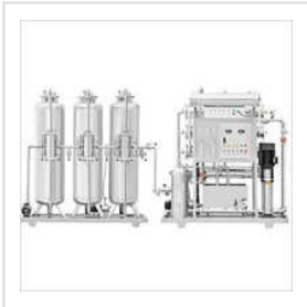
Alkaline Water Treatment Plant