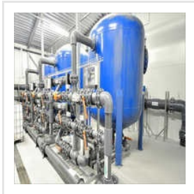
Boiler Water Treatment Plant