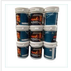
Ad Blue Diesel Exhaust Fluid