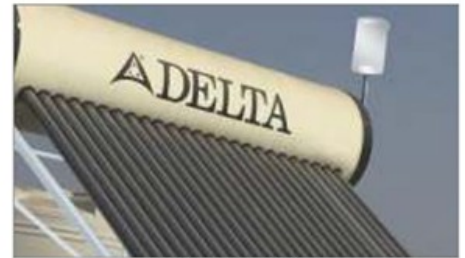
ETC Pressurised System