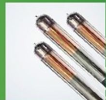
THREE TUBE LAYER