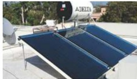
FPC pressurised System