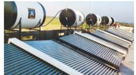
Many Foil Solar Water System

Our Commitment: · We may design and install customized product. · Free plumbing guidance for any hot water system.