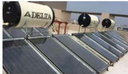
Project FPC Pressurised System