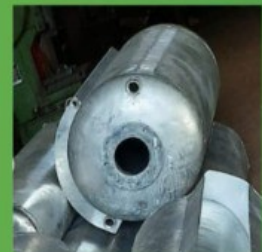
HOT DIP GALVANIZE CONTAINER