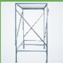
HOT DIP GALVANIZE STAND

• Ceramic coating also available in some model