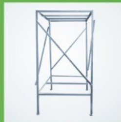
HOT DIP GALVANIZE STAND