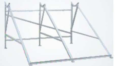
Hot Dip Galvanize Optional Stand