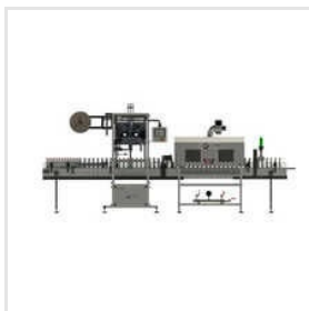
SA-SP Shrink Sleeve Label Machine