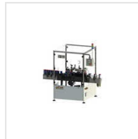
Wrap Around Bottle Labeling Machine