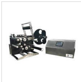
Semi Automatic Manual Labelling