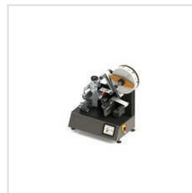
Semi Automatic Tube Labeling Machine