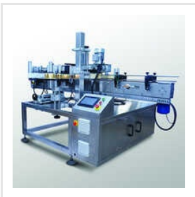
Front And Back Labelling Machine