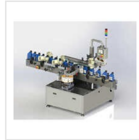
FB-SP Sticker Labelling Machine