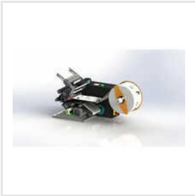
Semi Automatic Labeling Machine