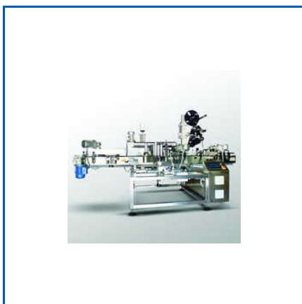
COMBI LABELLING MACHINE

Automatic Combi Sticker Labelling Machine, Automatic Sleeve Applicator Machine, Combi Labelling Machine, Curved Slat Chain Conveyor, FB-SP Sticker Labelling Machine, FB-SV Automatic Combi Sticker Labelling Machine, FBWR-SV Automatic Sticker Labelling Machine, FBWRTB-SV Bottle Sticker Labelling Machine, Front And Back Labelling Machine, etc.