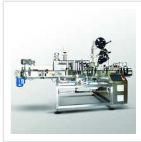
FB-SV Automatic Combi Sticker