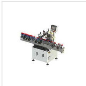
WR-SP Bottle Labelling Machine