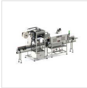
HA-SP Cap Sleeve Labelling Machine