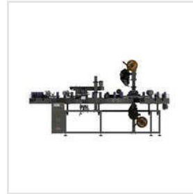
FBWR-SV Automatic Sticker Labelling