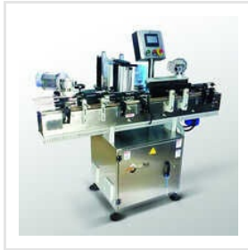
Wrap Around Labelling Machine