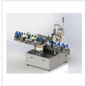
Automatic Combi Sticker Labelling