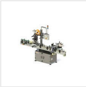
TWR-SP Top Side Labeling Machine