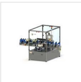
Front Back Labeling Machine