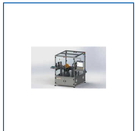
TAMPER EVIDENT LABELLING MACHINE