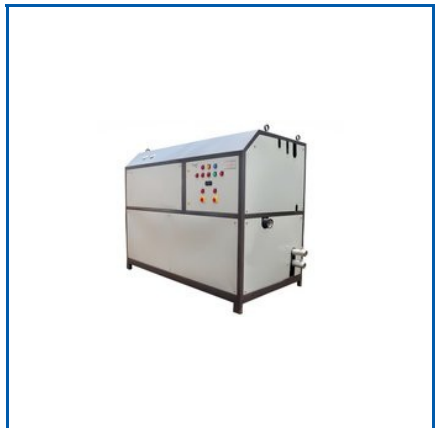
WATER COOLED CHILLING PLANT