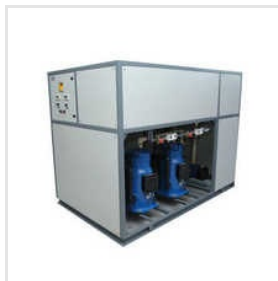
26 TR Glycol Chiller