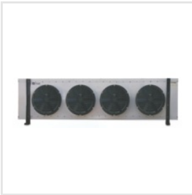
Energy Saving Cooling Unit