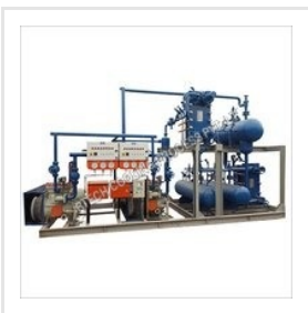
Skid Mounted Chiller