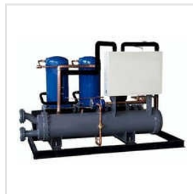
Water Cooled Scroll Chiller With Multiple