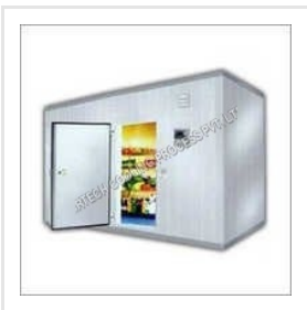
CA Cold Room