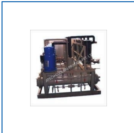
WATER COOLED SCREW CHILLER