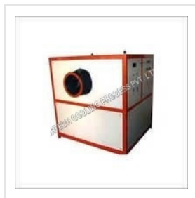
Industrial Air Chiller