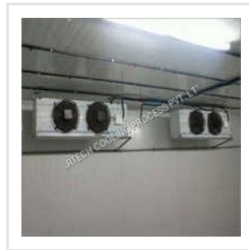
Cold Storage Chamber