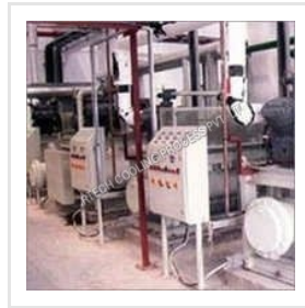
Industrial Refrigeration Plant