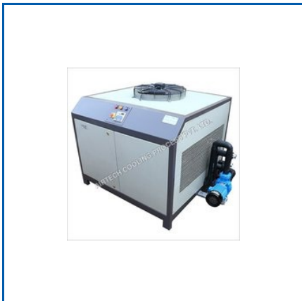
AIR COOLED CHILLER

26 TR Glycol Chiller, Air Cooled Air Chiller, Air Cooled Chiller, Air Cooled Chilling Plant, Air Cooled Screw Chiller, Ammonia Based Refrigeration Plant, Blast Chiller, Brine Chiller, CA Cold Room, Chilling Plant, Cold Rooms, Cold Storage Chamber, Cooling Unit, Energy Saving Cooling Unit, FRP Square Cooling Tower, etc.