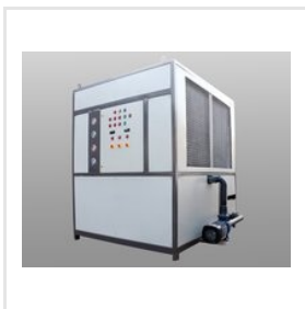
Air Cooled Chilling Plant