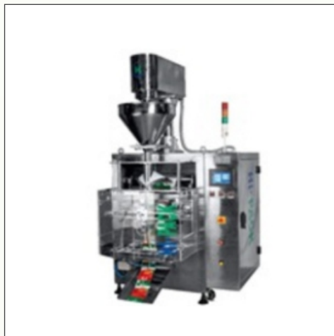
Automatic Pneumatic Form-Fill-Seal Auger Filler Machine