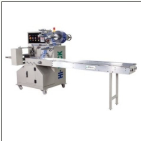
Horizontal Flow Wrap Machine