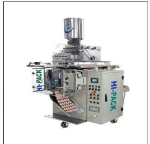
Automatic Multi Track(6 Track) F.F.S Machine