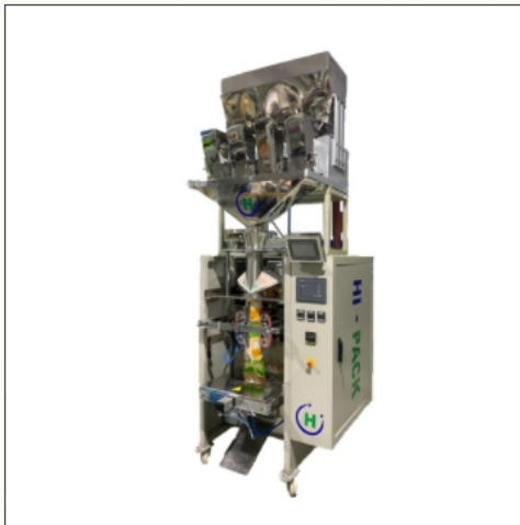
Automatic Form-Fill-Seal Pneumatic Collar Type Machine with Four Head