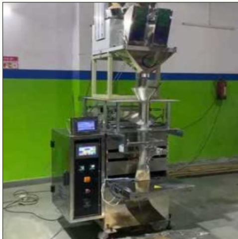
Automatic Form-Fill-Seal Pneumatic Collar Type Machine with Two Head