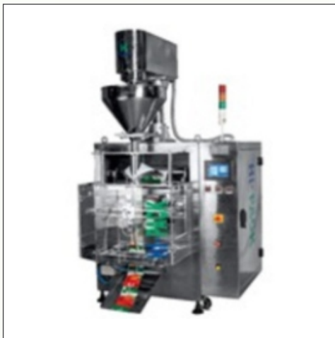
Spices Powder Packaging Machine