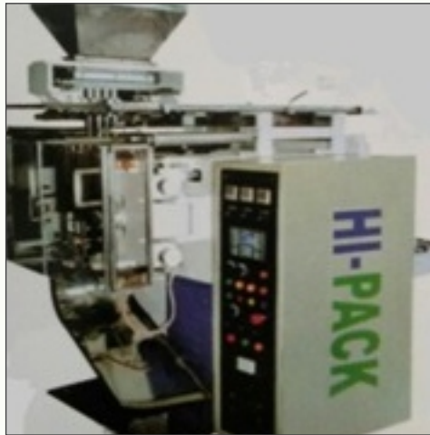
Automatic Multi Track (4 Track) F.F.S. Machine