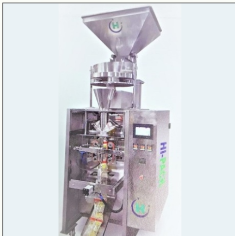
Automatic Salt Pouch Packing Machine