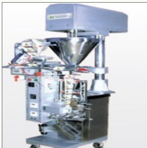
Automatic FFS Auger Filler Machine