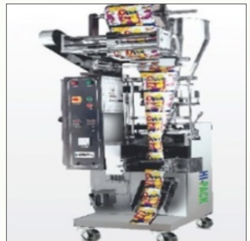
Automatic FFS Mechanical Machine