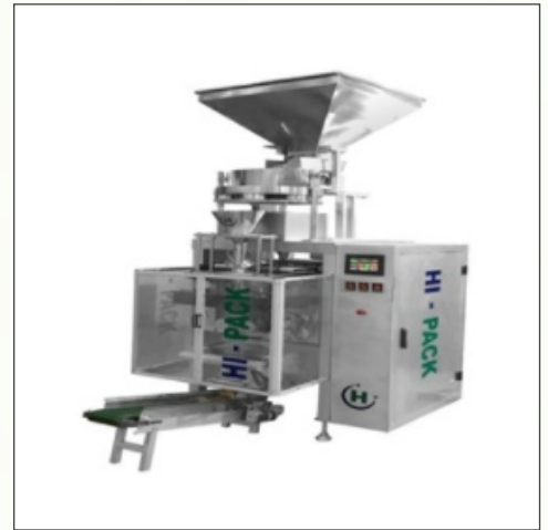
Automatic Hi-Speed Collar Type Machine with Double Servo