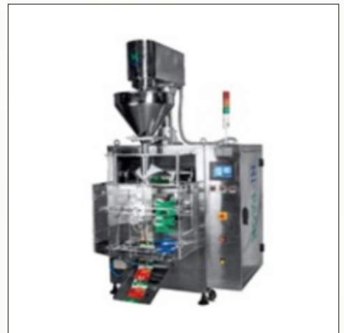
Automatic Wheat Flour Packing Machine