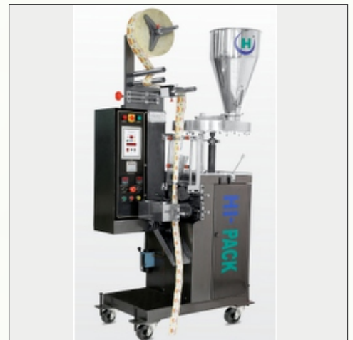
Granules & Powder Packing Machine