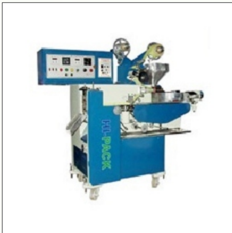
Candy Pillow Pack Machine