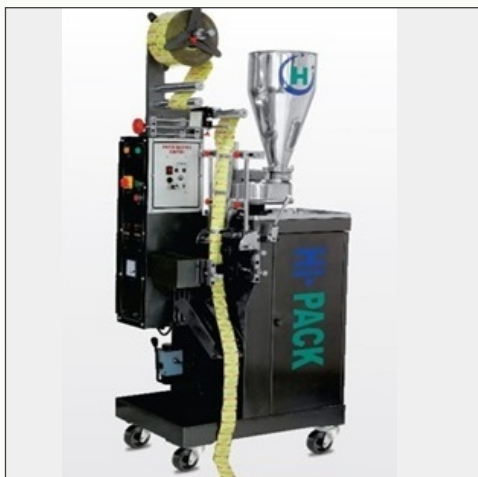
Automatic Form-Fill-Seal Machine