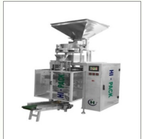
Automatic Snacks Hi-Speed Collar Type Packing Machine