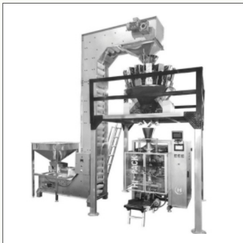
Multihead Pouch Packing Machine