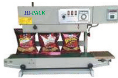
Continuous Sealer with Nitrogen Gas/Air Flushing Option