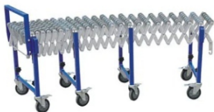
Roller Convery Expandable