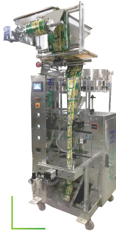
HP-095A Pneumatic Cup Filler Machine