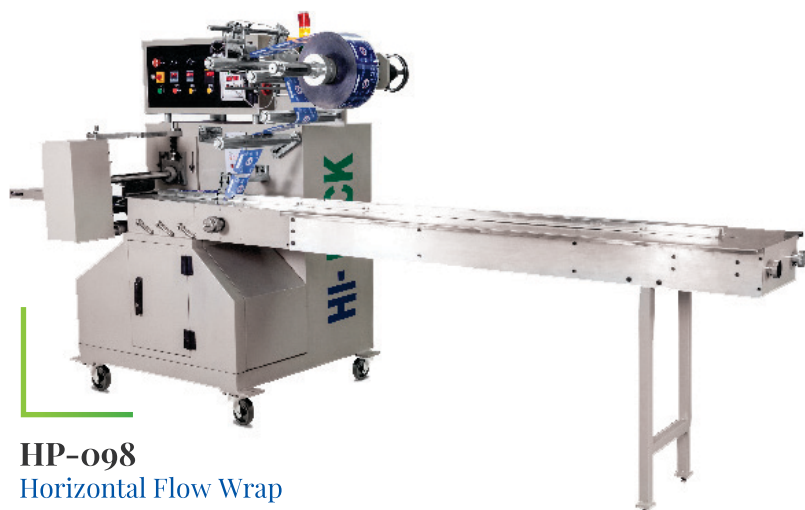
HP-098 Horizontal Flow Wrap