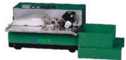
Continuous Batch Coding Machine