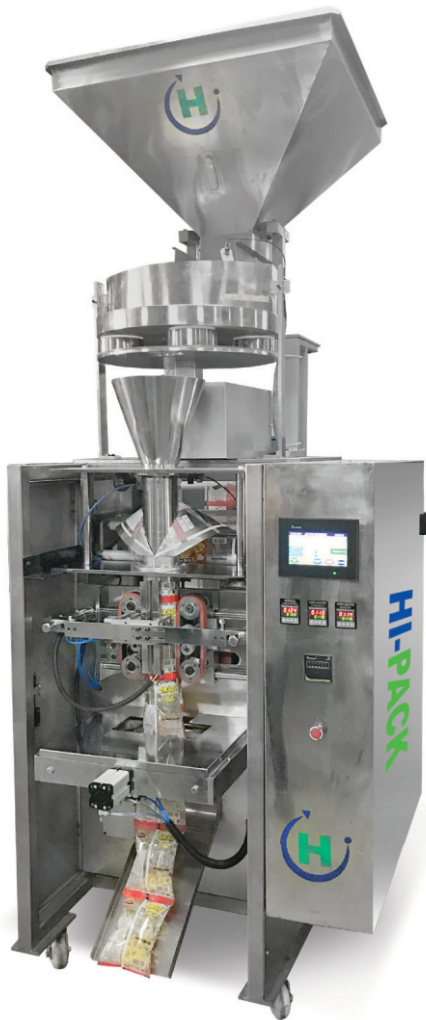
HP-101 Pneumatic Collar Type Machine