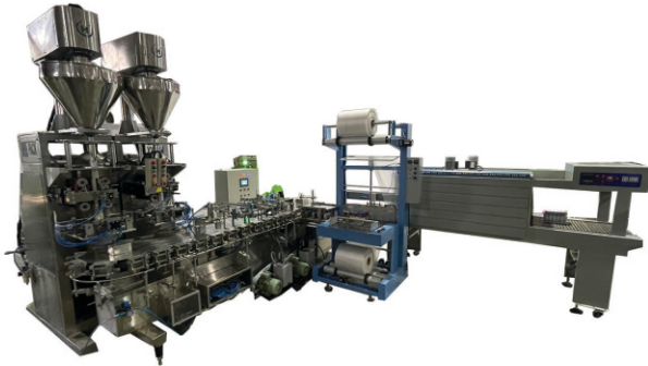
HP-110 Automatic Mono Carton Packing Machine