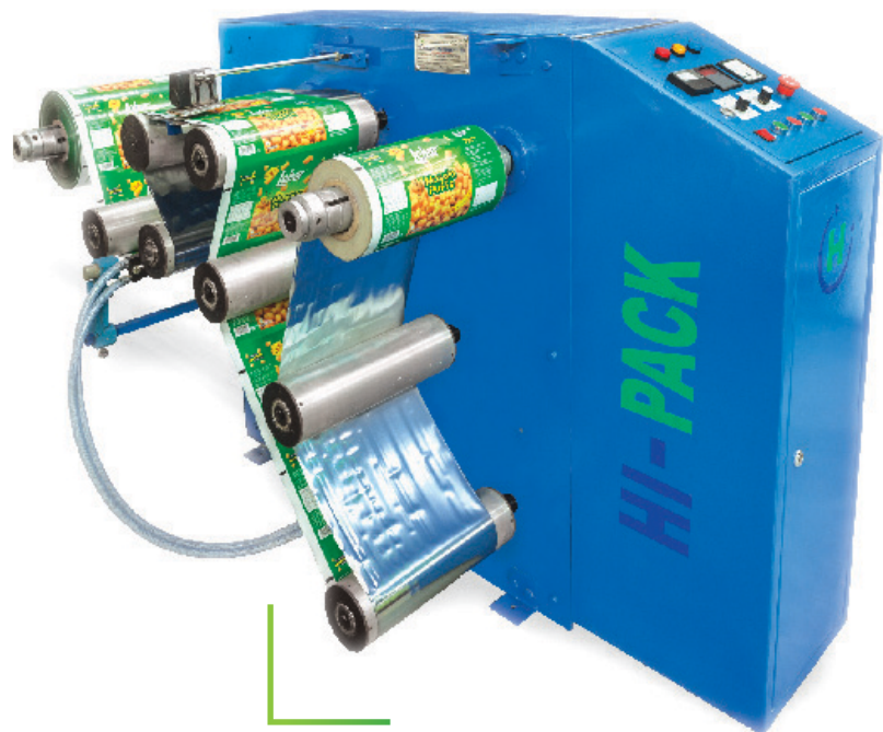
HP-109 Rewinding Machine