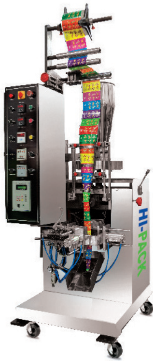
HP-095 FFS Pneumatic Triangle Machine