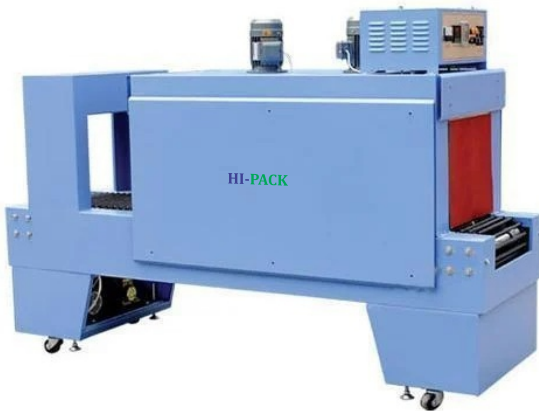
Heavy Duty Shrink Wrapping Machine for larger products (made to order)