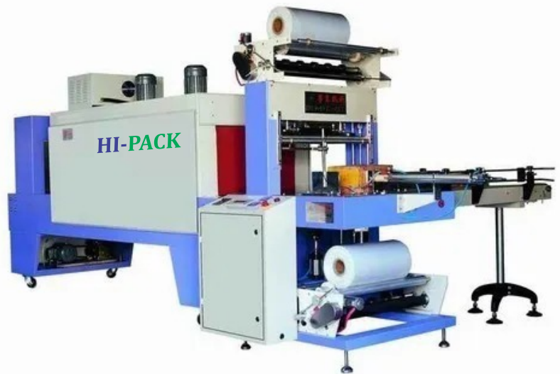
Fully automatic shrink wrapping machine (made as per the order)