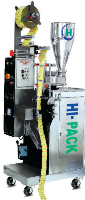
HP-099 FFS Cup Filler Machine