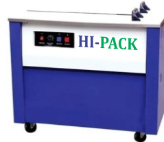
Semi Automatic Strapping Machine