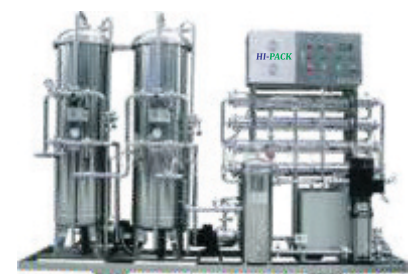
Reverse Osmosis Pure Water Machine