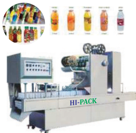
Fully Automatic HDPE / Pet Bottle Filling & Sealing Machine