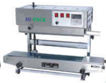
Multi Functional Film Sealer (Vertical Type)