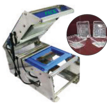
Manual Rectangular Container Sealing Machine