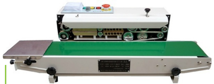
HP-105 Continuous Band Sealer