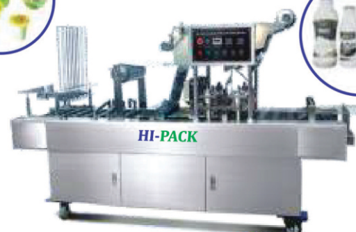
Automatic Glass / Cup / Bottle Filling and Sealing Machine