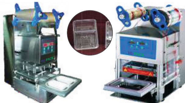
Automatic Container Sealing Machines