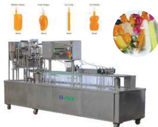
Fully Automatic Toy Jelly Filling & Sealing Machine