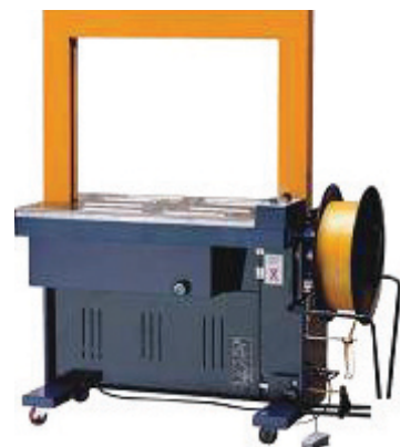
Fully Automatic strapping machine