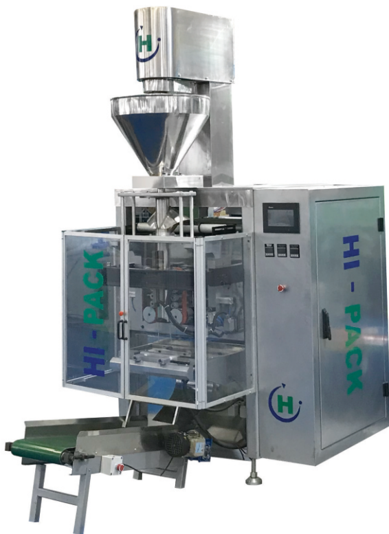
HP-103B Hi-Speed Servo Auger Filler Machine