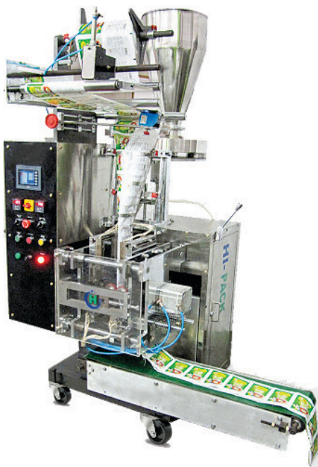
HP-094A Pneumatic Single Track