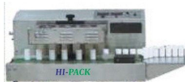
Continuous Induction Sealing Machine 14