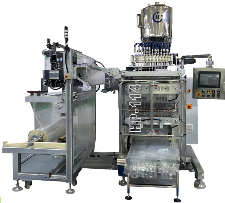
HP-114 Multi-track Liquid FFS Machine