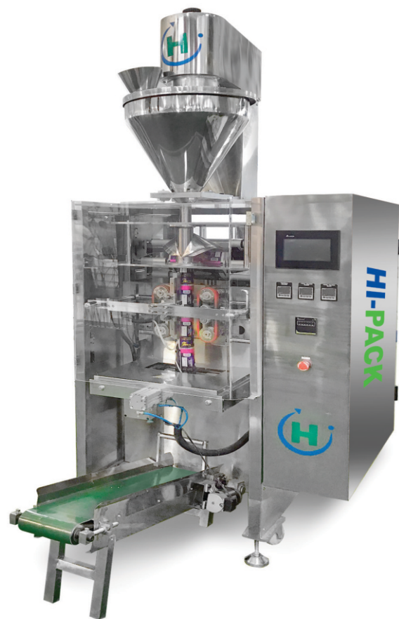
HP-102 Pneumatic Auger Collar Type Machine