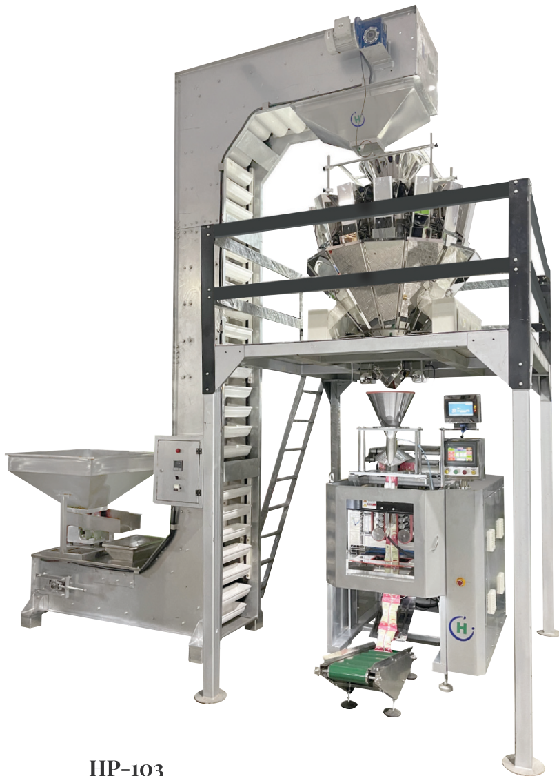
HP-103 Hi-Speed Servo Collar Type Machine