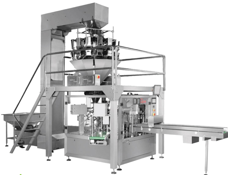
HP-104 Pick Fill Seal Machine