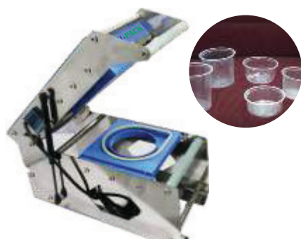
Manual Round Container Sealing Machine