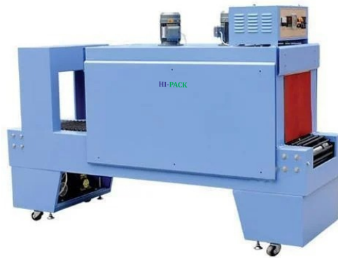
Shrink Wrapping Machine with L-Sealer available in 400/500/600 mm