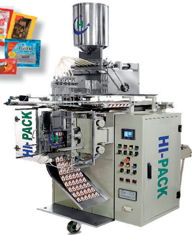
HP-106 Pneumatic Six Track