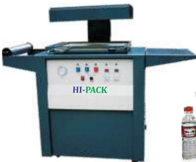
Skin Packaging Machine