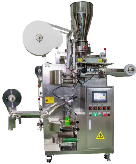
HP-DB-04 Dip Tea Packing Machine