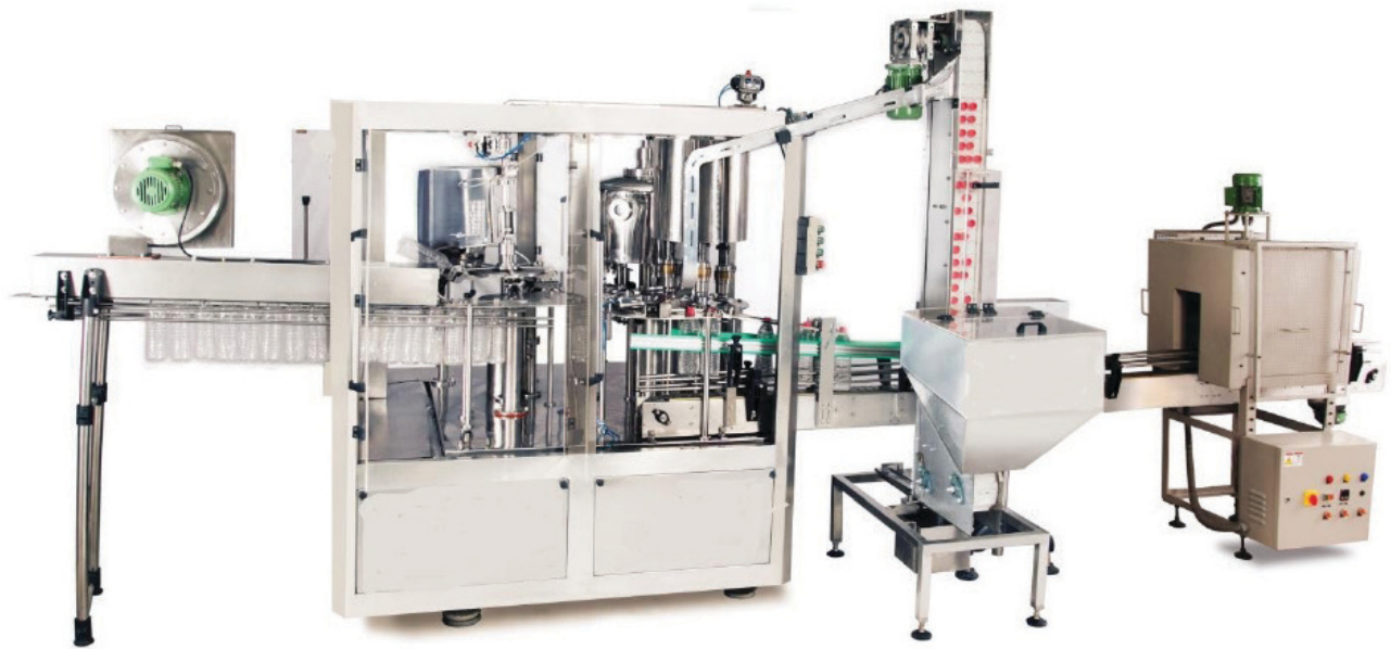
HP-113 Water Bottle Packing Machine