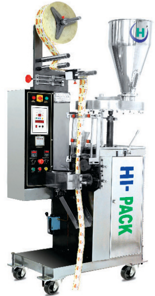
HP-099A FFS Hi-Speed Cup Filler Machine