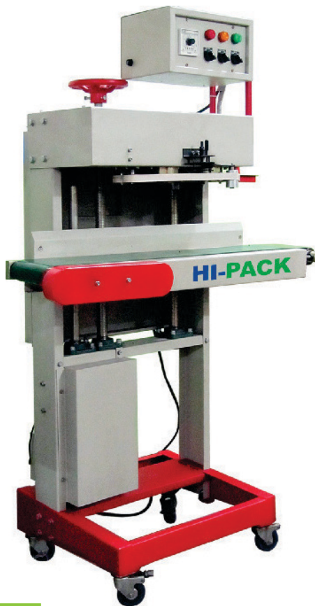
HP-105A Continuous Band Sealer