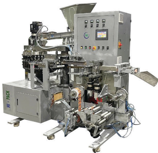
HP-112 Hi-Speed Rotary Packing Machine