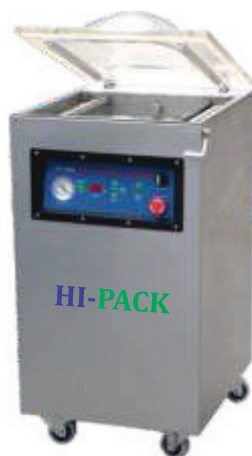
Vacuum Packing Machine with Double Sealing Bar Size : 400 / 500 / 600 mm