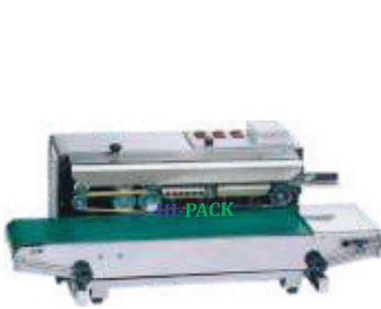
Multi Functional Film Sealer (Horizontal Type)