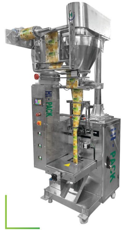
HP-095B Pneumatic Auger Filler Machine