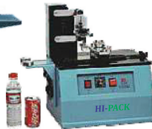
Pad Printing Machine