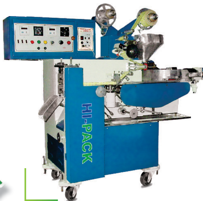
HP-100 Candy Pillow Pack