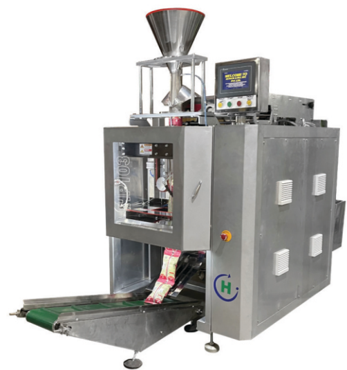
HP-103 Hi-Speed Servo Collar Type Bag Machine