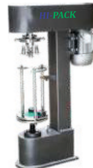
Locking & Capping Machine