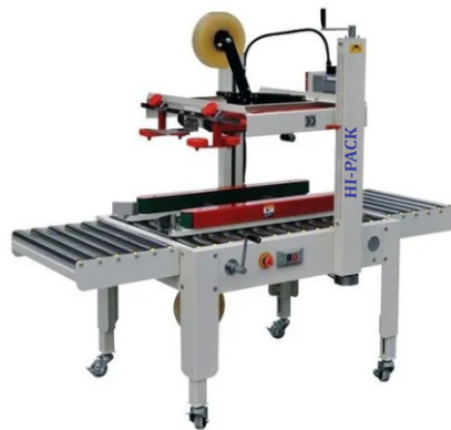
Carton Taping/ Carton Sealer