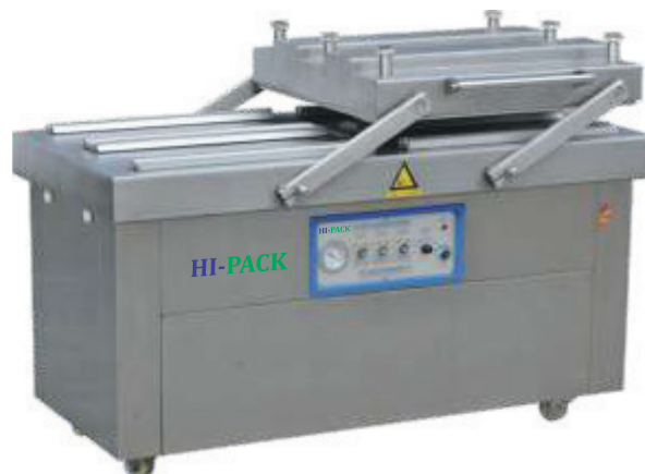
Vacuum Packing Double Chamber Size : 400 / 500 / 600 mm