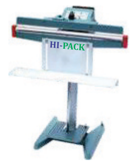
Pedal Sealer Size : 200 mm to 1000 mm