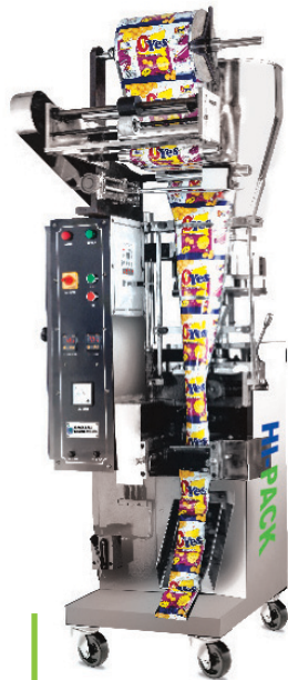
HP-096 FFS Cup Filler Machine