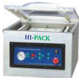
Table Top Vacuum Packing Machine Size : 300 to 350 mm