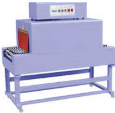
Shrink Tunnel Size : 400/450 mm