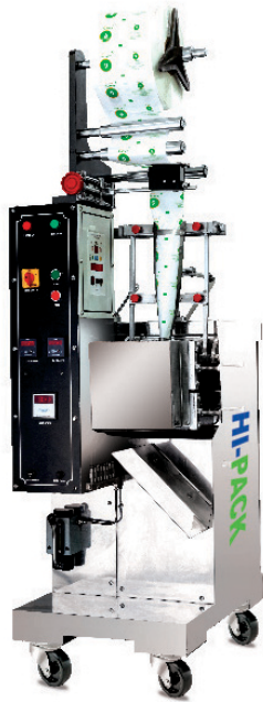
HP-094 FFS Pump Filler Machine