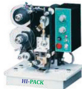
Semi Automatic Colored Tape Hot Printer 09