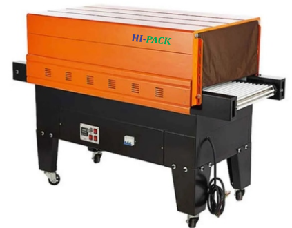
Thermal Shrink Packaging Machine Size : 450/550/600 mm