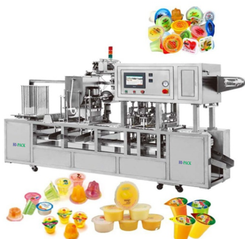
Fully Automatic Cup Jelly Filling & Sealing Machine