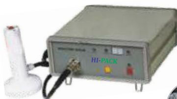
Manual Induction Sealing Machine 13