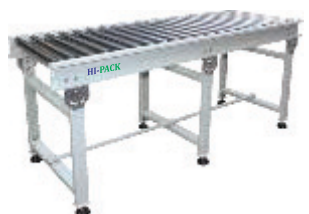
Rollar Conveyor Non Motorised