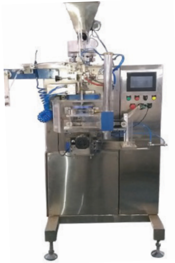
HP-111 Filter Khaini Packing Machine