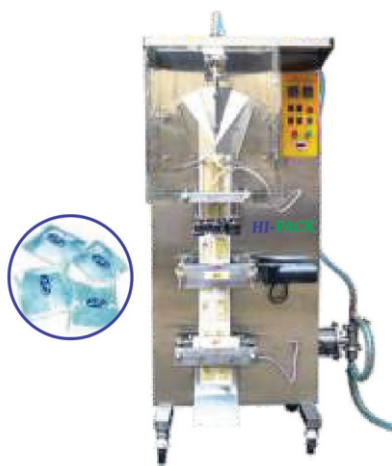
Automatic Liquid Packer