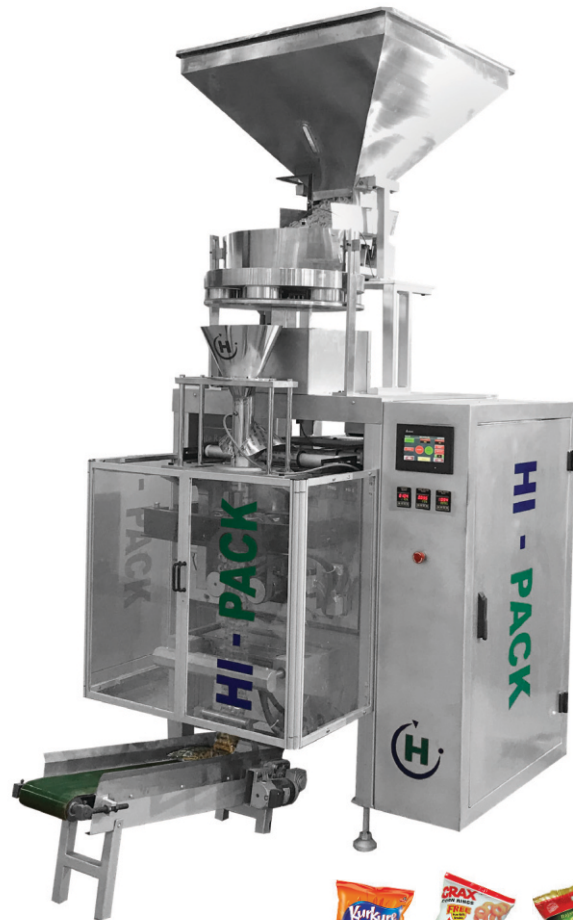
HP-103A Hi-Speed Servo Cup Filler Machine