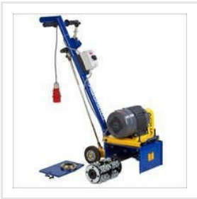
Concrete Scarifier With Cutter