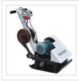
Plate Compactor Machinery