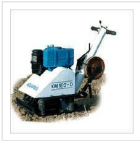
Industrial Plate Compactor