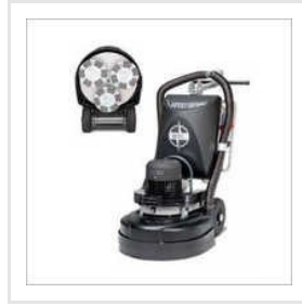
HTC Machines Concrete