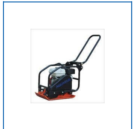
PLATE COMPACTOR MACHINE