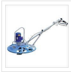
Walk Behind Trowles