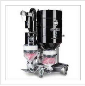
HTC Dust Extractors