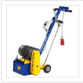
Surface Concrete Scarifier