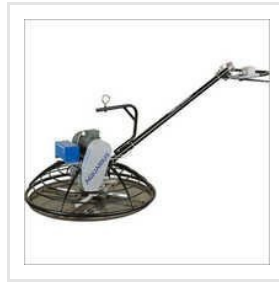
Walk Behind Floater