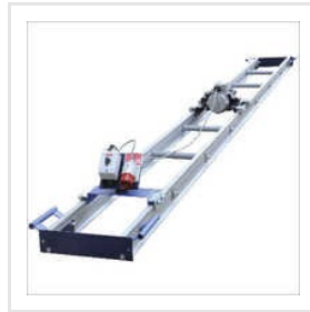
Double Beam Surface Vibrator SM