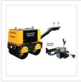
Walk Behind Roller