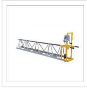
Fixed Form Paver