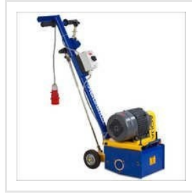
Concrete Surface Scarifier